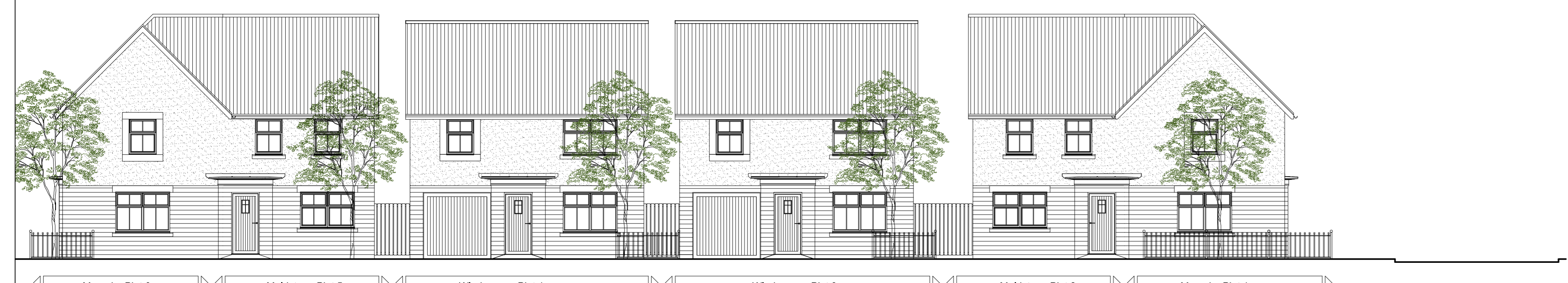
Streetscape A-A Continued...