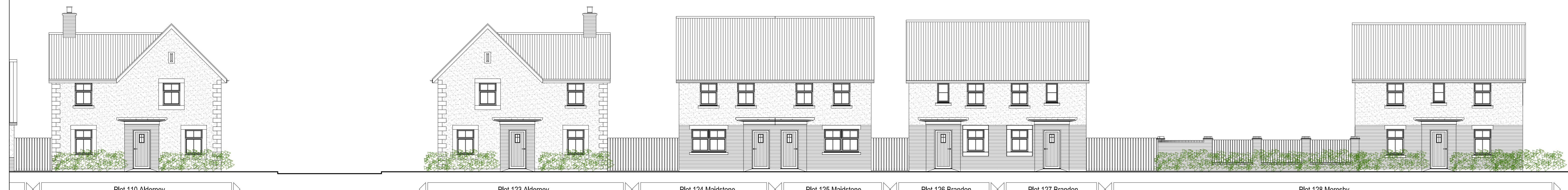
Streetscape C-C Continued