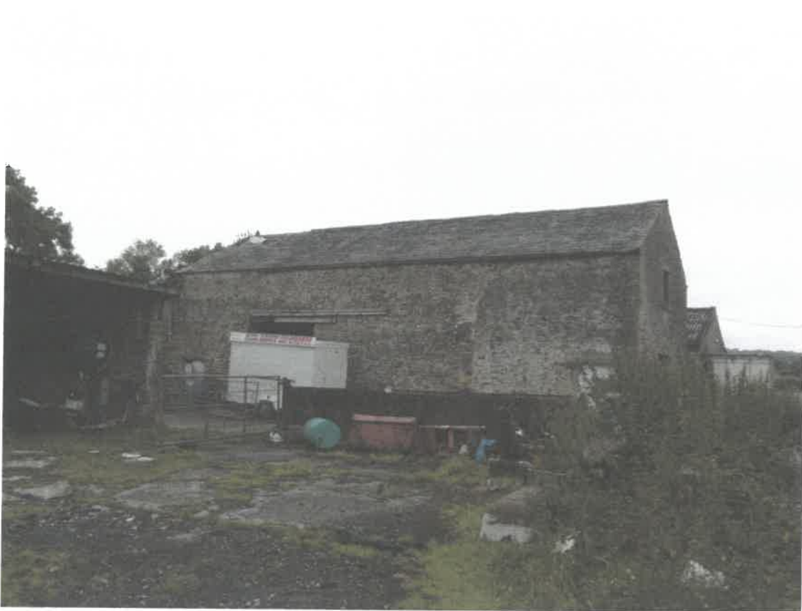
1 : Photo of the front elevation.