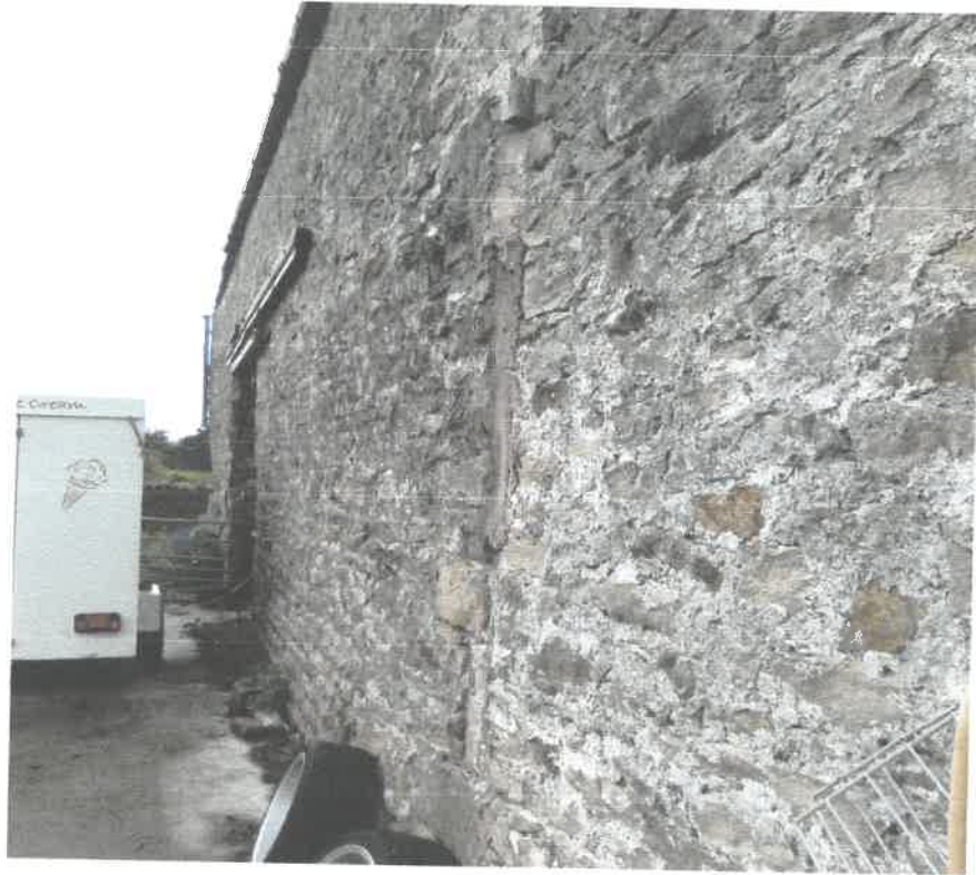
2a : Photo of Step in front elevation masonry