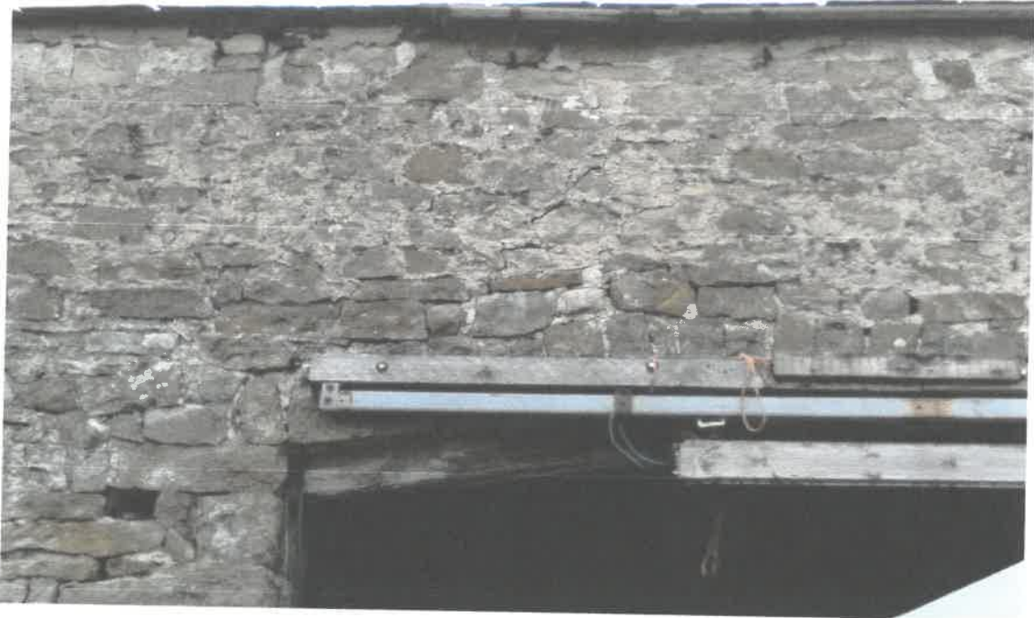
4 : Photo of Front elevation arched door-way.