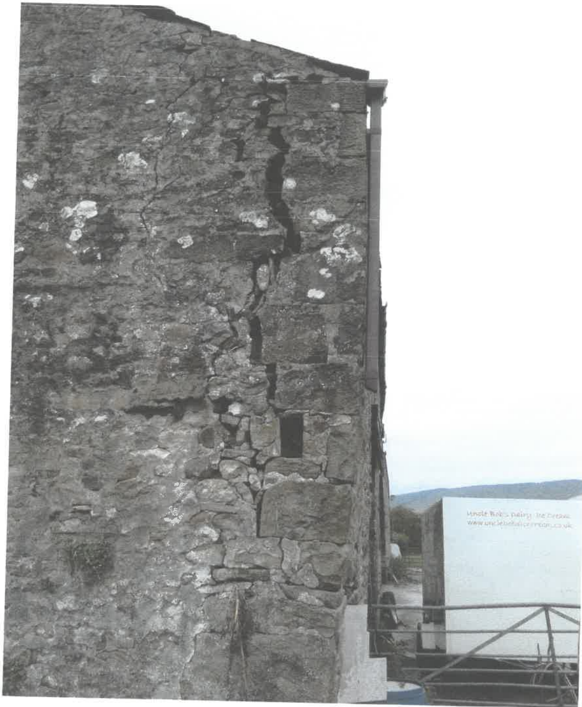
3c : Photo of West gable.