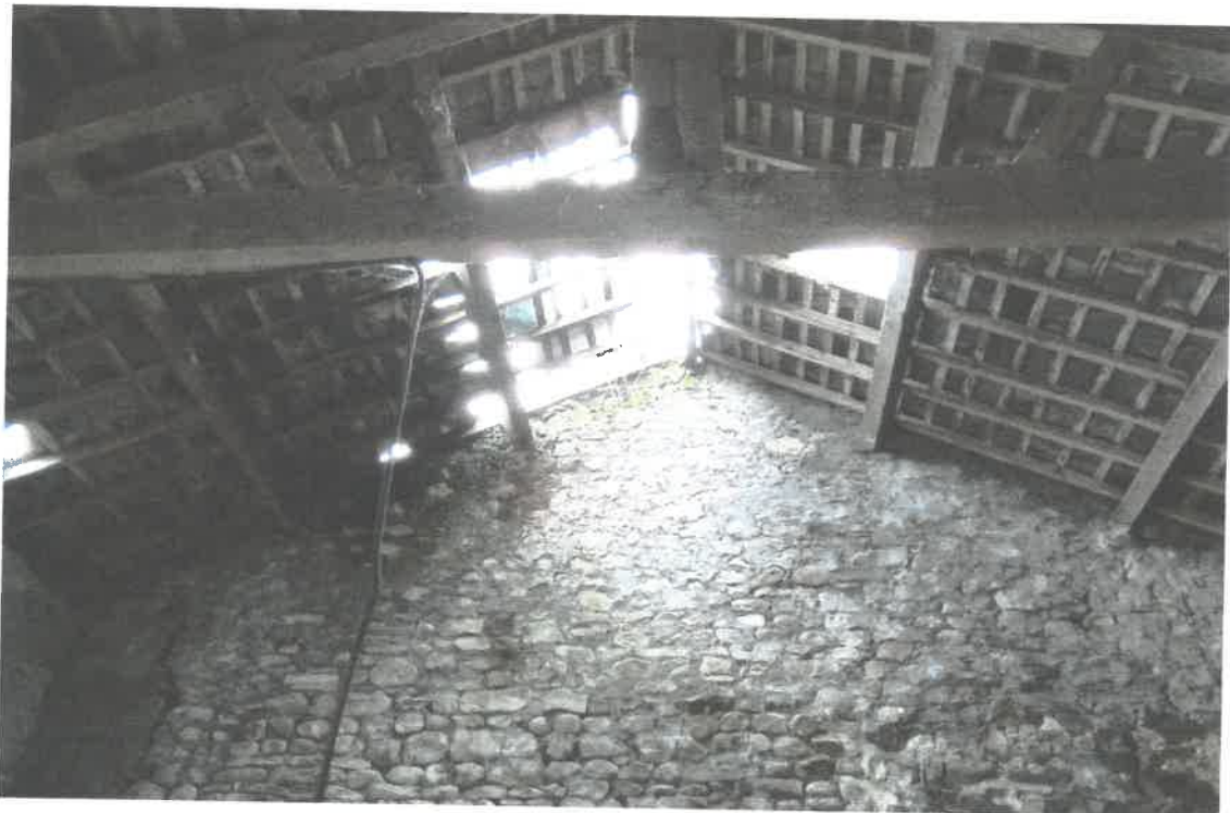
5a : Photo of internal roof structure – East gable end