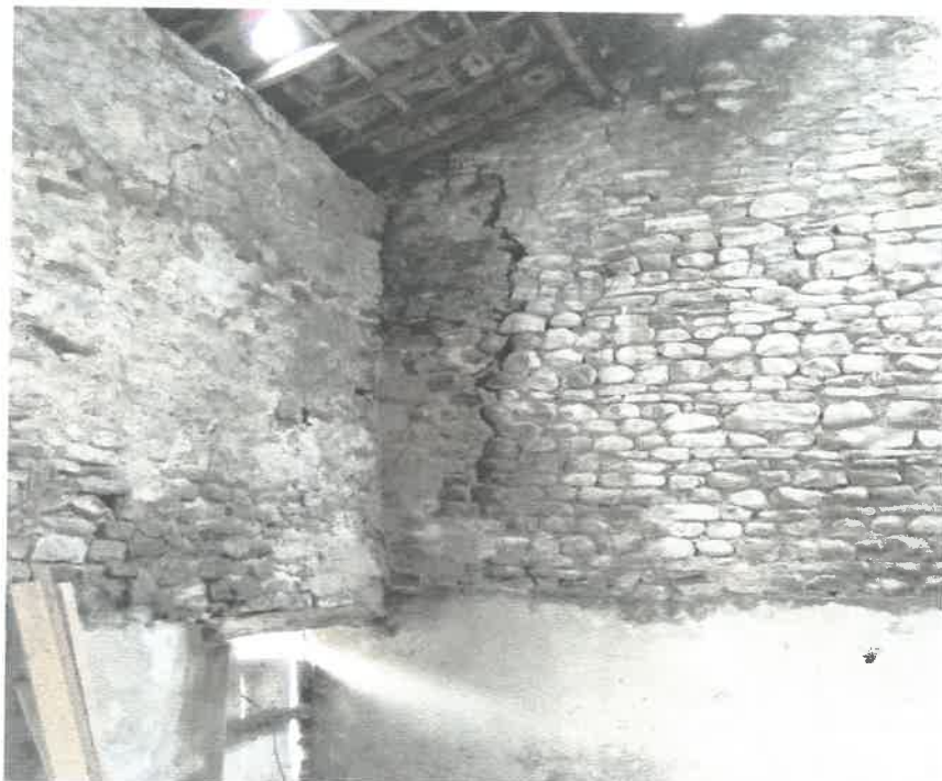
3b : Photo of West gable (Internally)