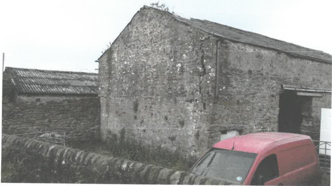
3a : Photo of West gable.