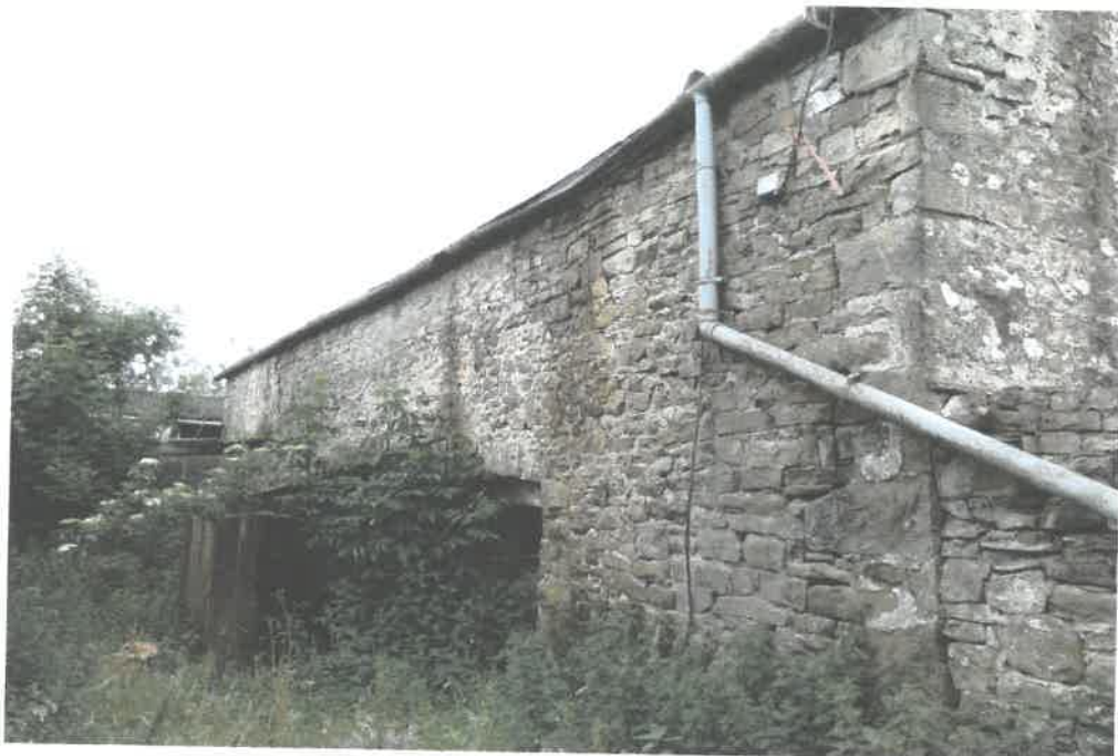
2b : Photo of Step in rear elevation masonry