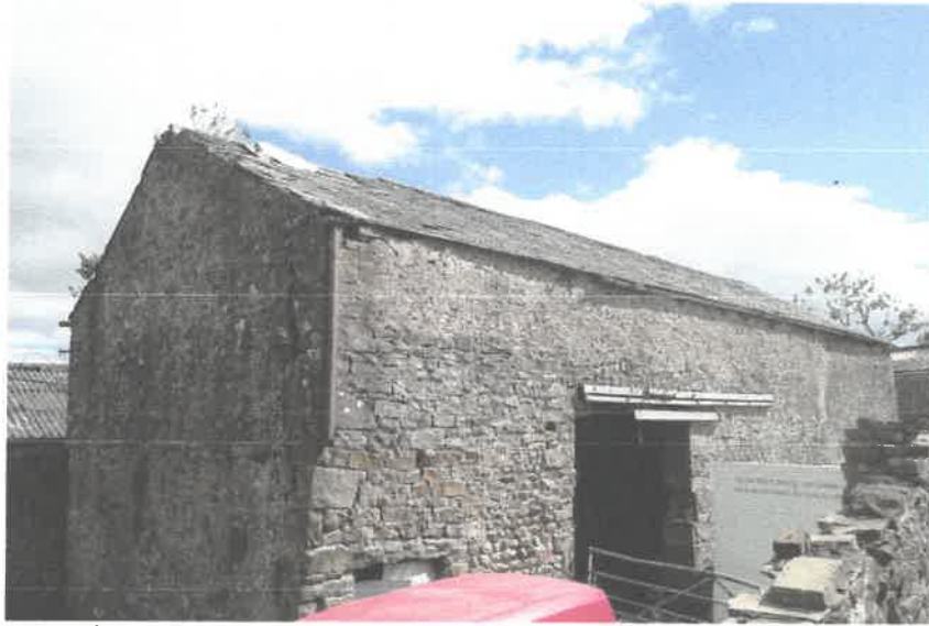
3 - A traditional stone built and slate roofed barn. Gaps and crevices are present in the external and internal walls. Roof slates are unlined and lifted tiles and missing tiles present. The building can be considered of high potential for roosting bats.