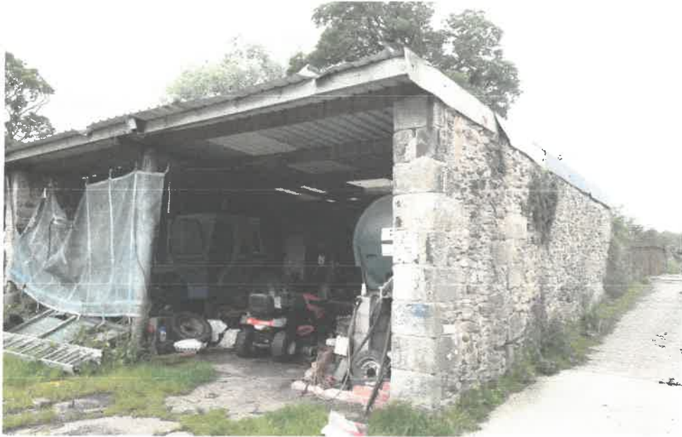
4 and 5 – An agricultural stone built lean to with single pitch corrugated roof used for storage and a modern single skin tractor store. The buildings offer low potential for roosting bats.