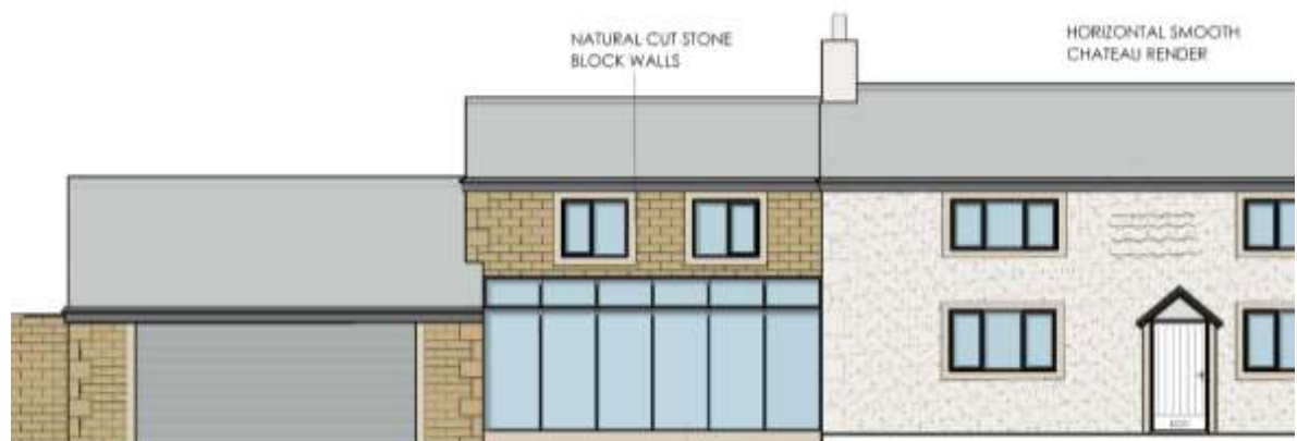
PL02: Proposed front (South) facing two storey side extension, glass link and replacement garage structure.

The roofs will now be of proposed gable forms removing the vast expanses of flat roofs currently present complete with natural slate roof coverings. The external walls are proposed to be of natural cut stone and painted render finishes throughout. Window and door systems will be a fixture of high quality metal and timber finishes with a mixture of Dark grey powder coated and natural finishes. Contemporary South facing glazed link will help distinguish between the old and the new.