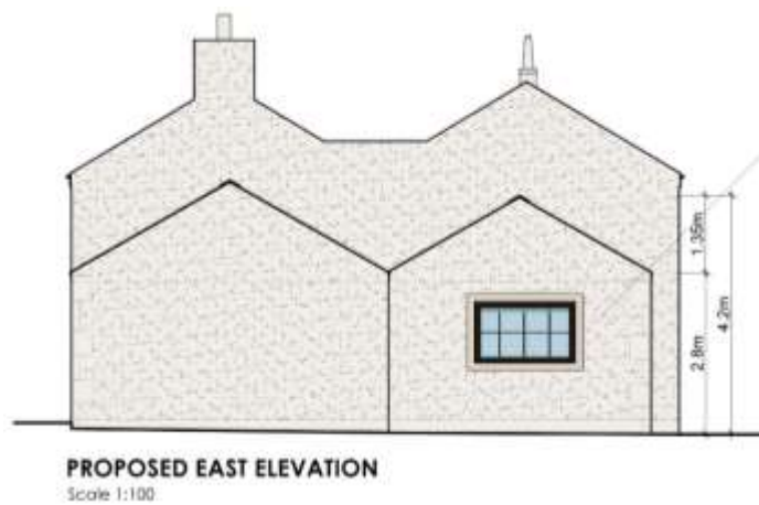
PL03: Existing single storey Sitting Room structure (left) and adjoining proposed rear single storey garden room / play room infill extension (right)