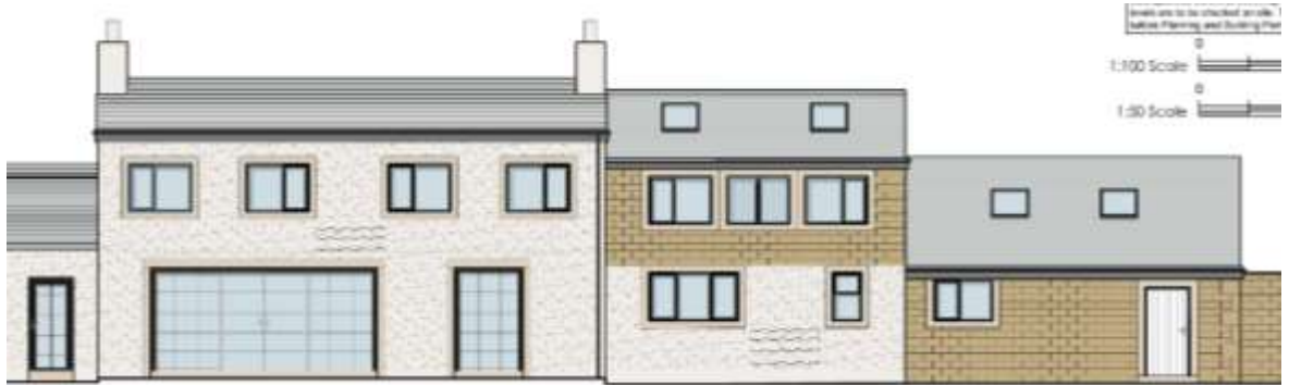
PL03: Proposed rear (North) facing elevation onto the private garden