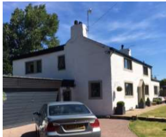
PL04: Existing unsightly rear (North) and side (West) elevations illustrating current expansions of incongruous flat roofs to be removed and remodeled as part of the overall improved character and appearance of the dwelling.