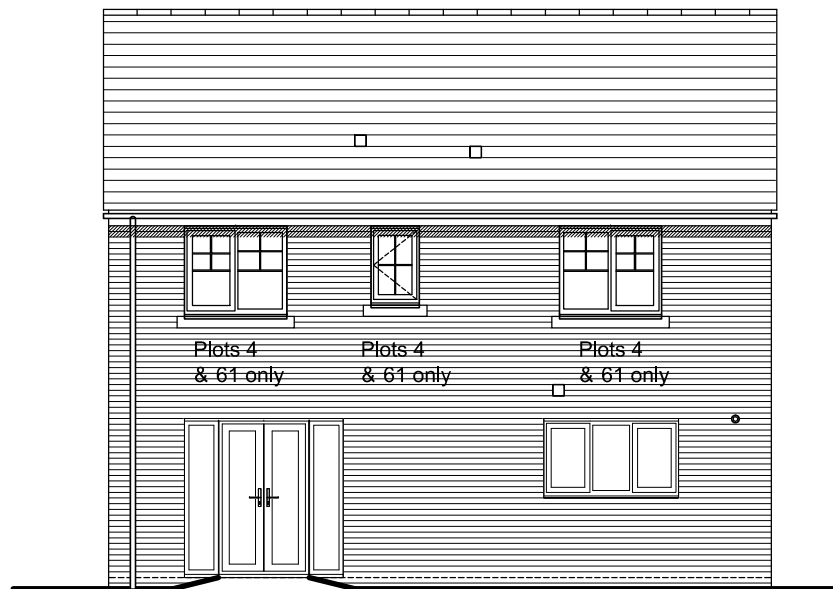
SIDE ELEVATION (PLOTS 4 & 61 ONLY)