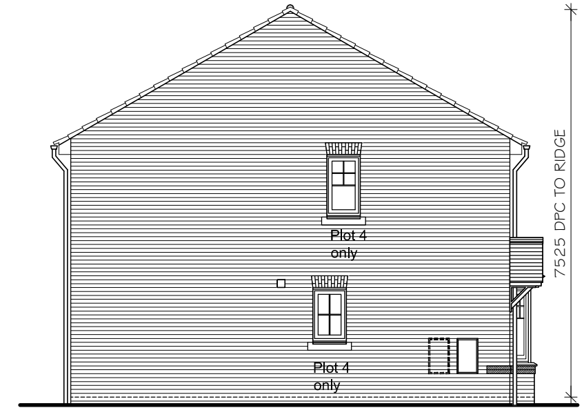
SIDE ELEVATION (PLOTS 4 ONLY)