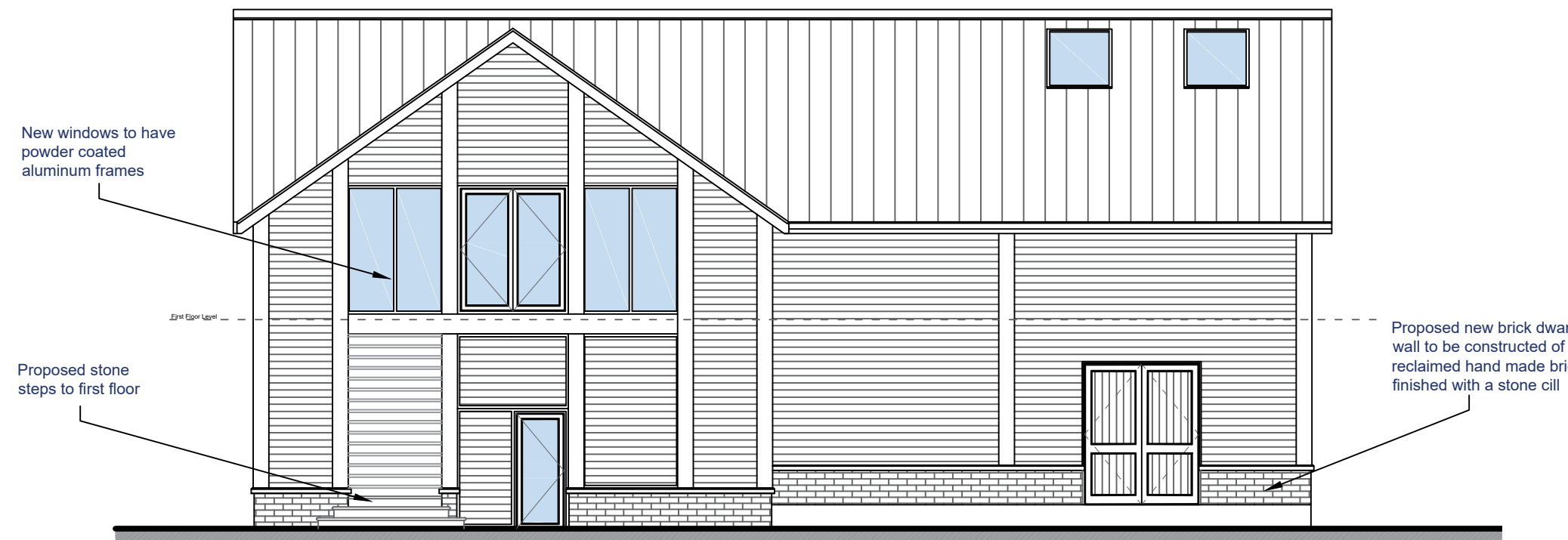
4 Proposed Elevation Scale (1:100)