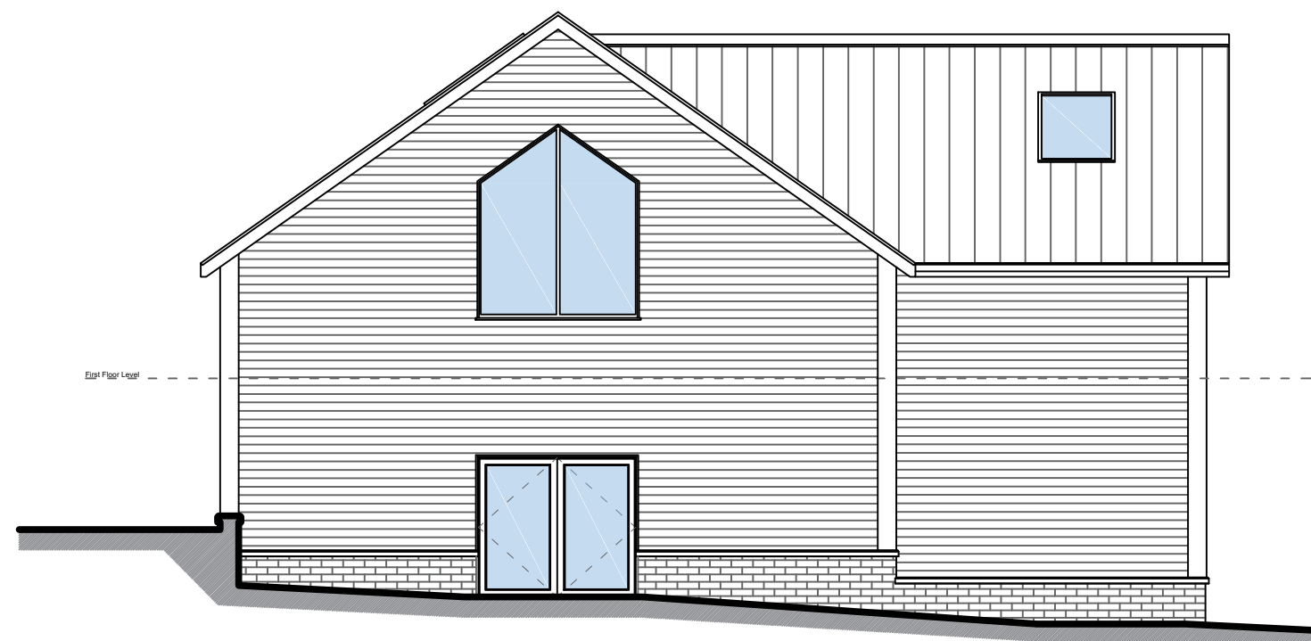
1 Proposed Elevation Scale (1:100)