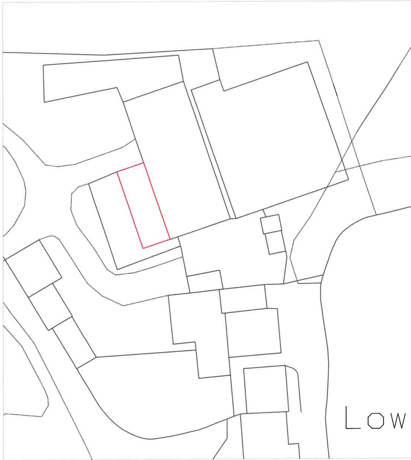
Site Plan - 1:500