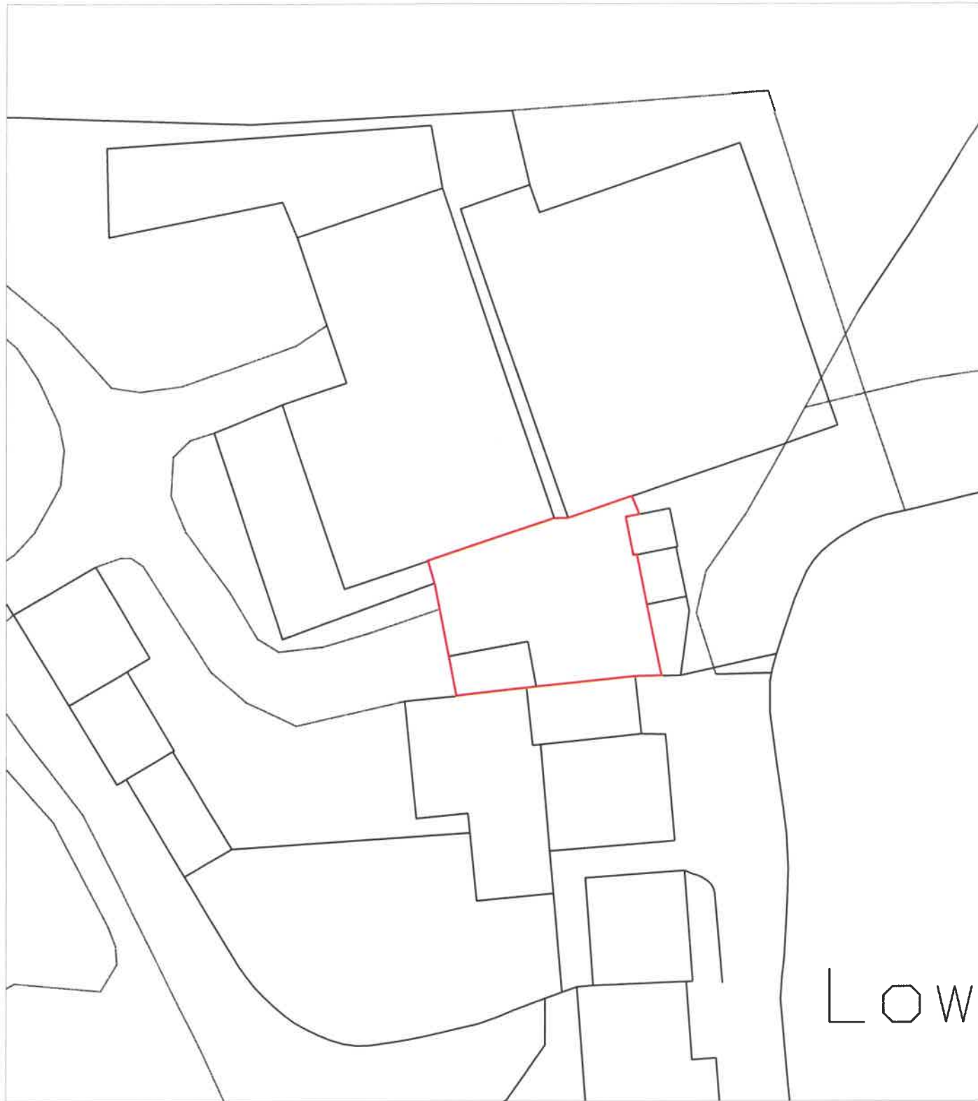
Site Plan - 1:500