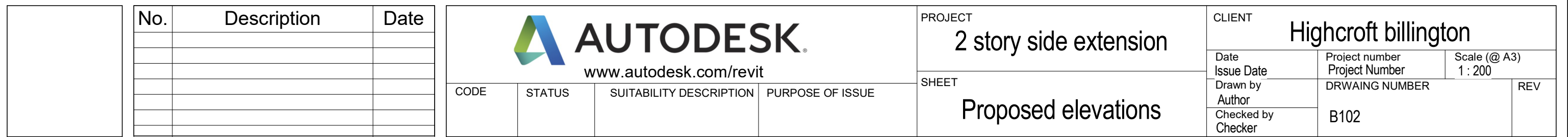
4 West 1 : 200