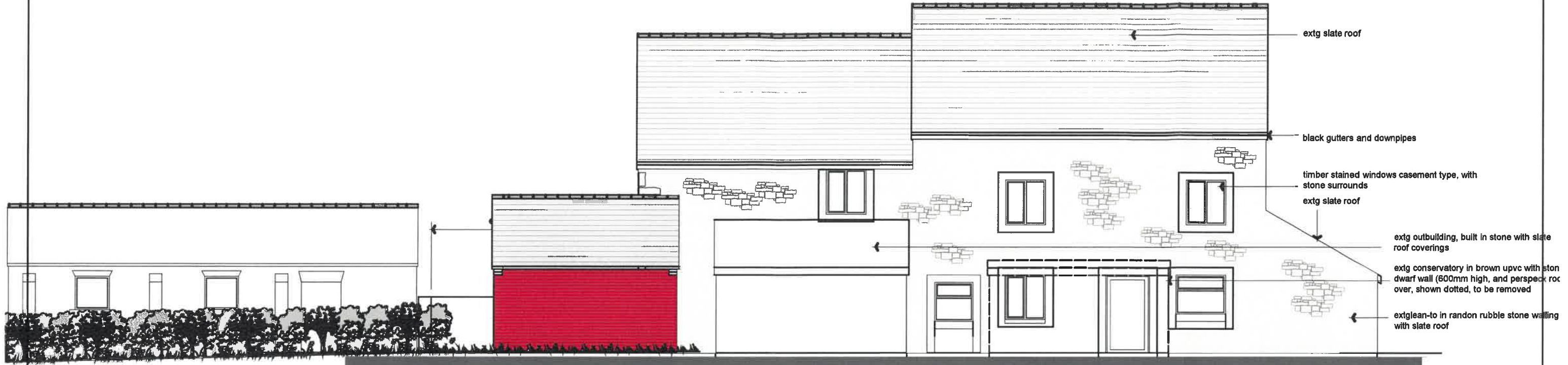
ELEVATION FROM FIELDS

NOTES THIS DRAWING IS TO BE READ IN CONJUNCTION WITH ALL OTHER DRAWINGS FOR THIS PROJECT. ALL LEVELS AND DIMENSIONS ARE TO BE CHECKED ON SITE BY THE CONTRACTOR, PRIOR TO PLACING ORDERS OR COMMENCING ANY OF THE RELEVANT WORKS. ALL DIMENSIONS ARE IN MILLIMETRES UNLESS STATED OTHERWISE. ANY DISCREPANCIES BETWEEN THE INFORMATION SHOWN ON THE PLAN AND THAT FOUND ON SITE ARE TO BE REPORTED TO THE DESIGNER IMMEDIATELY.