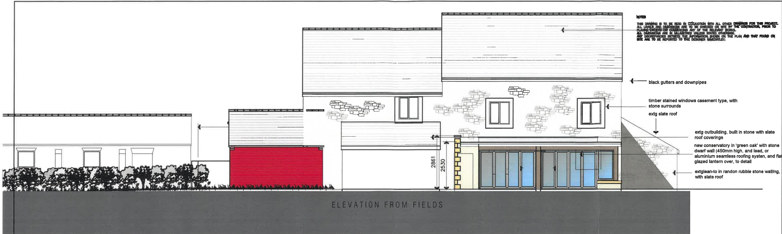
ELEVATION FROM FIELDS

NOTES THIS DRAWING IS TO BE READ IN CONJUNCTION WITH ALL OTHER DRAWINGS FOR THIS PROJECT. ALL LEVELS AND DIMENSIONS ARE TO BE CHECKED ON SITE BY THE CONTRACTOR, PRIOR TO PLACING ORDERS OR COMMENCING ANY OF THE RELEVANT WORKS. ALL DIMENSIONS ARE IN MILLIMETRES UNLESS STATED OTHERWISE. ANY DISCREPANCIES BETWEEN THE INFORMATION GIVEN ON THE PLAN AND THAT FOUND ON SITE ARE TO BE REPORTED TO THE DESIGNER IMMEDIATELY.