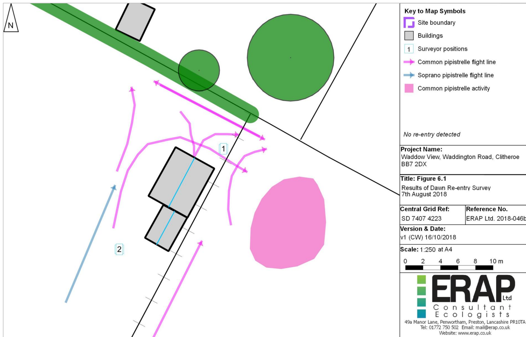
Figure 6.1: Dawn Re-entry Survey 7 th August 2018