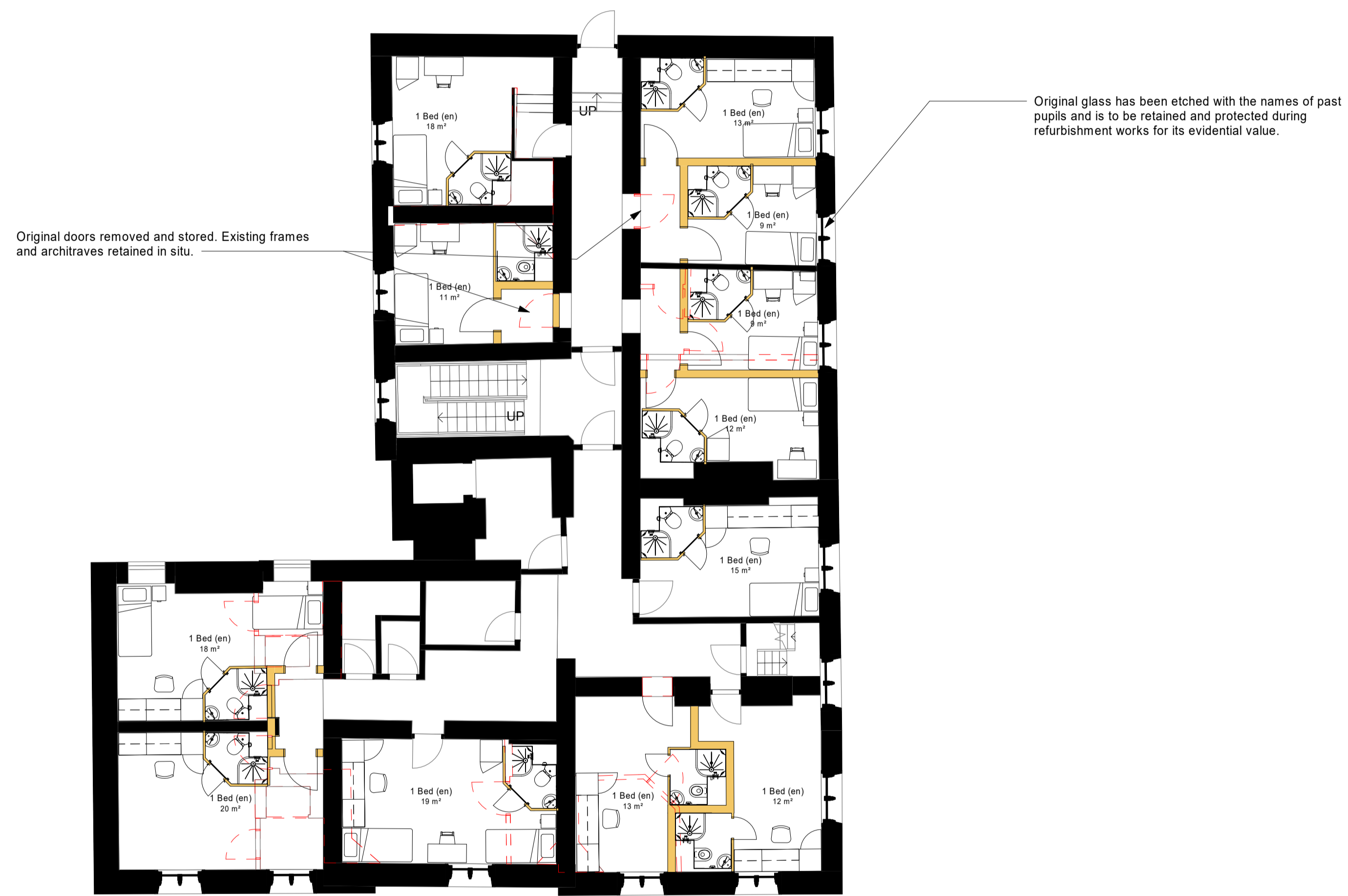
4 Proposed First Floor 1 : 100