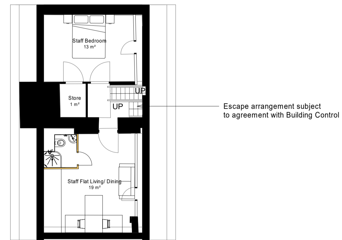
3 Proposed Second Floor 1 : 100