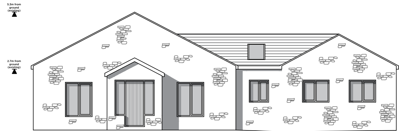
PROPOSED NORTH-EAST ELEVATION