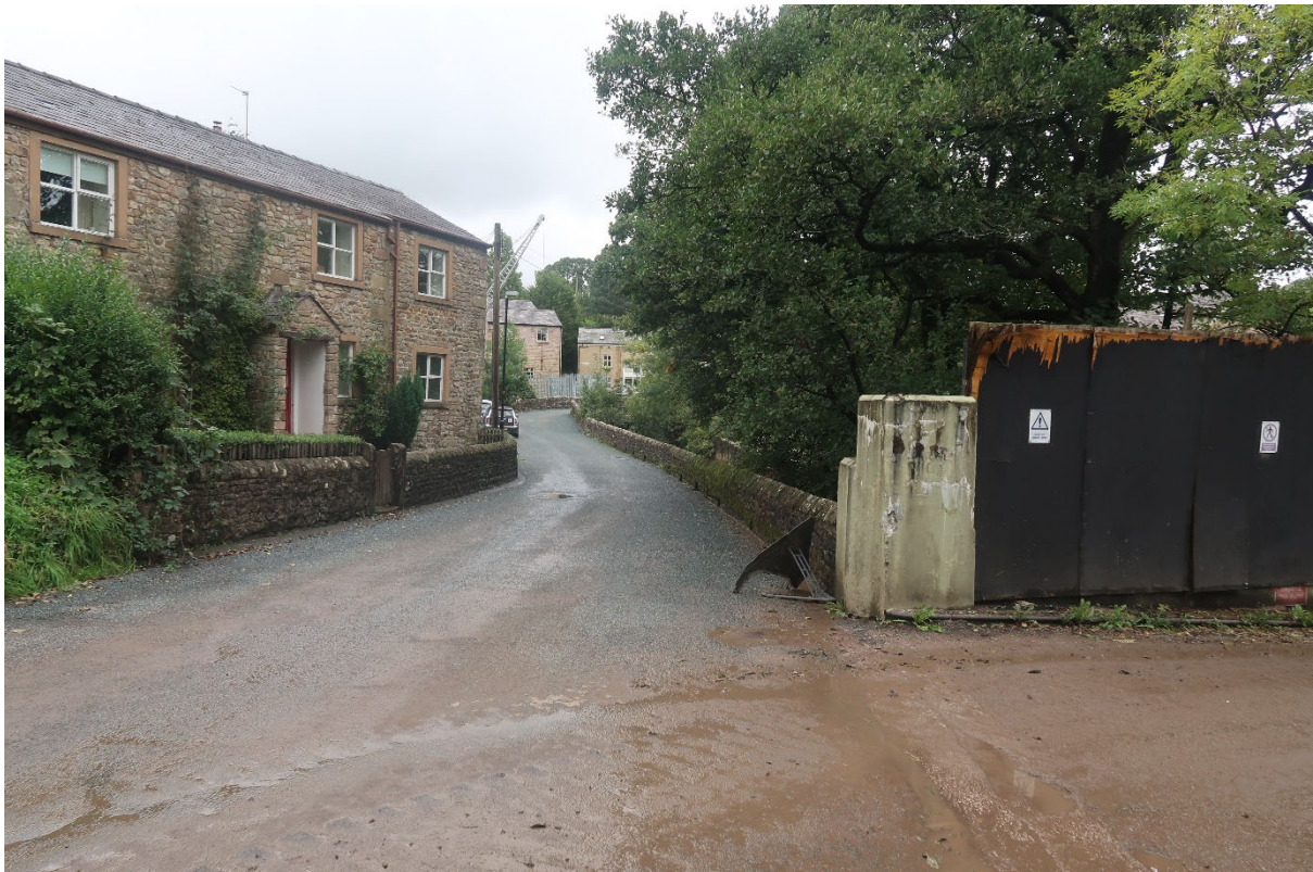
Long view north along Malt-Kiln Brow Kirk Mill