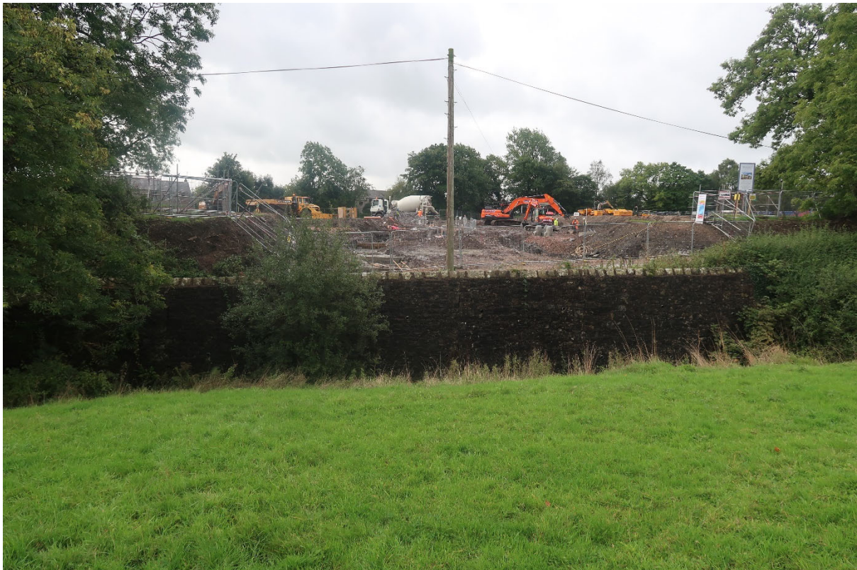
View of housing development from site, front of proposed plot 2