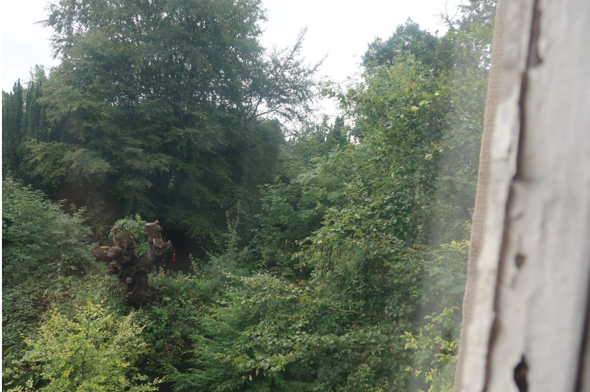
View from first floor of mill, dense mature trees, no view of proposed site