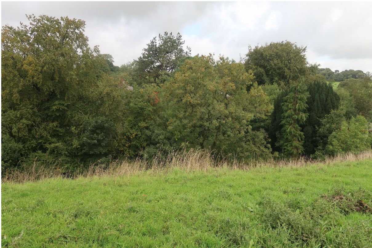
View of proposed plot 4, mill cannot be seen