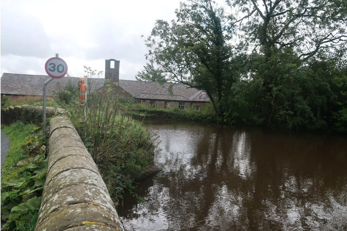
View of rear over Lodge