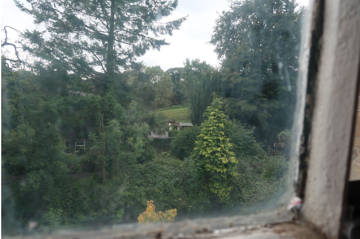
Zoomed in view of photograph 14