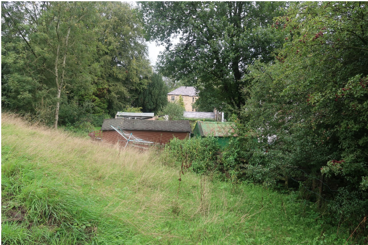
View of part of mill from proposed access road