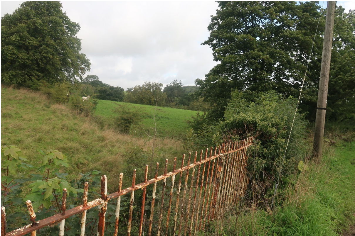
No view of mill from Churh Raike