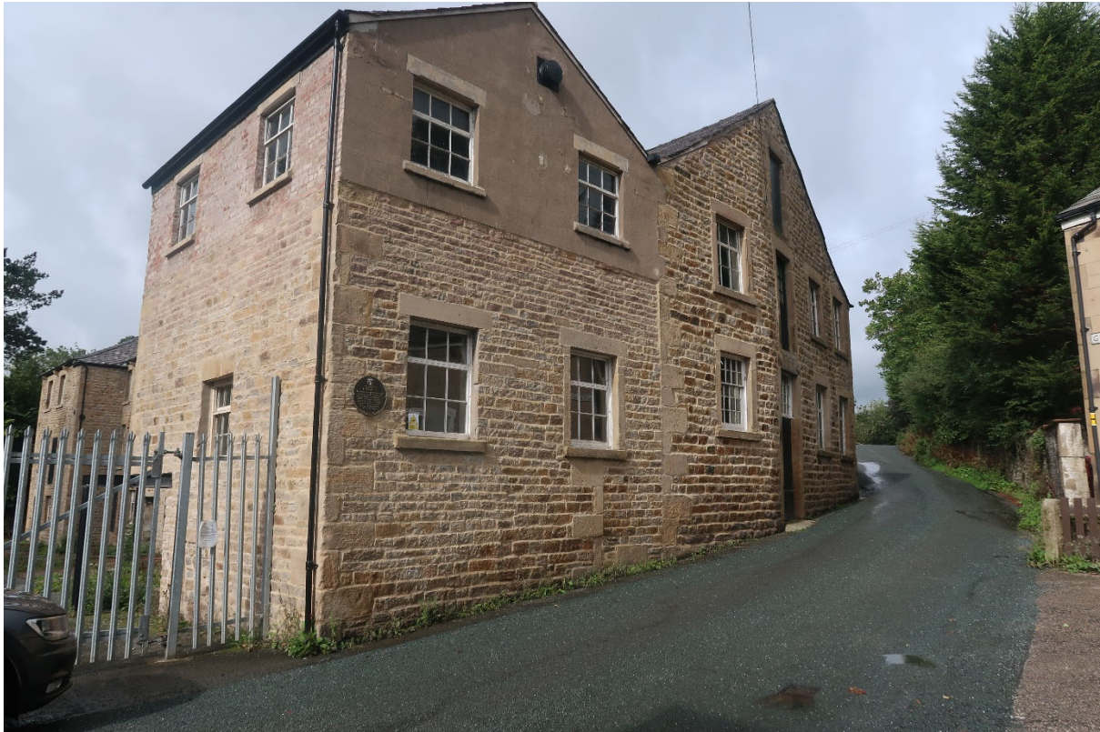
Road elevation Kirk Mill