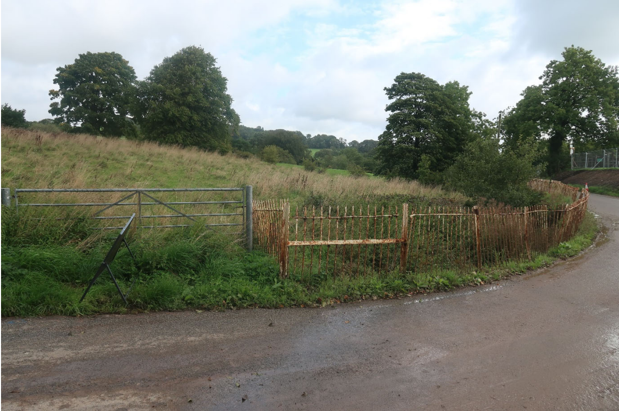
Land contour restricting the view of the mill