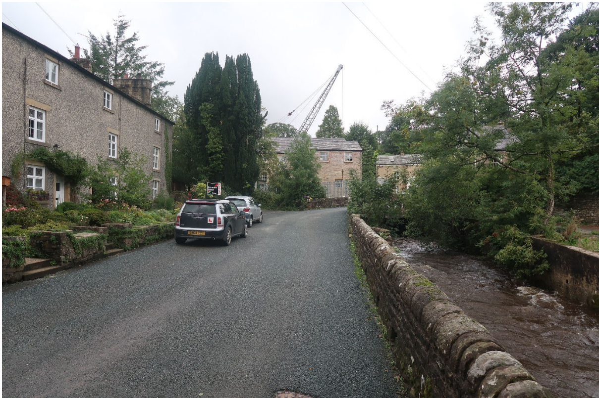
View of Malt-Kiln Brow to front of Kirk Mill