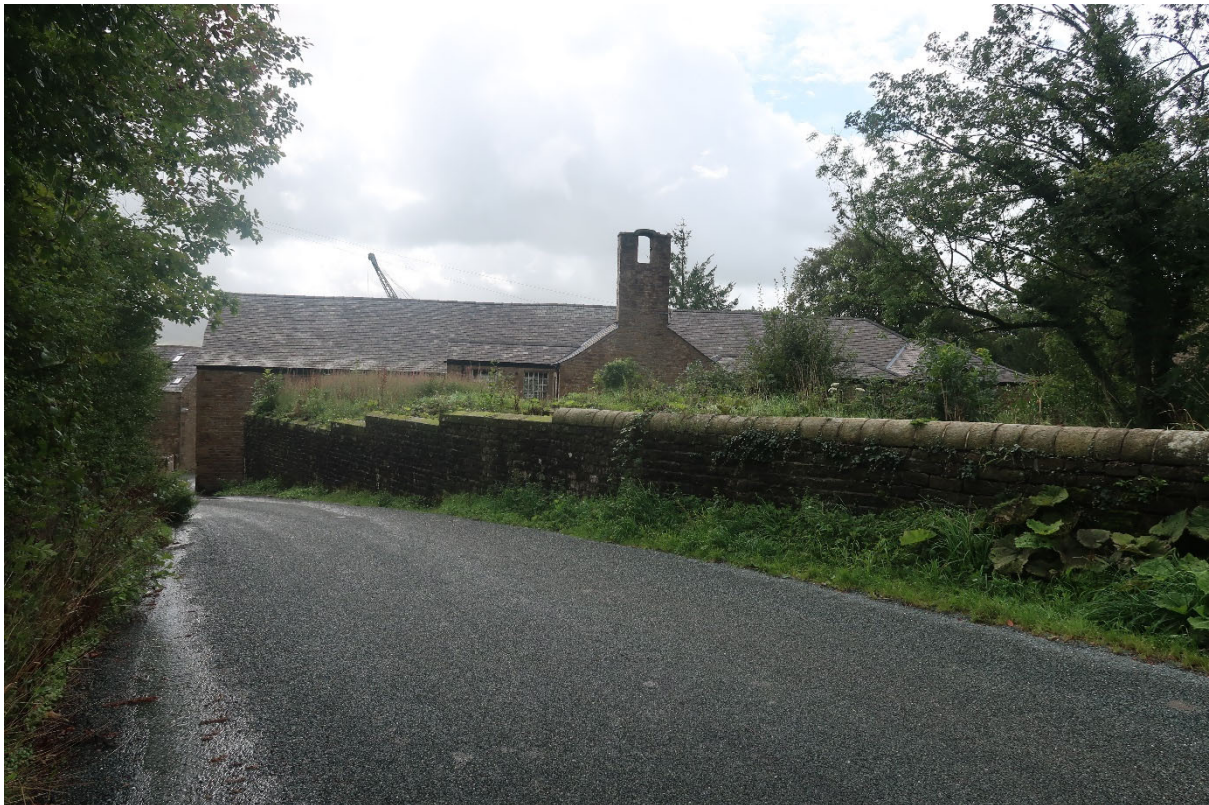
View from Lodge