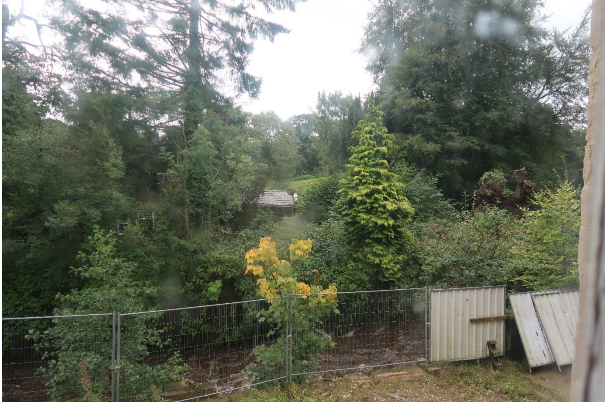
View from window of wheel house section of Mill, only clear view of site and access road, no proposed buildings, established trees, mainly conifers