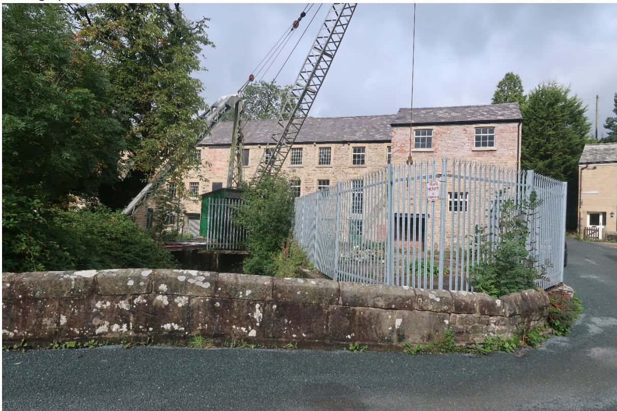
Kirk Mill front bridge