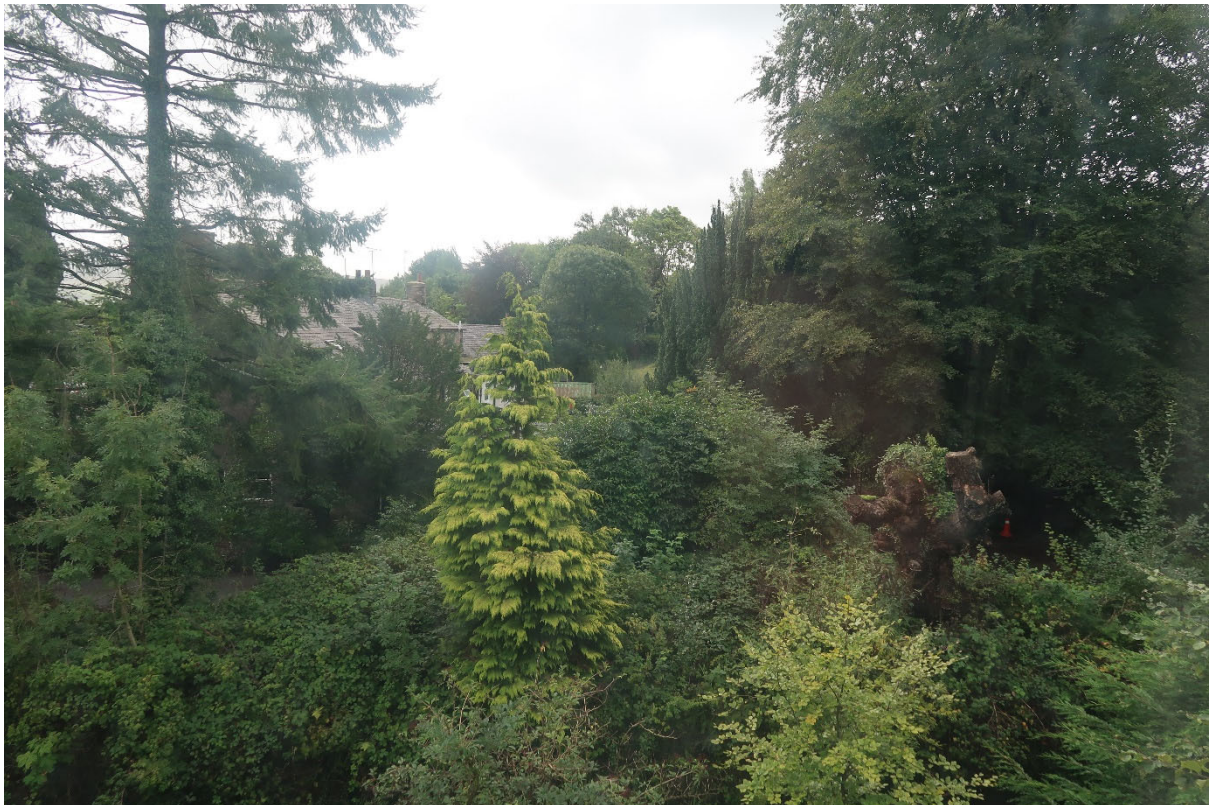
View from first floor window of mill, small section of site on view of access road only.