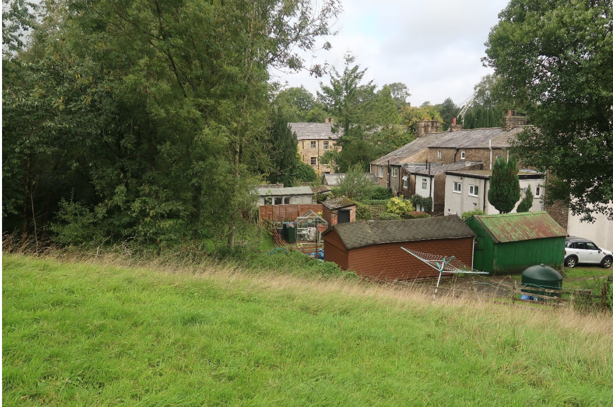
View of part of mill from proposed access road