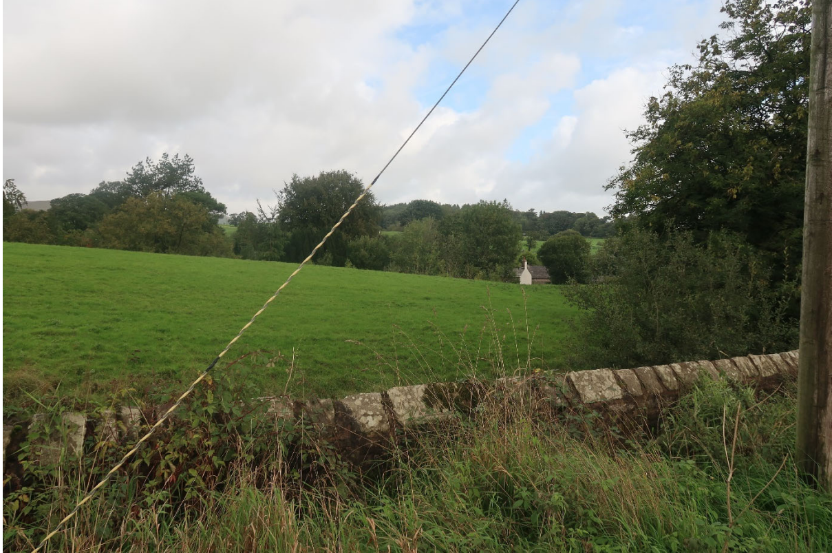
View from Church Raike, no view of mill