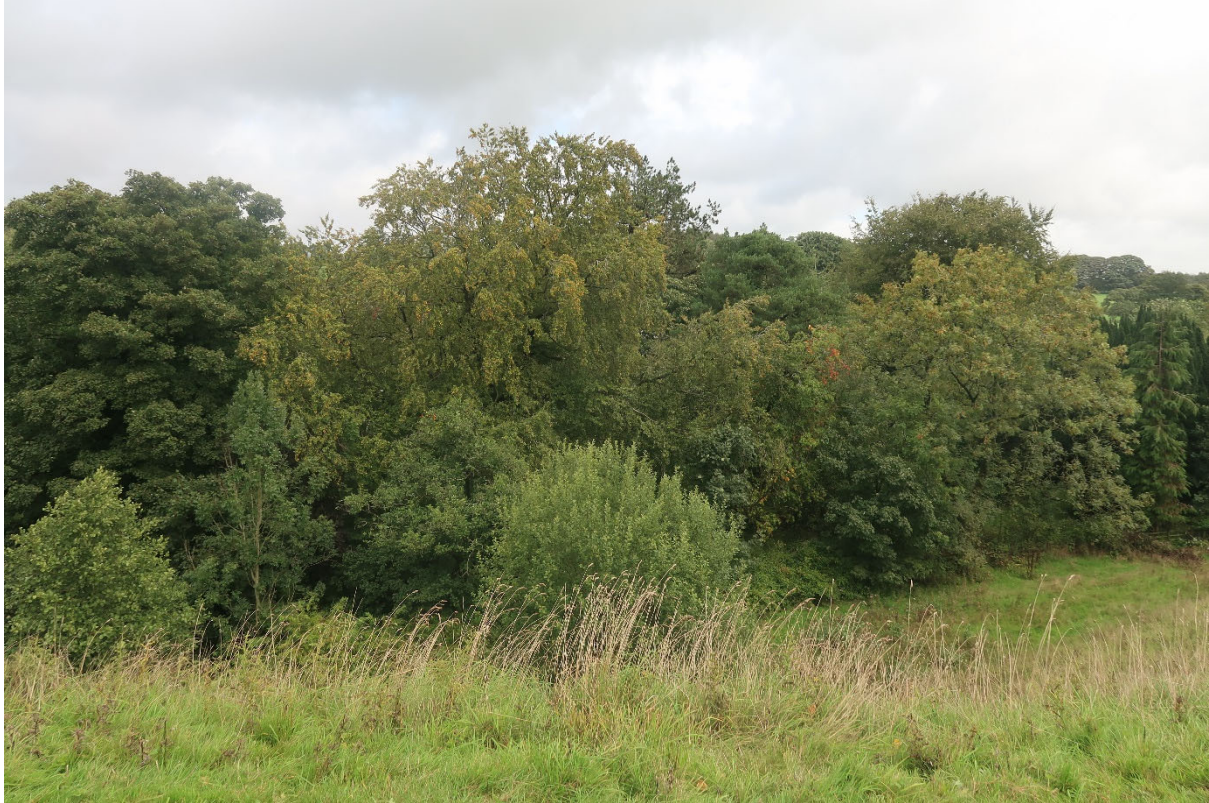
View of land, proposed plot 2, note land levels to be reduced – no view of mill – no views out from site