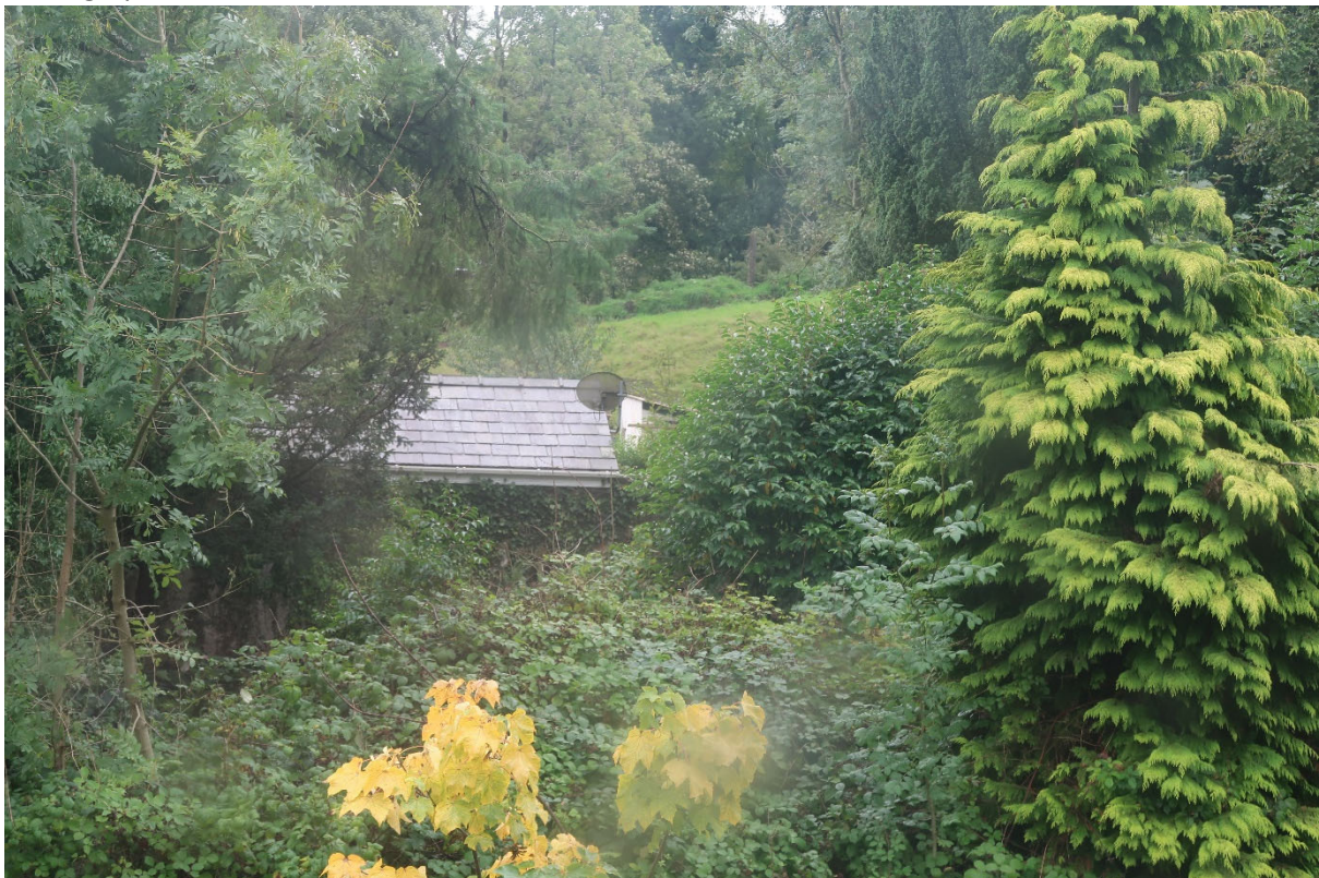
Zoomed in view of photograph 11