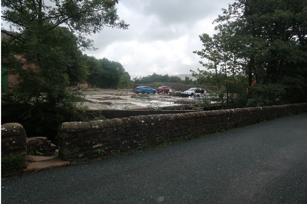
Recently cleared site of former works