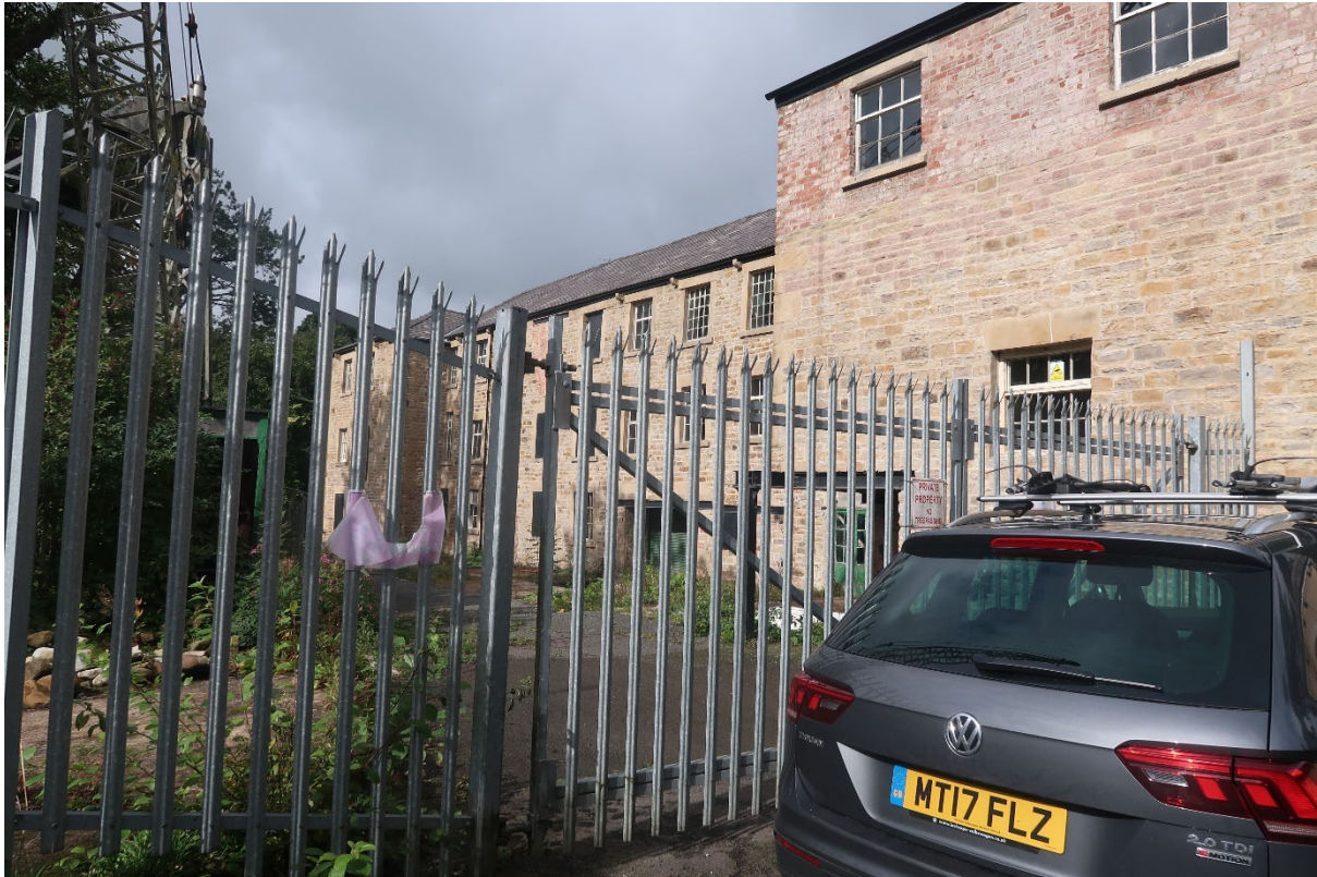
Front elevation Kirk Mill