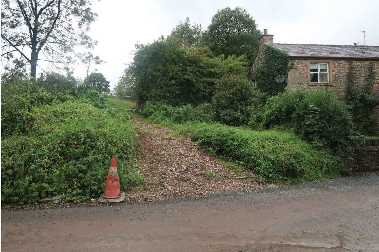
Outline of proposed access road to 4 dwellings