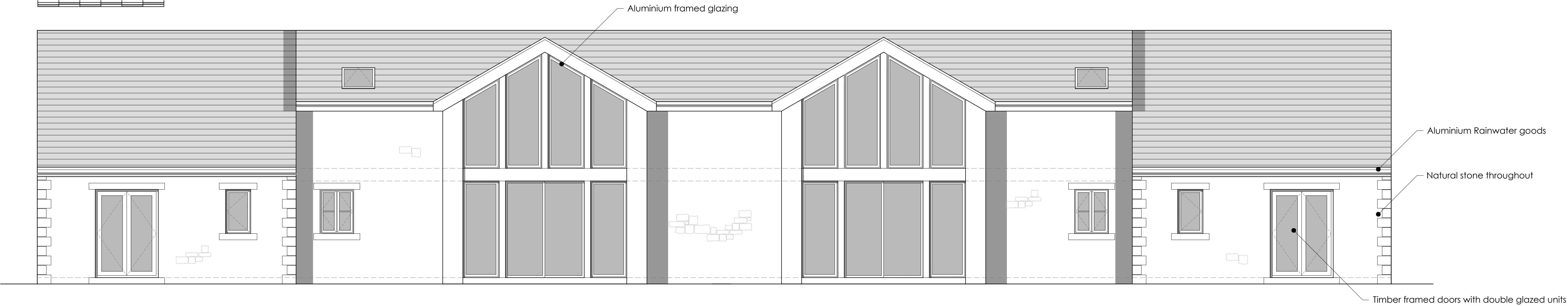
Proposed East Facing Elevation Scale 1:50 0 1 2 3m