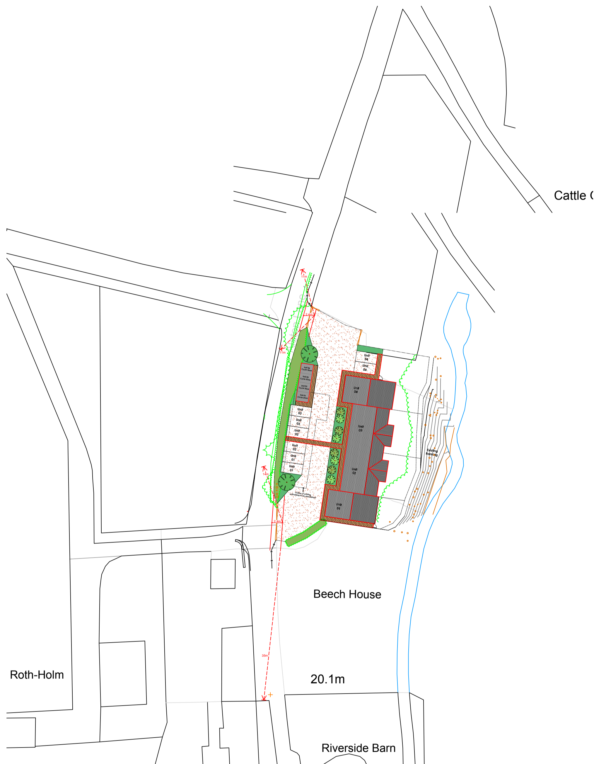
EXISTING SITE VISIBILITY Scale 1:500