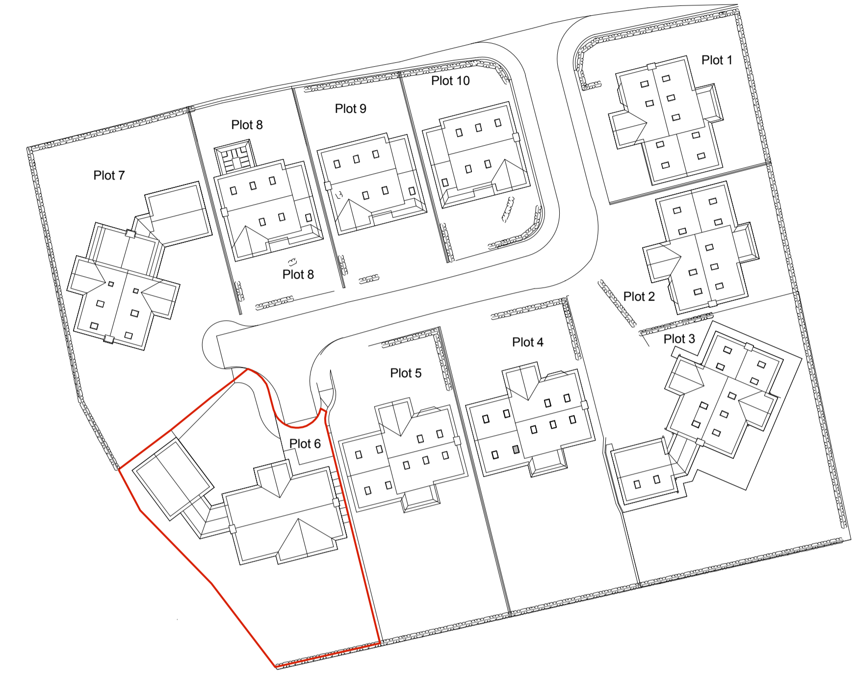
LOCATION PLAN 1:500