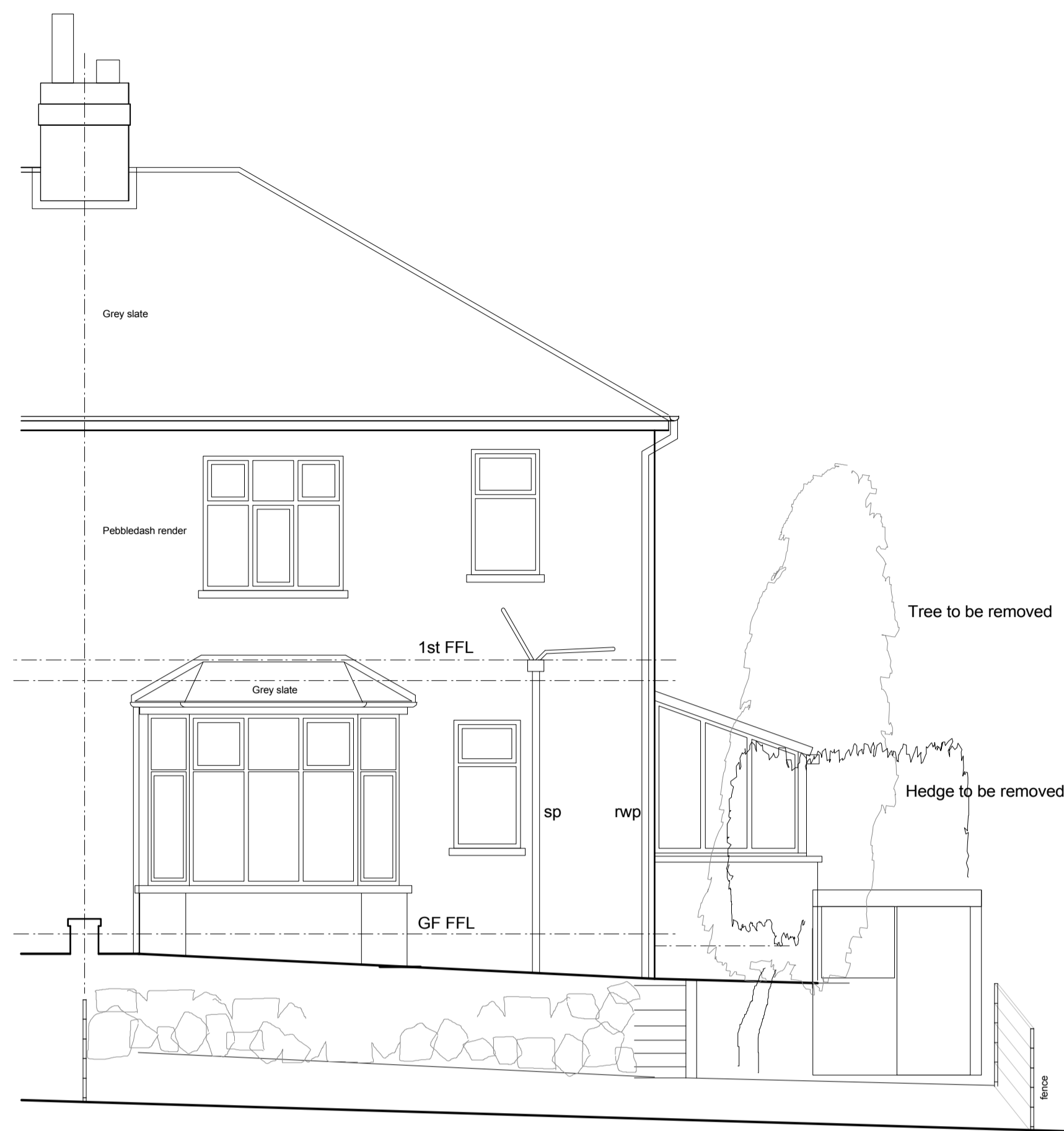
NORTH ELEVATION : AS EXISTING 1 : 50