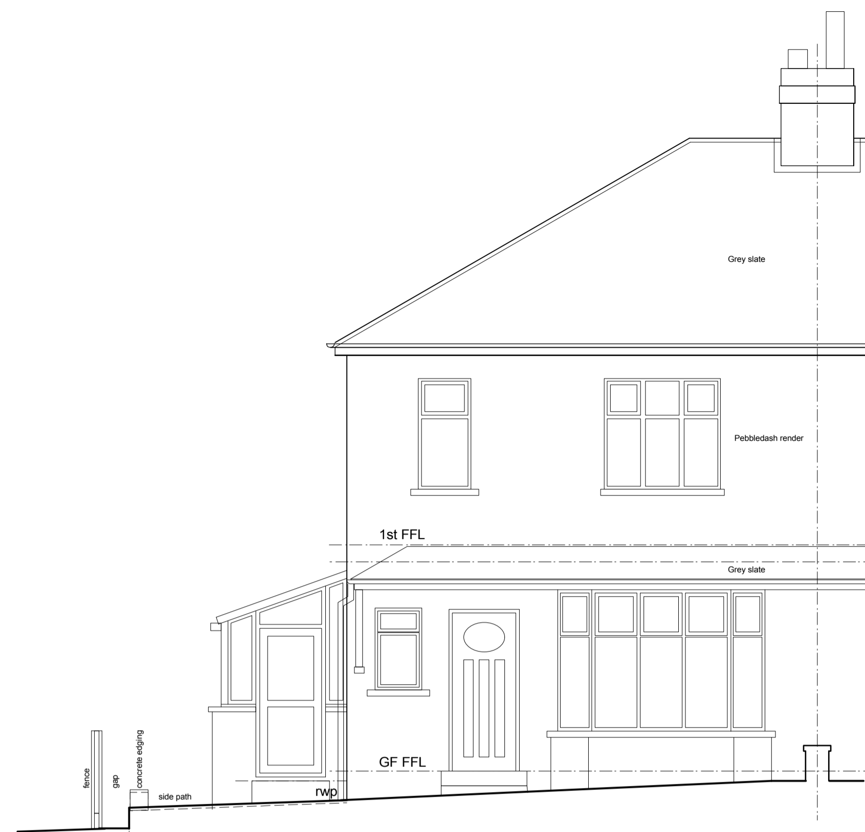
SOUTH ELEVATION : AS EXISTING 1 : 50