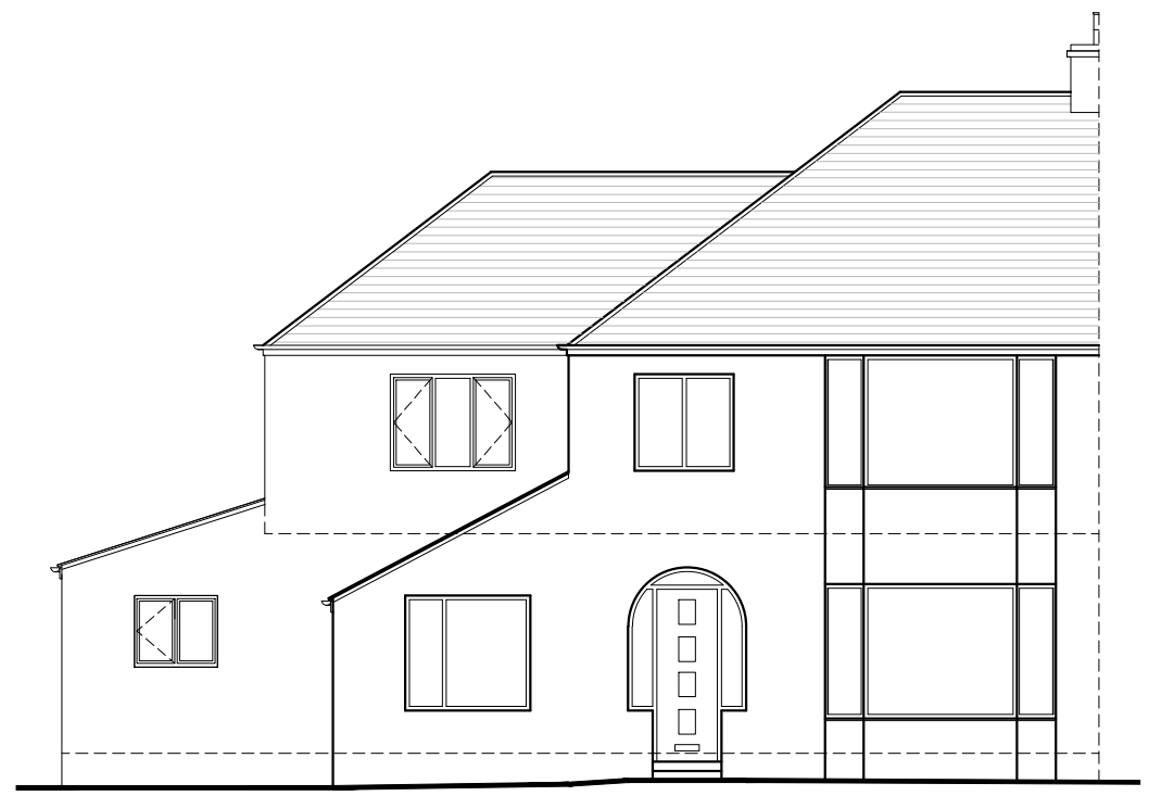
PROPOSED SOUTH EAST ELEVATION Scale 1:100