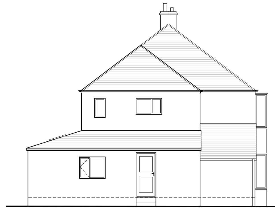
PROPOSED SOUTH WEST ELEVATION Scale 1:100