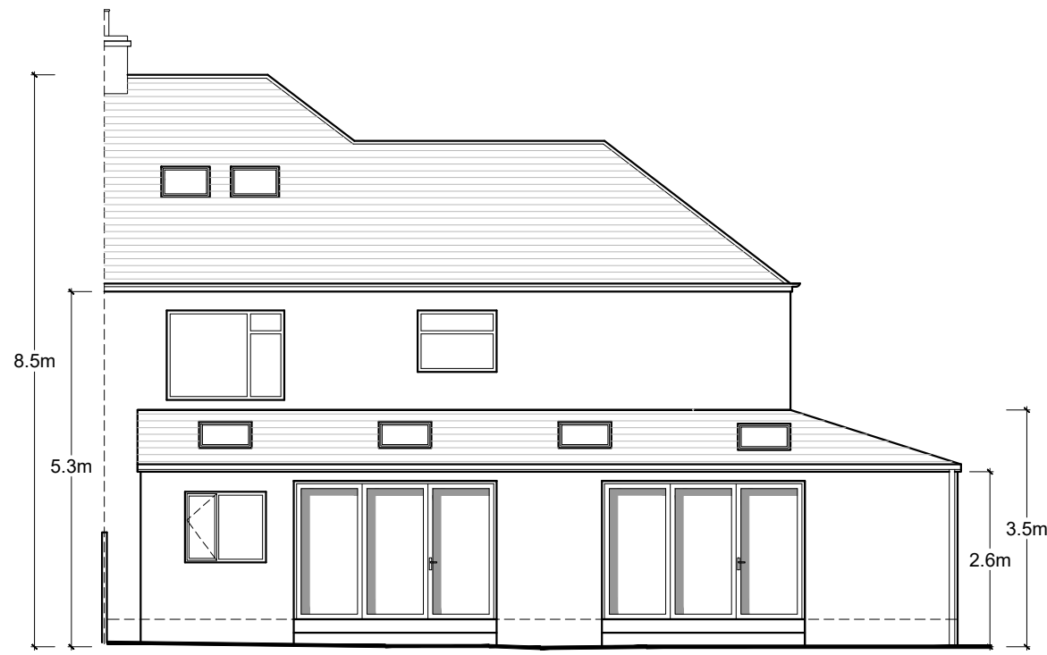
PROPOSED NORTH EAST ELEVATION Scale 1:100