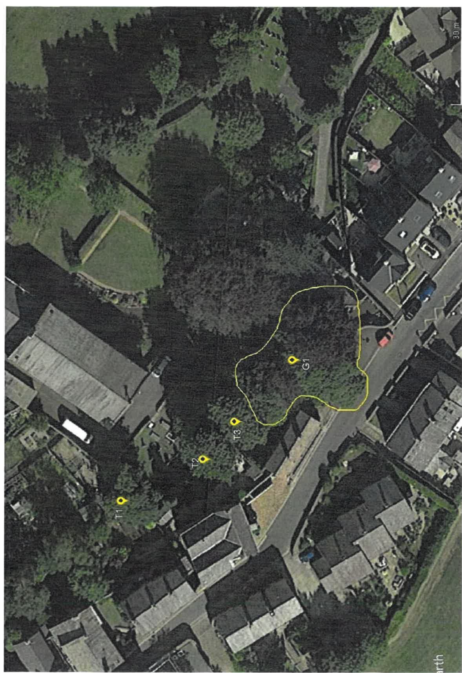
Site St Mary's Church Chipping, PR3 2QD