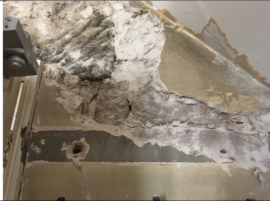
21-01-19, 13.31.47 – Second Floor (Attic)