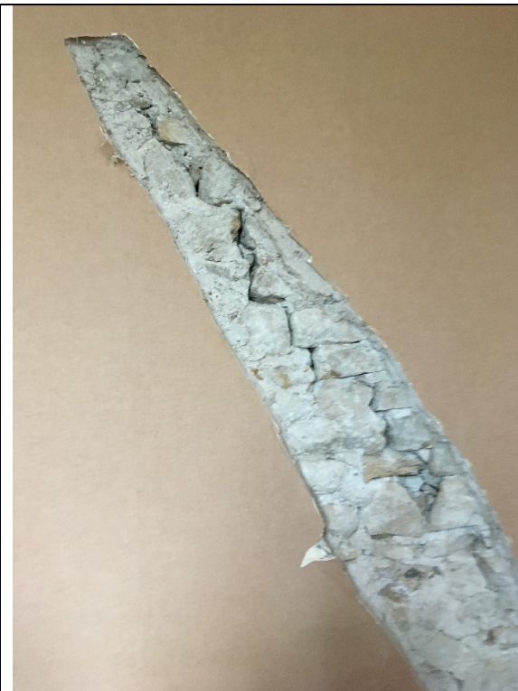
21-02-19, 11.15.23 – Ground Floor