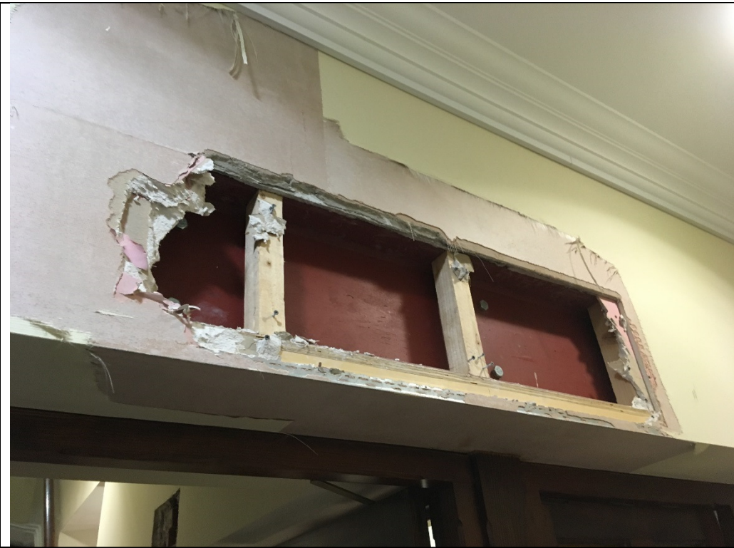
21-02-19, 11.18.38 – Ground Floor