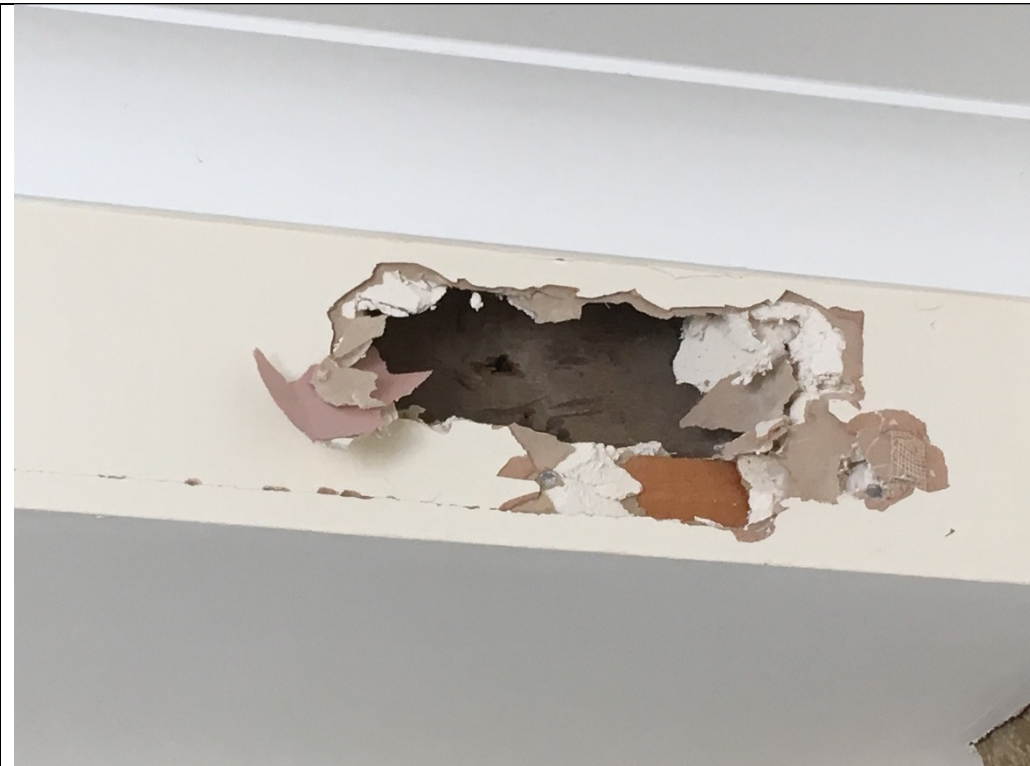
21-02-19, 14.05.14 – Basement