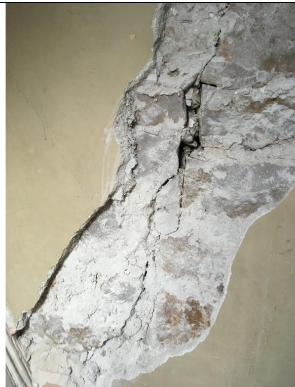
21-02-19, 13.26.58 – Second Floor (Attic)