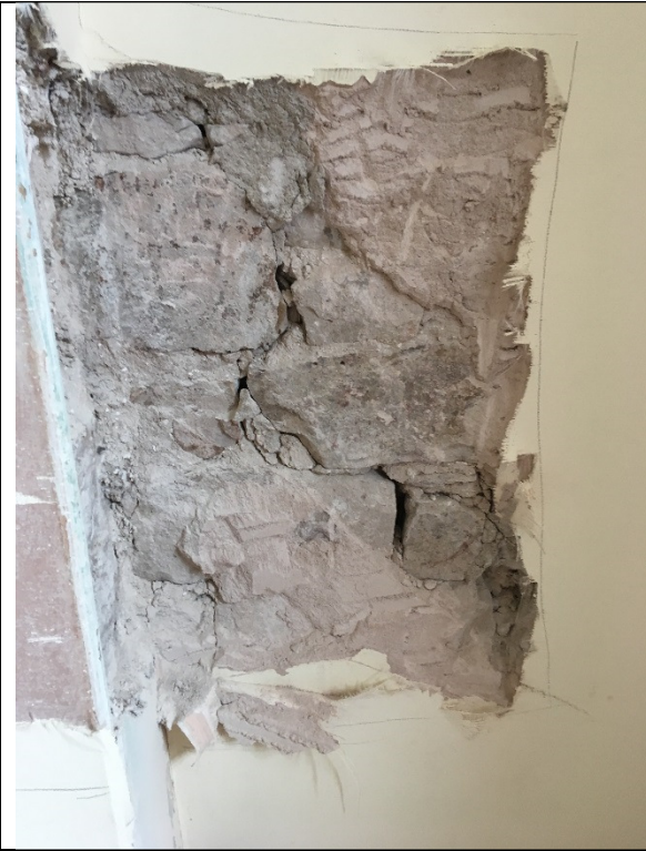
21-02-19, 11.48.19 – First Floor