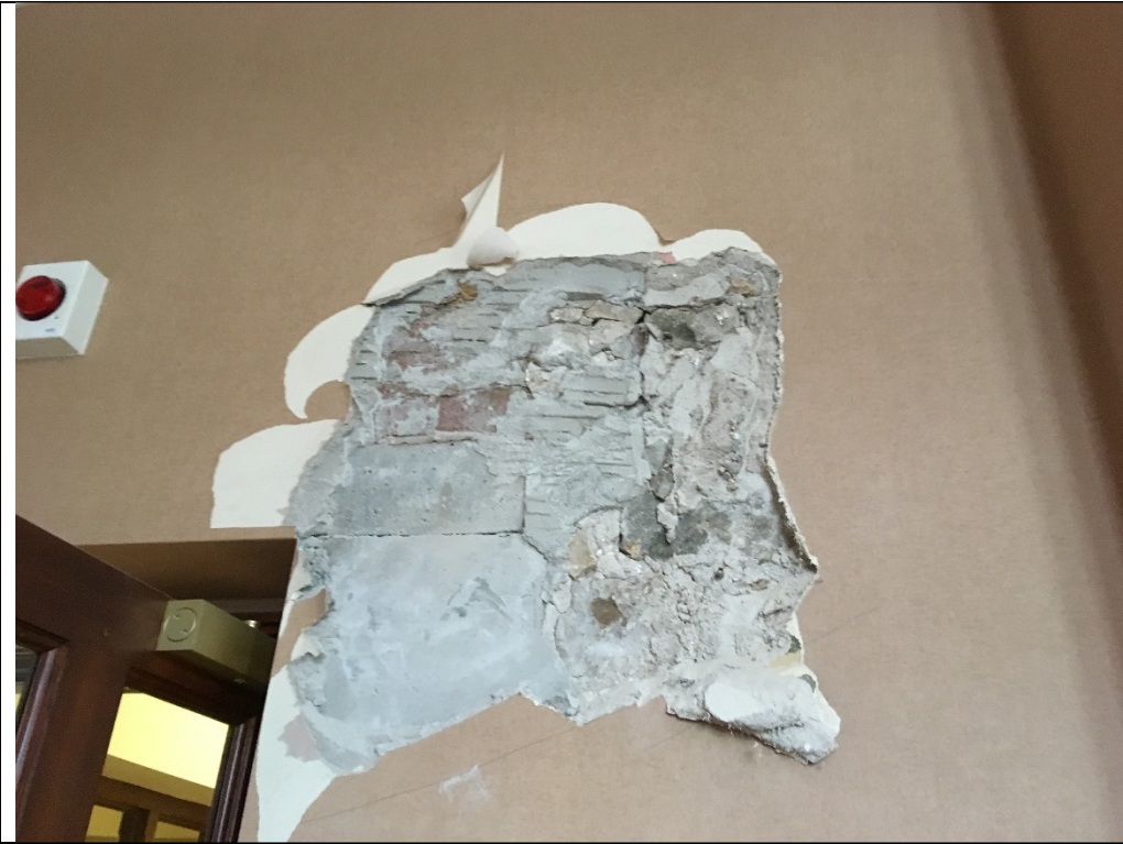
21-02-19, 11.17.21 – Ground Floor