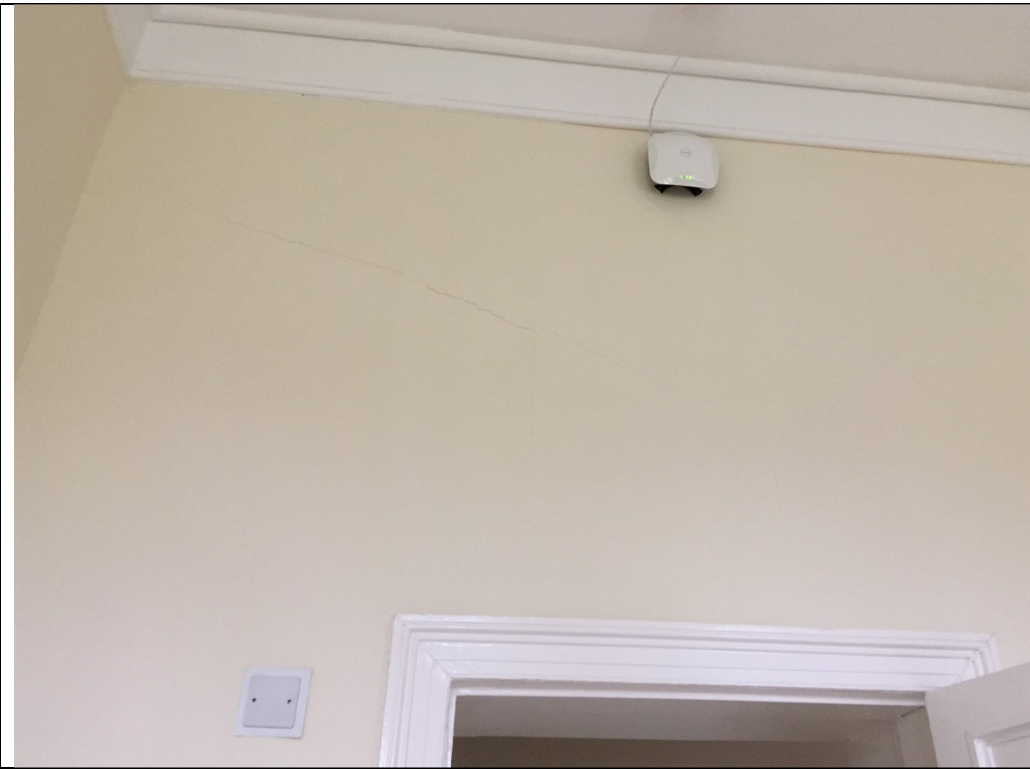
15-01-19, 13.21.14 – First Floor