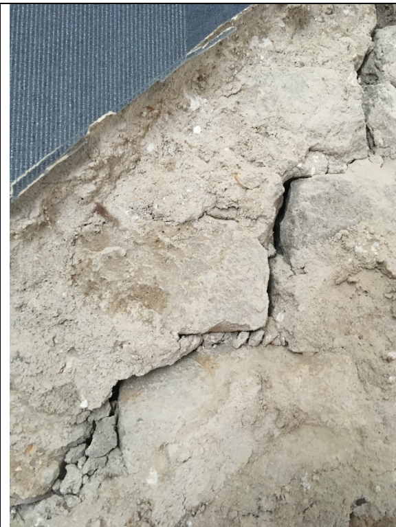
21-02-19, 13.48.08 – Ground Floor