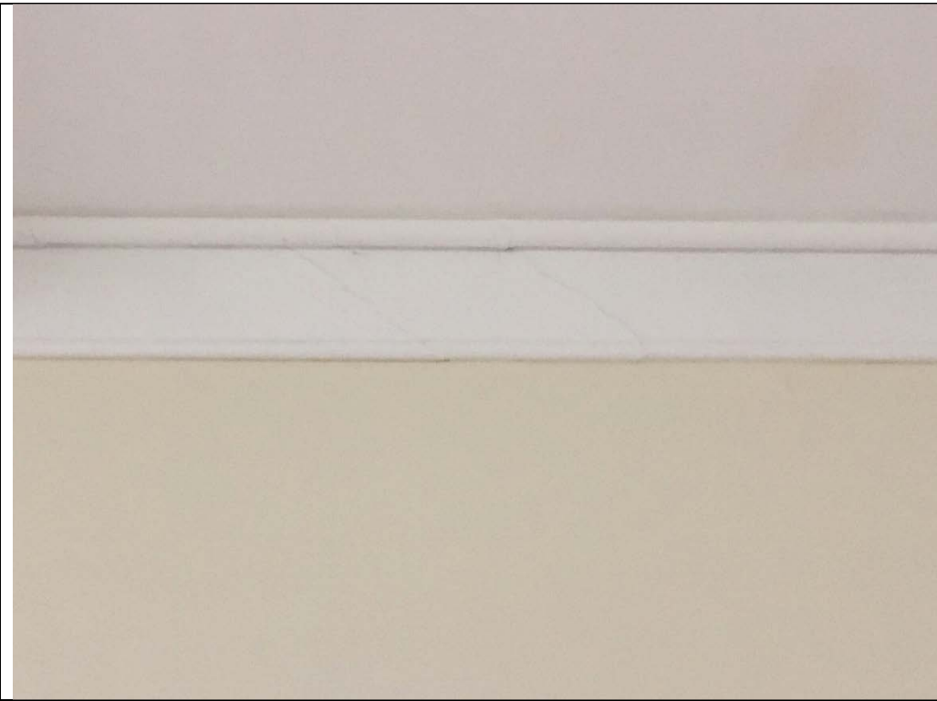
15-01-19, 13.19.14 – First Floor