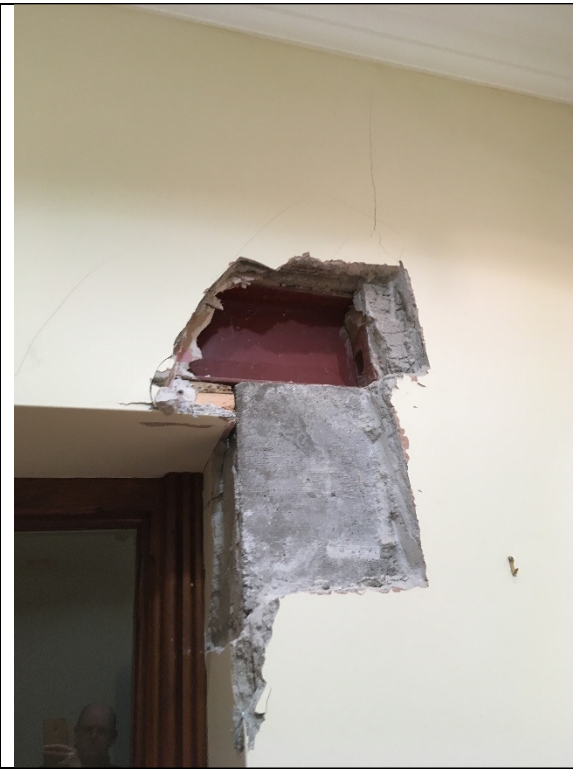
21-02-19, 11.20.20 – Ground Floor