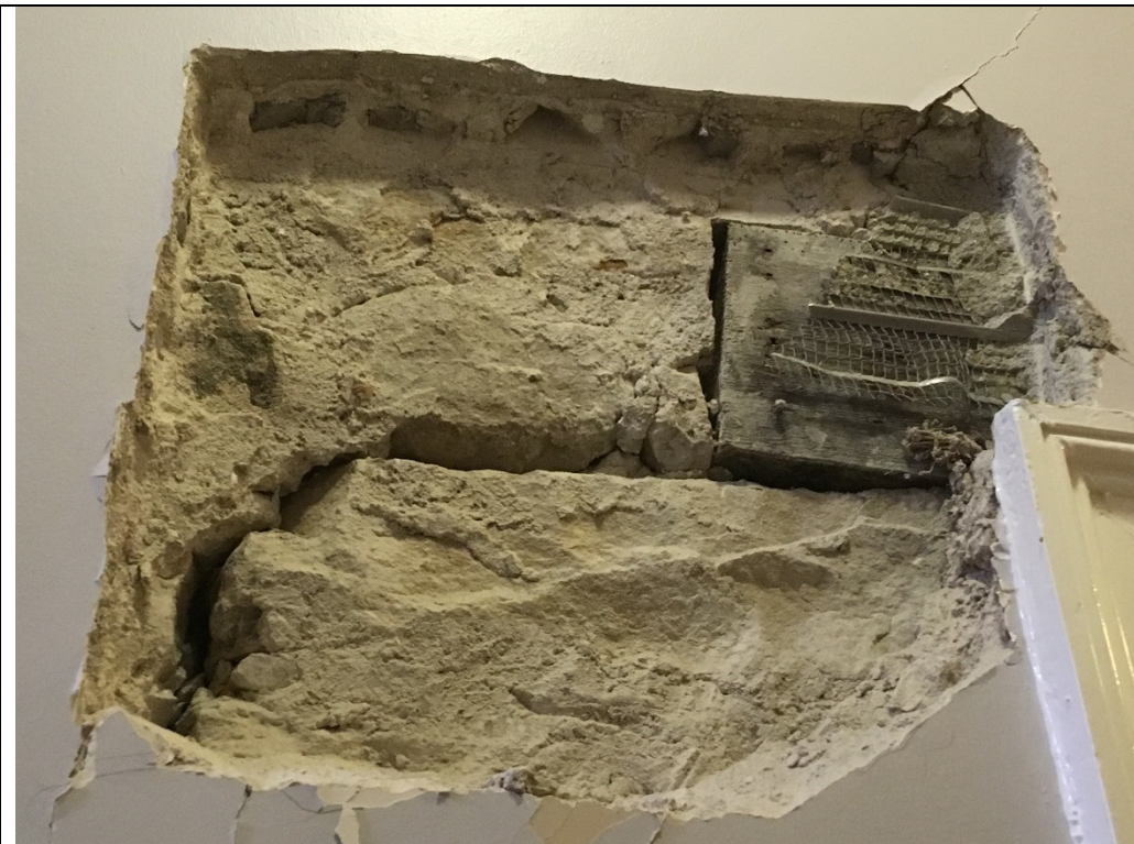
21-02-19, 13.46.28 – Ground Floor