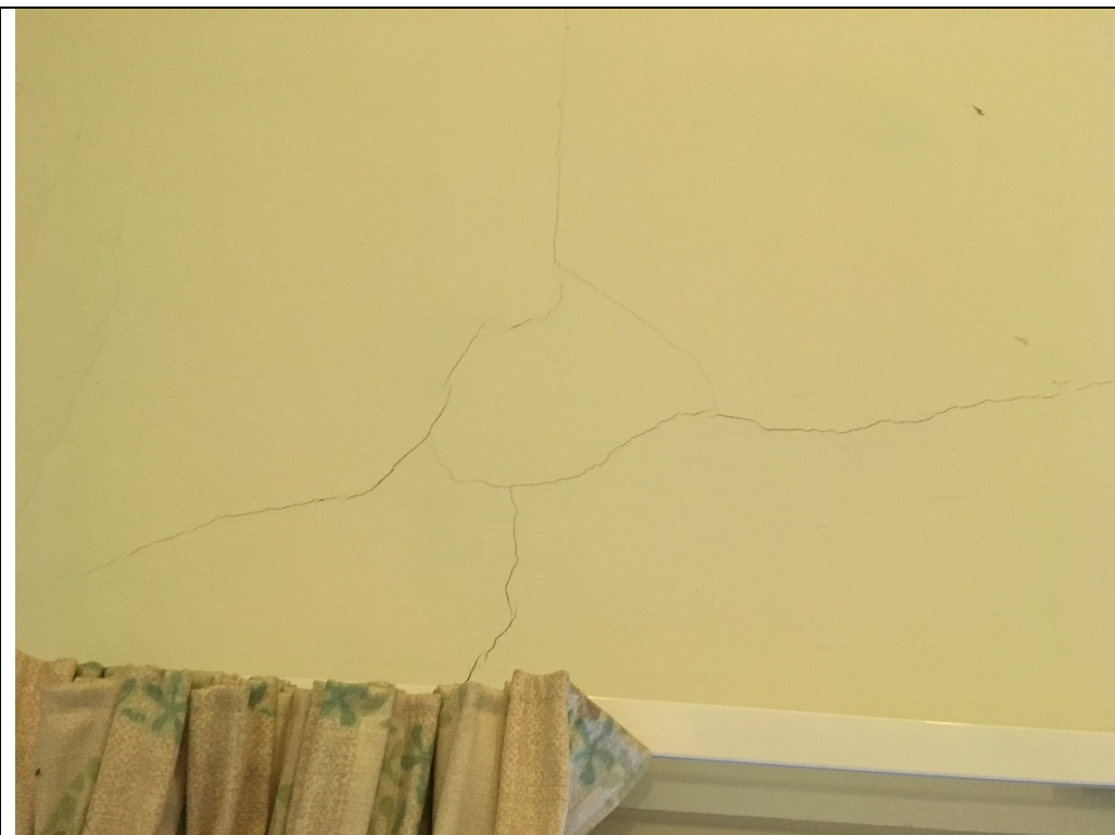
15-01-19, 13.23.28 – First Floor