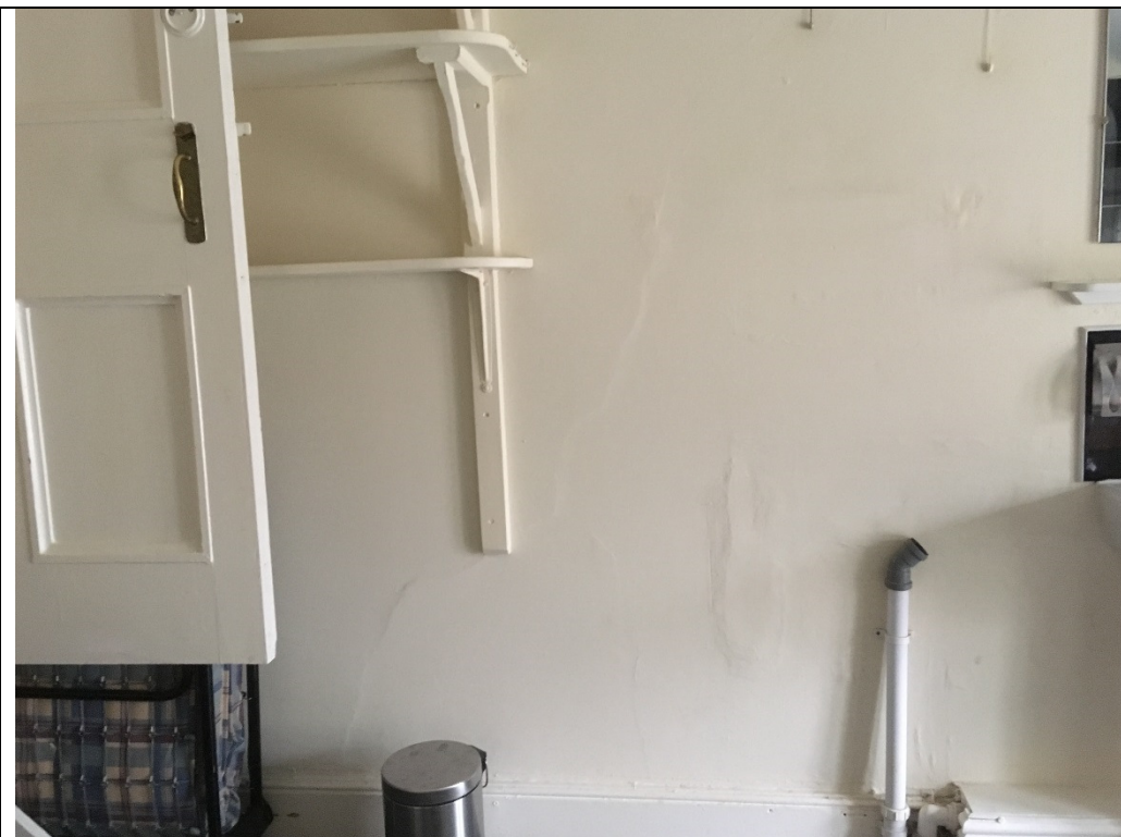
15-01-19, 13.17.15 – First Floor