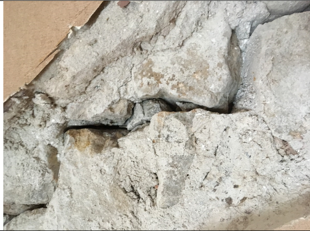
21-02-19, 11.17.36 – Ground Floor