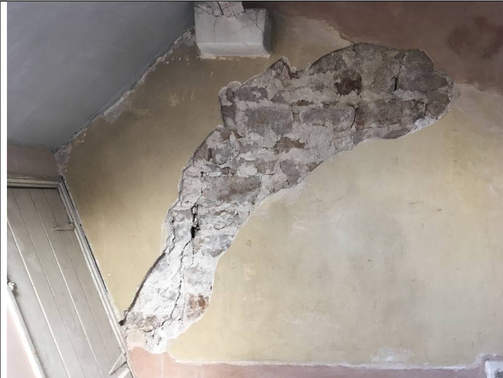
21-03-19, 13.26.14 – Second Floor (Attic)