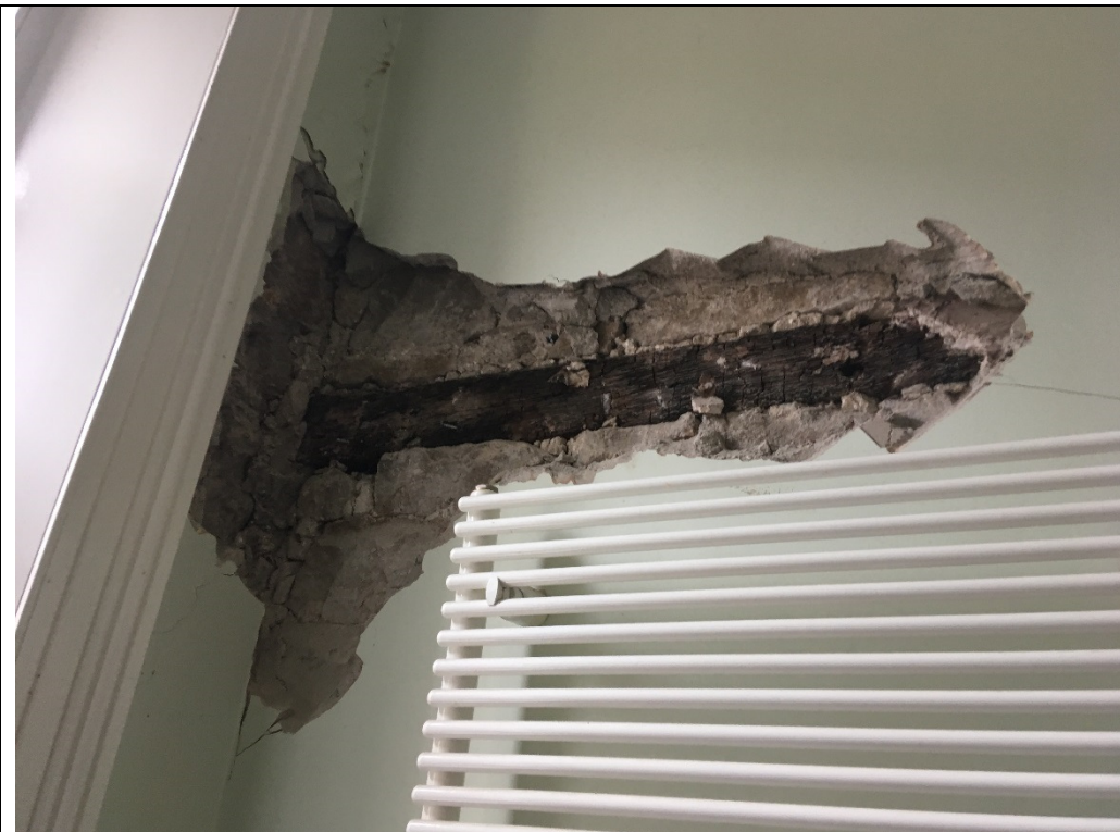
21-02-19, 11.22.16 – Ground Floor