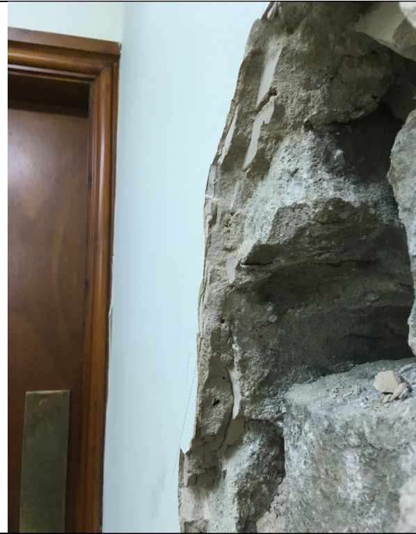
21-02-19, 14.18.34 - Basement