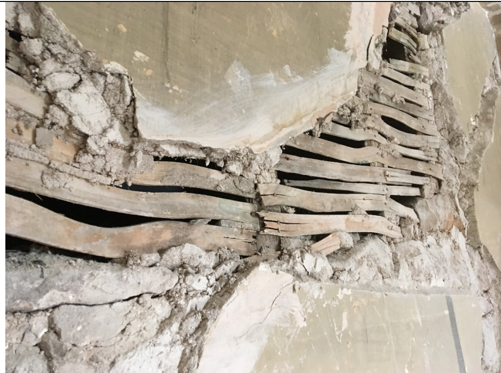
21-02-19, 13.29.55 – Second Floor (Attic)