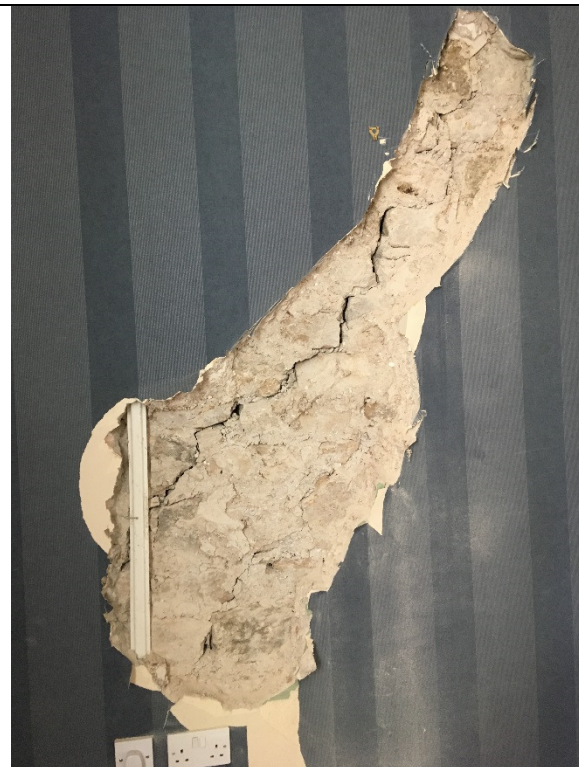
21-02-19, 13.47.54 – Ground Floor