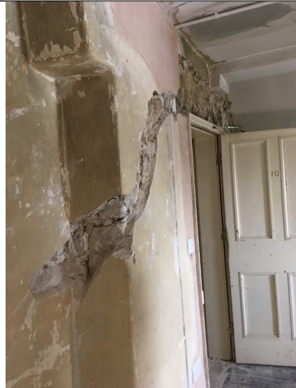
21-02-19, 13.30.11 – Second Floor (Attic)