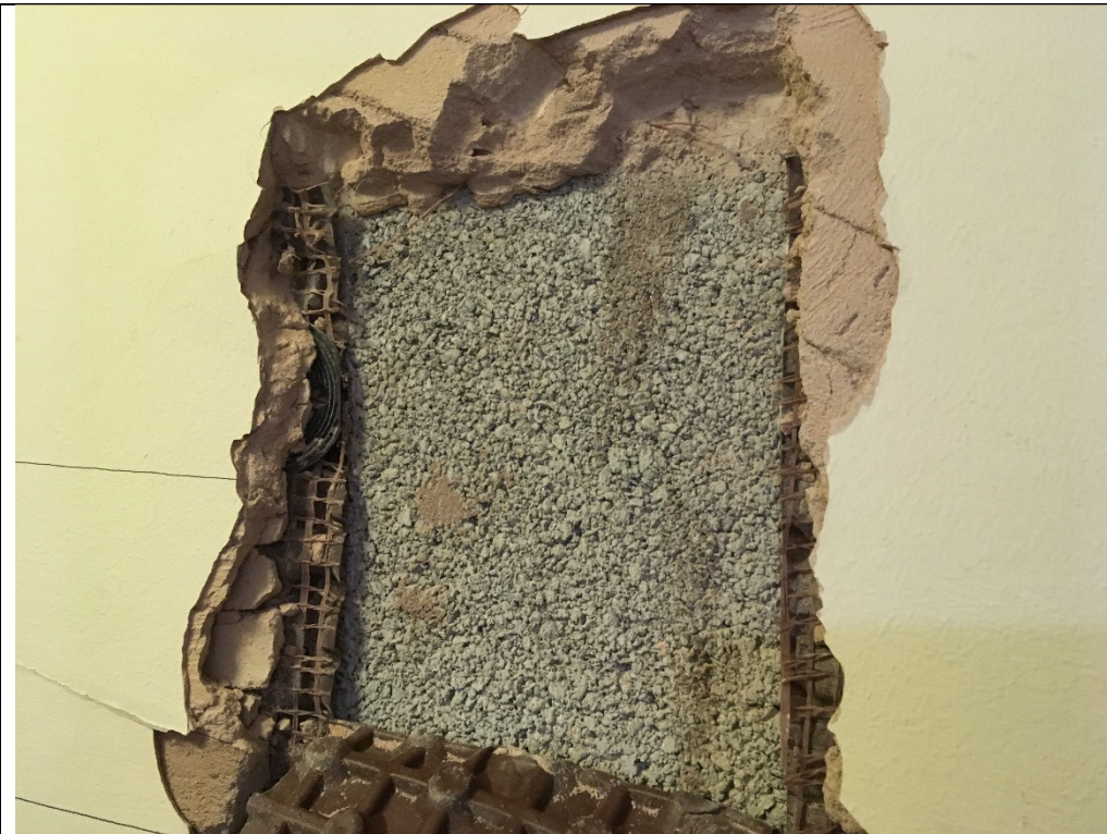
21-02-19, 14.12.44 – Basement