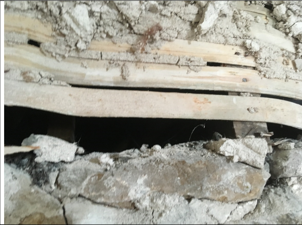
21-02-19, 13.29.53 – Second Floor (Attic)