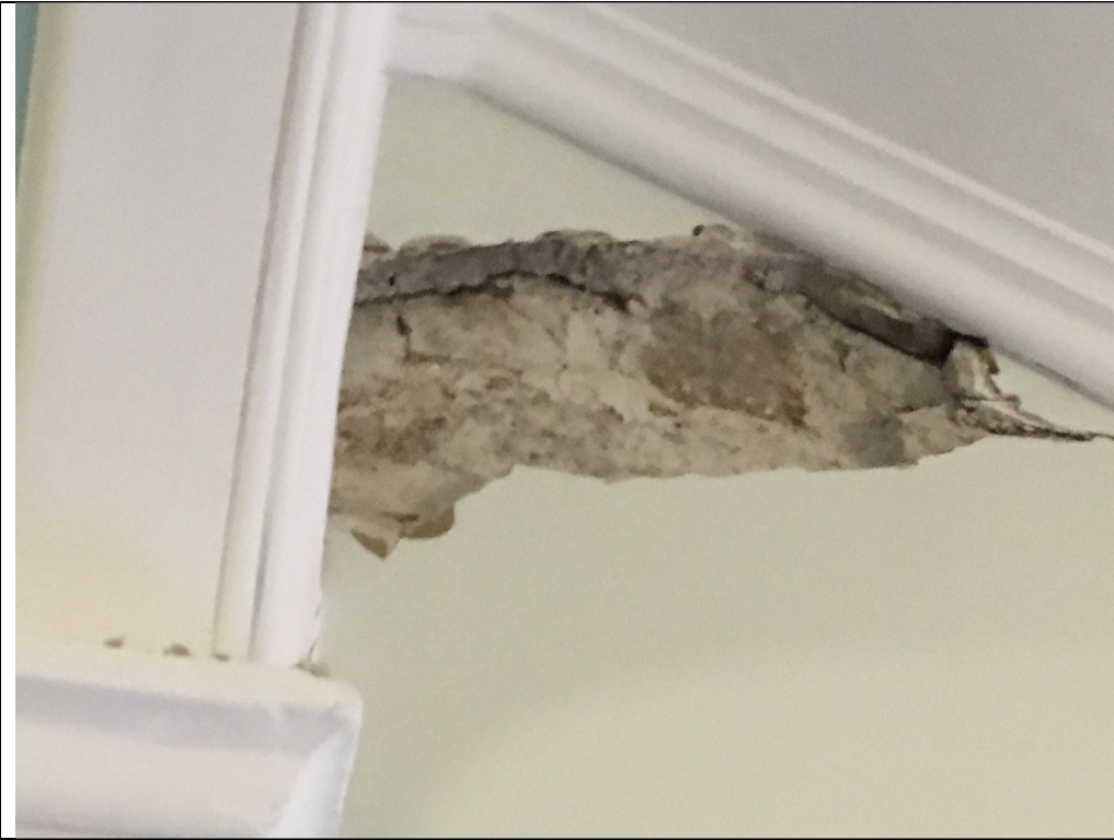
21-02-19, 11.40.06 – First Floor