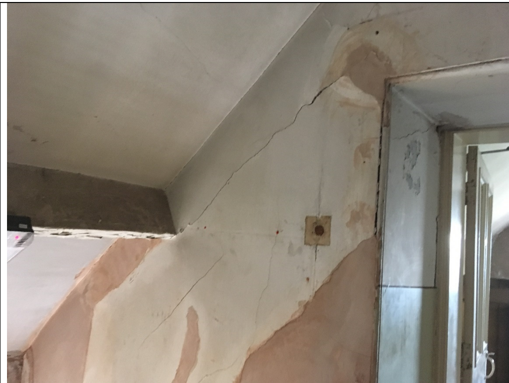
12-02-19, 13.36.05 – Second Floor (Attic)