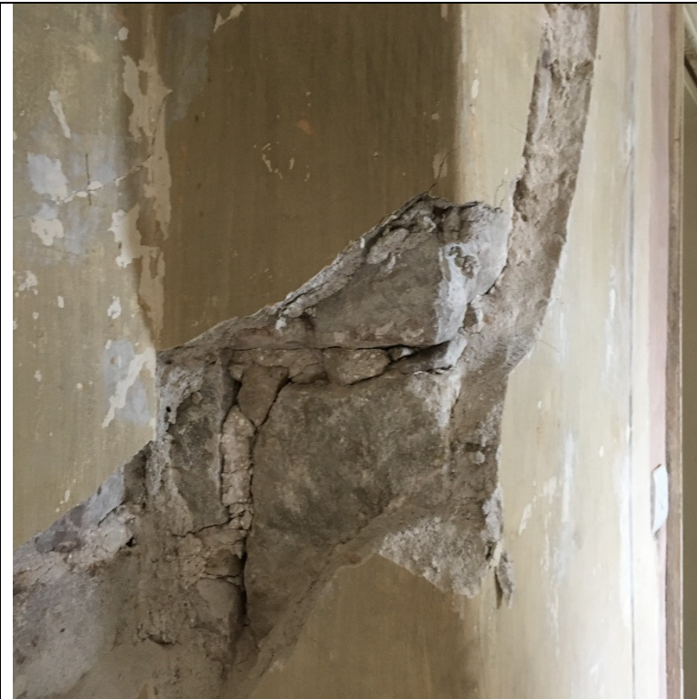
21-02-19, 13.30.05 – Second Floor (Attic)