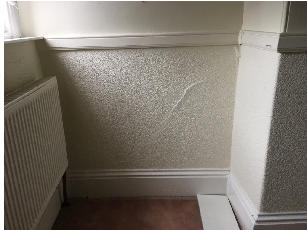
15-01-19, 13.13.43 – First Floor