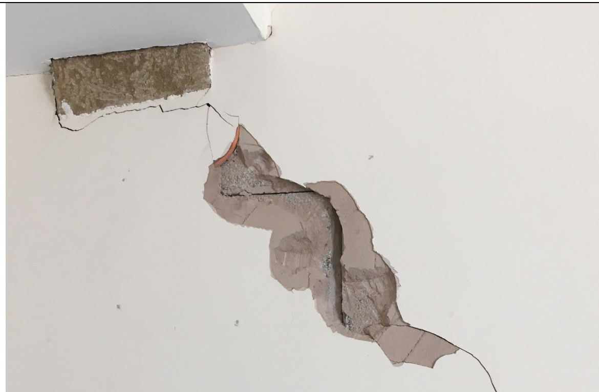
21-02-19, 13.59.36 – Basement