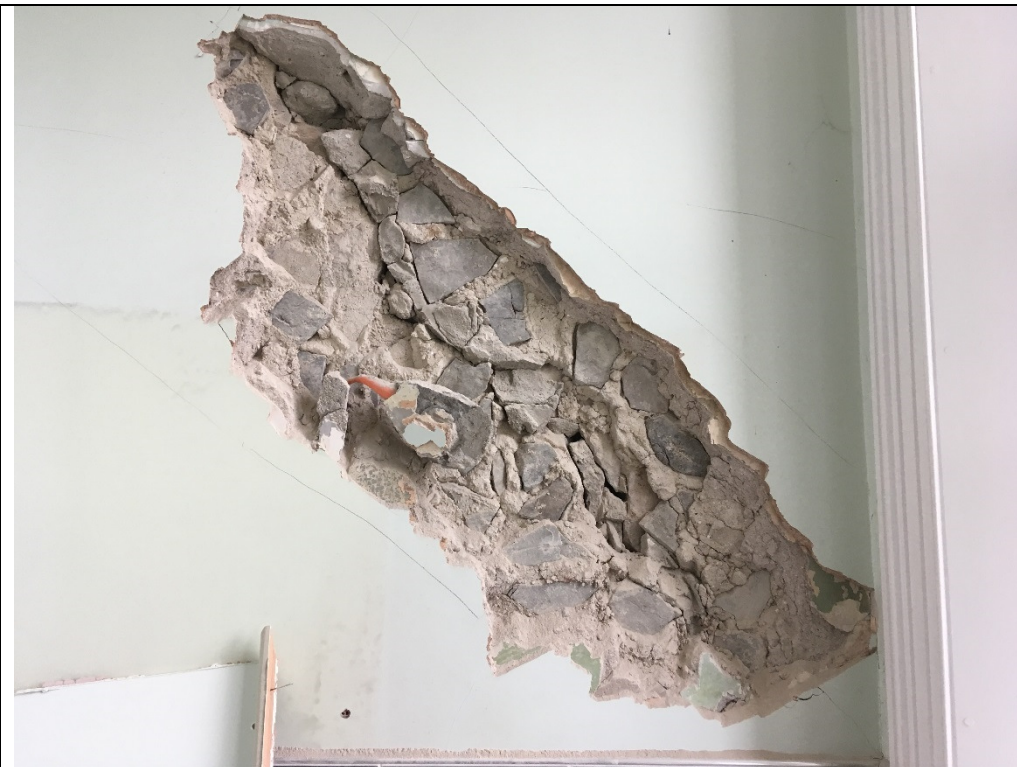
21-02-19, 11.55.39 – First Floor