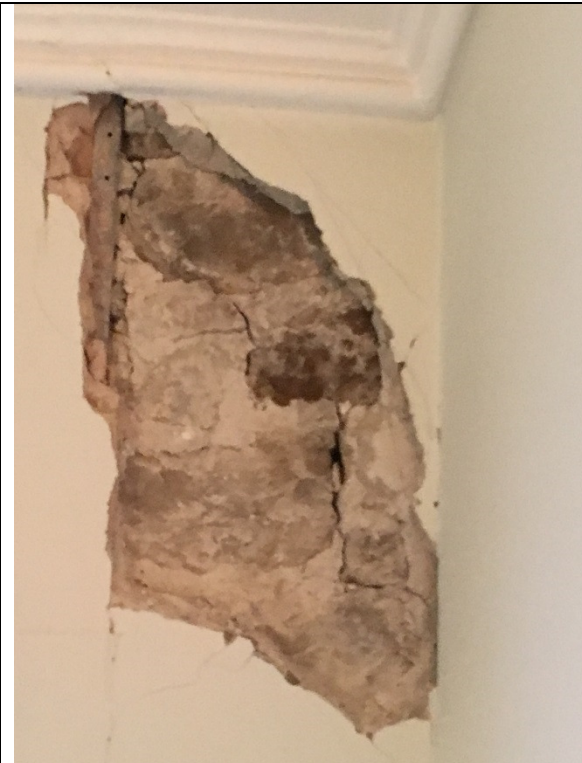
21-02-19, 11.39.40 – First Floor