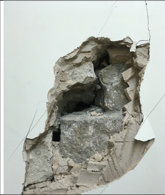
21-02-19, 14.18.38 – Basement