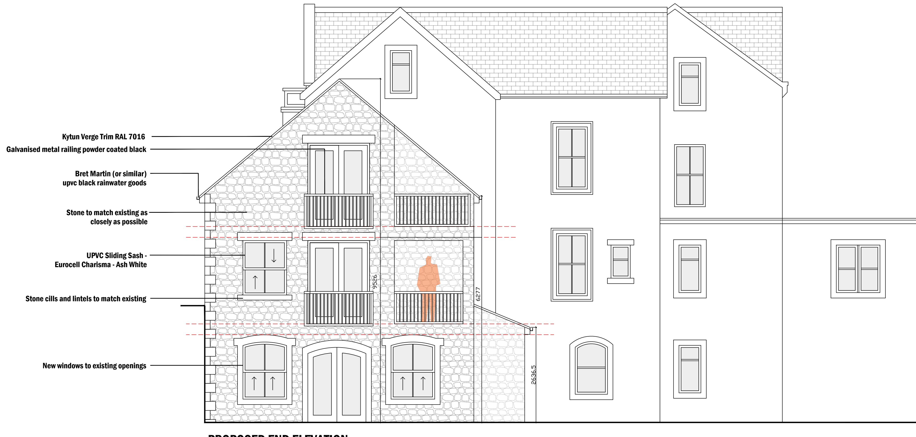
PROPOSED END ELEVATION 1:50