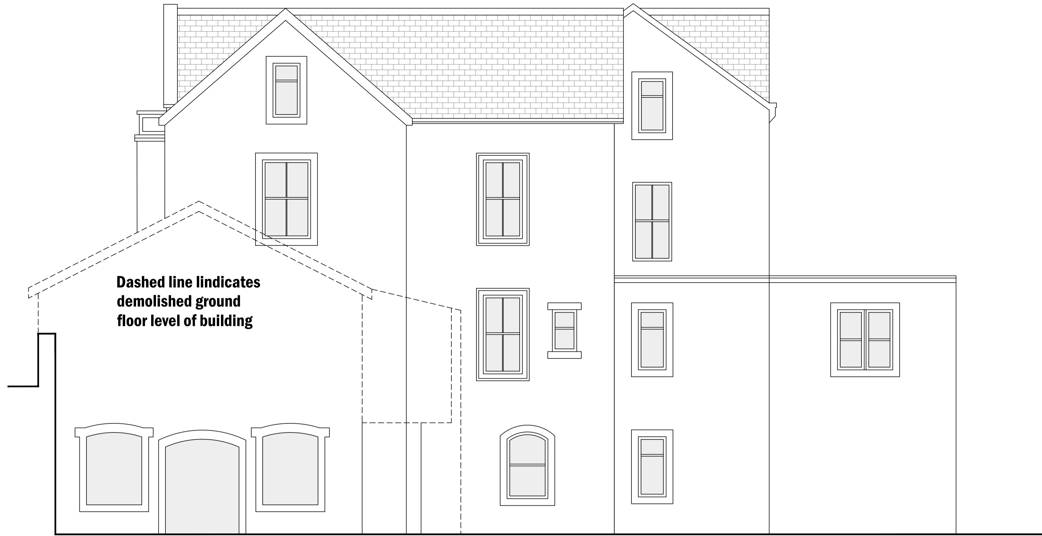
EXISTING END ELEVATION 1:50