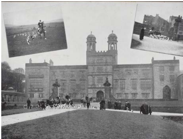
Date / period unknown