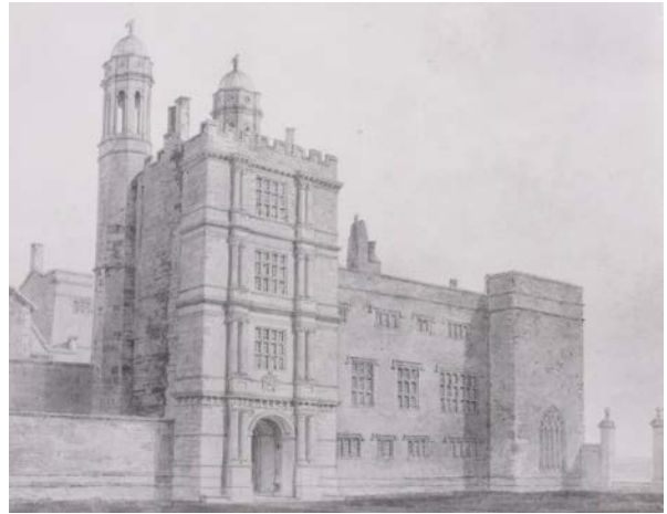
Date / period unknown