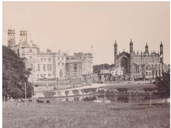
Date / period unknown