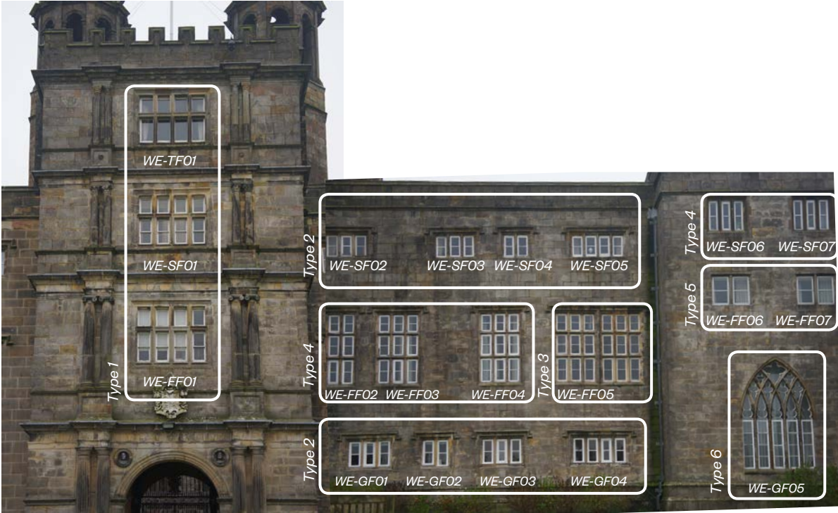
Photo of the West Elevation