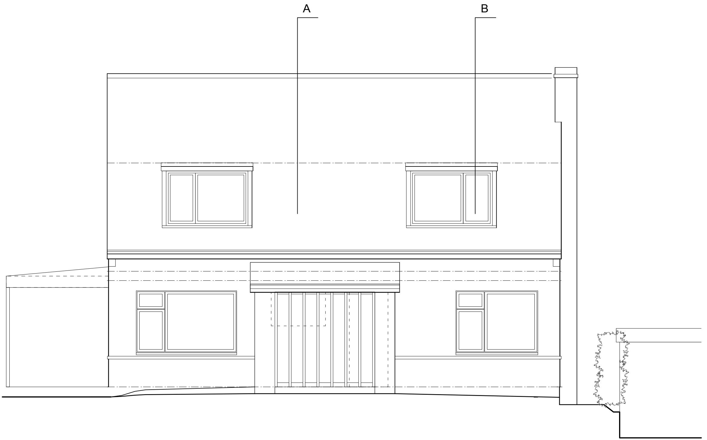
WEST ELEVATION : AS EXISTING 1 : 50