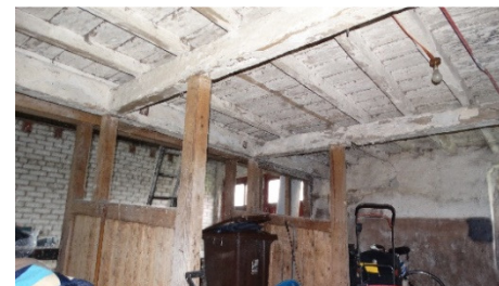
Figure 12: undercroft beneath hayloft