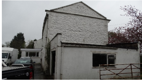
Figure 3: Side (south-west) elevation