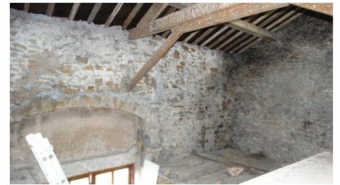
Figure 10: hayloft – south end of barn