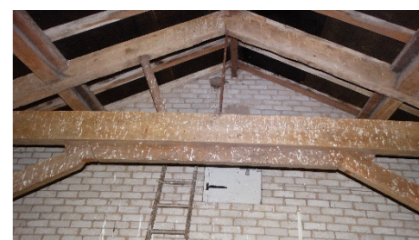
Figure 9: internal view above the garage