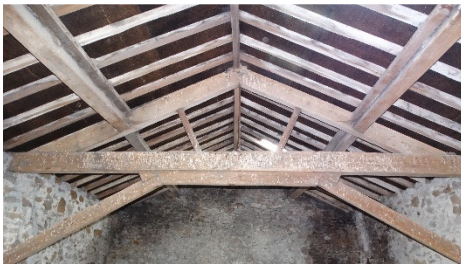
Figure 8: Barn roof bays - internal