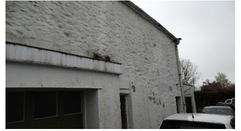
Figure 4: Rear (north-west) elevation