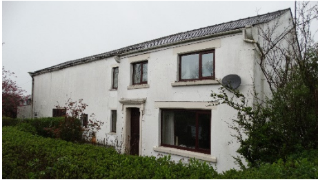
Figure 2: Front (south-east) elevation

It is understood the proposed works will include demolition of the southern part of the barn (figure 11) including the single storey lean-to garage (figure 5).