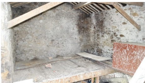
Figure 11: hay loft - south end of barn