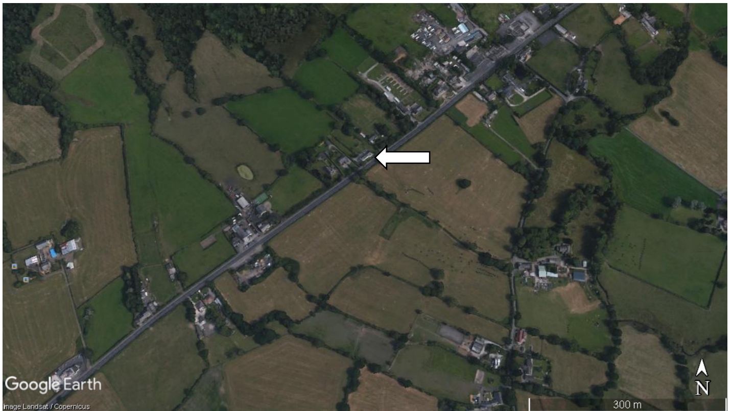
Figure 1: Location of the property (SD 660 328)

A local data search has shown there are no designated nature conservation sites immediately adjacent to the property ie. Special Areas of Conservation (SACs), Sites of Special Scientific Interest (SSSI), Biological Heritage Sites (BHS), National Nature Reserves (NNR's), Local Nature Reserves (LNR's) or Regionally Important Geological and Geo-morphological Sites (RIGS).