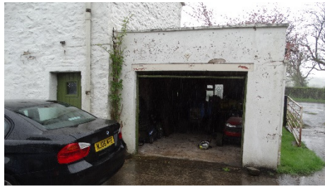
Figure 6: Garage front elevation