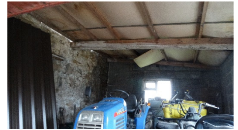
Figure 7: Garage internal