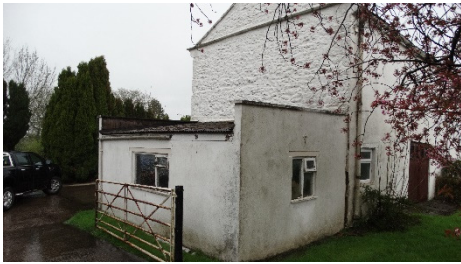
Figure 5: Lean-to garage