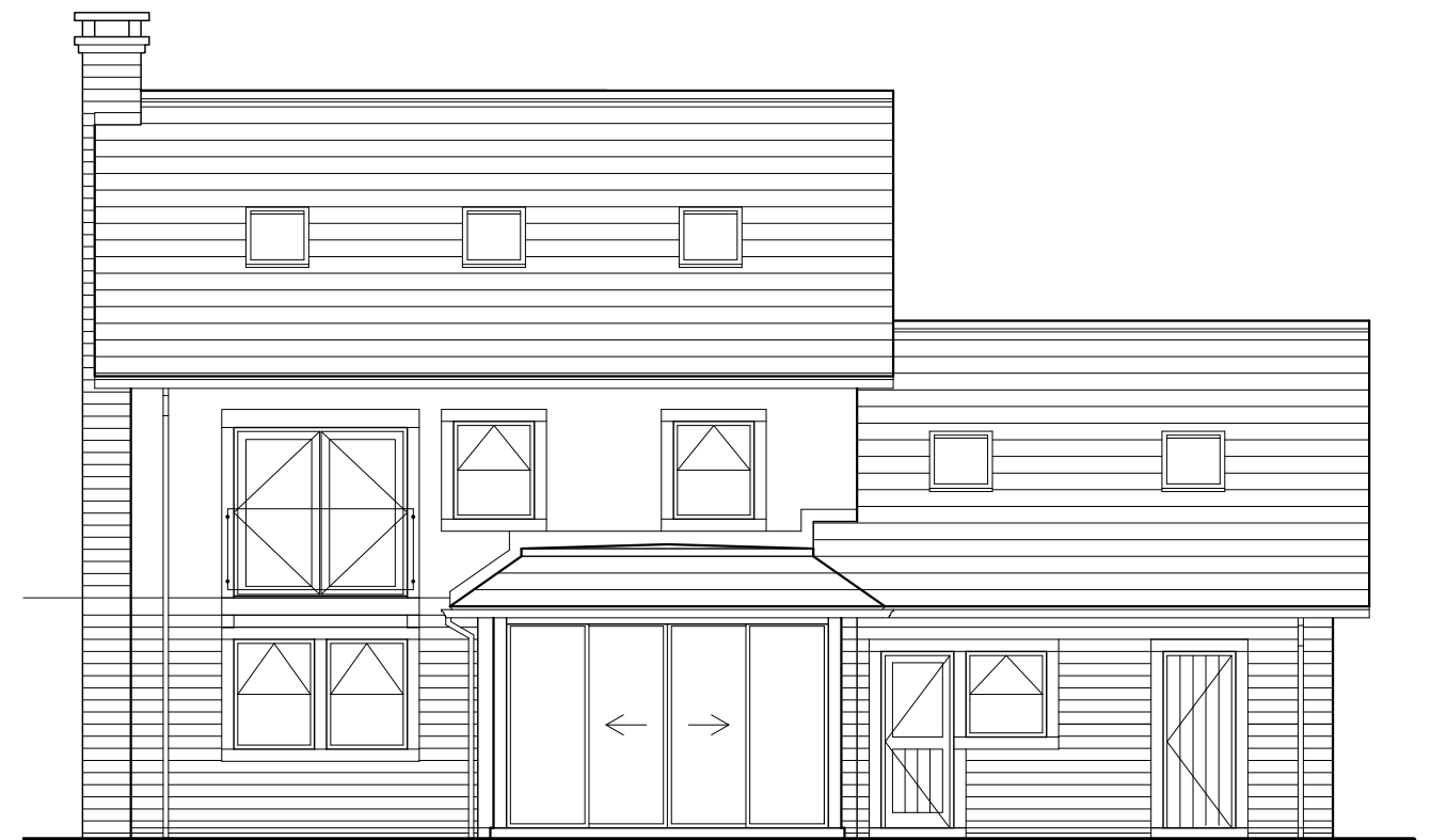
Proposed Rear Elevation 1:100 @ A3