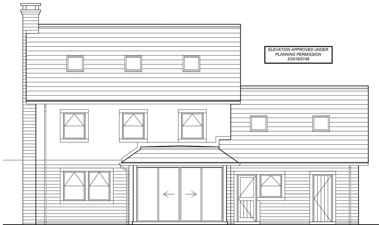
Approved Rear Elevation 1:100 @ A3