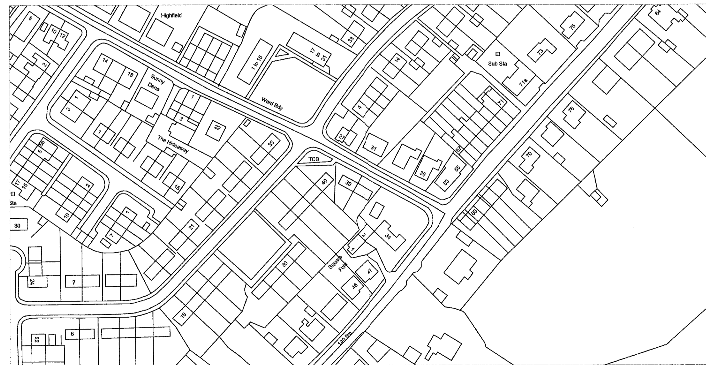
Scale 1:1250 – A1