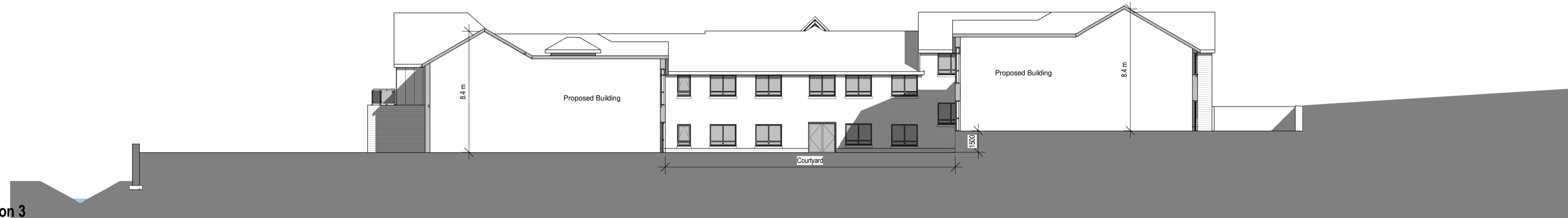
Site Section 3 1:200