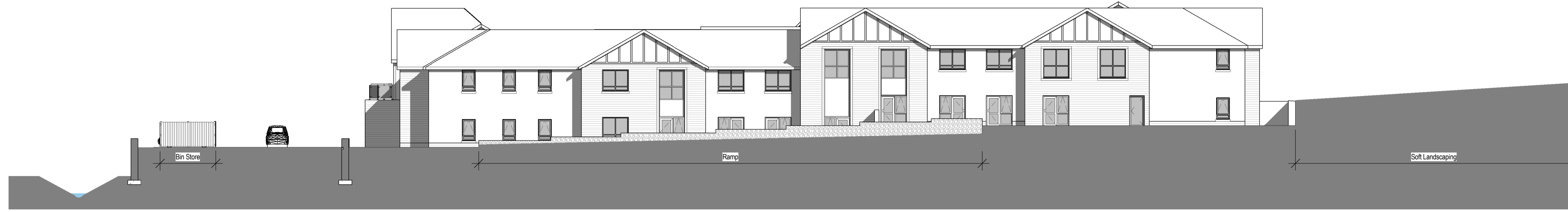
Site Section 1 1:200