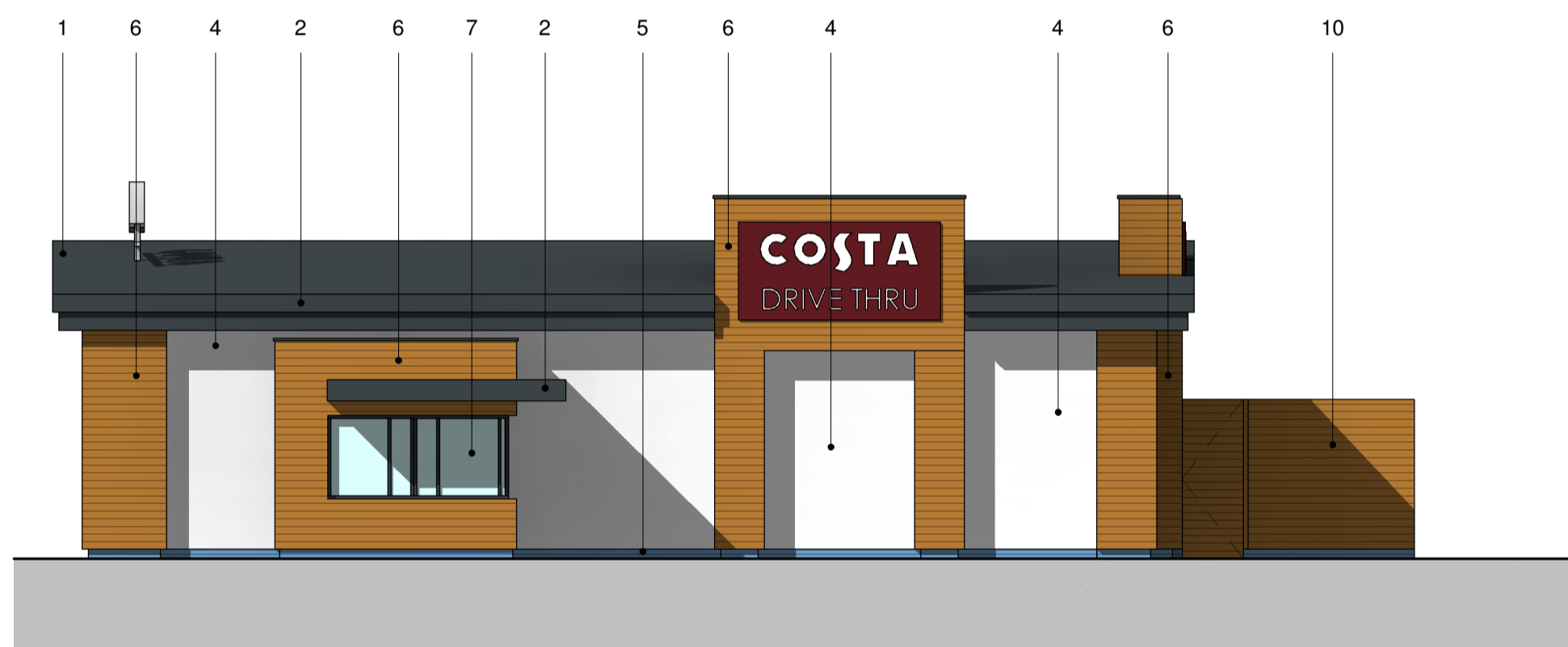
East - Proposed 1 : 100