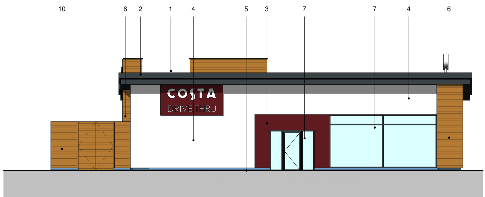
West - Proposed 1 : 100