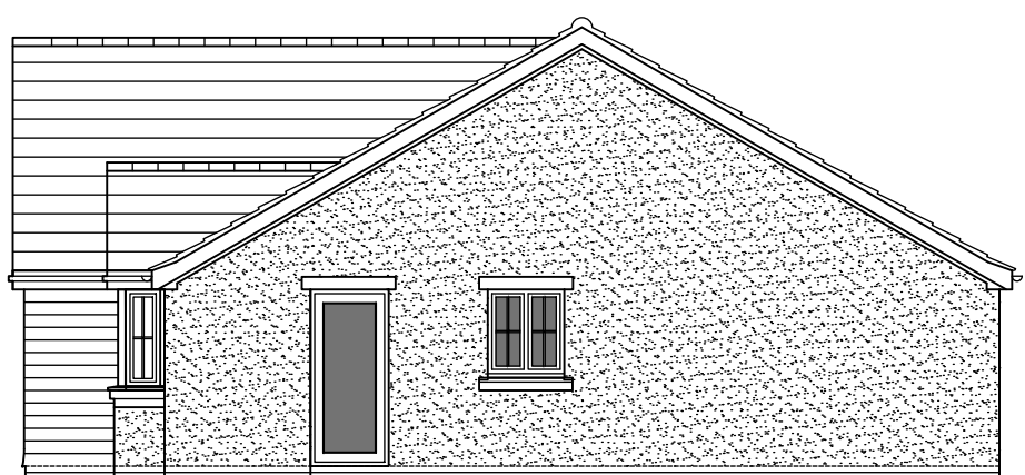
SIDE ELEVATION - TUDOR BOARDED 1:100