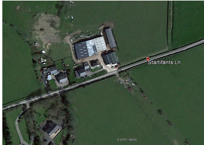
Close View of the site