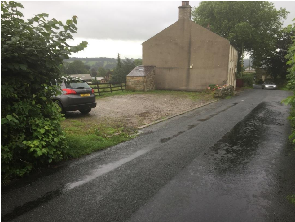
Car park to north