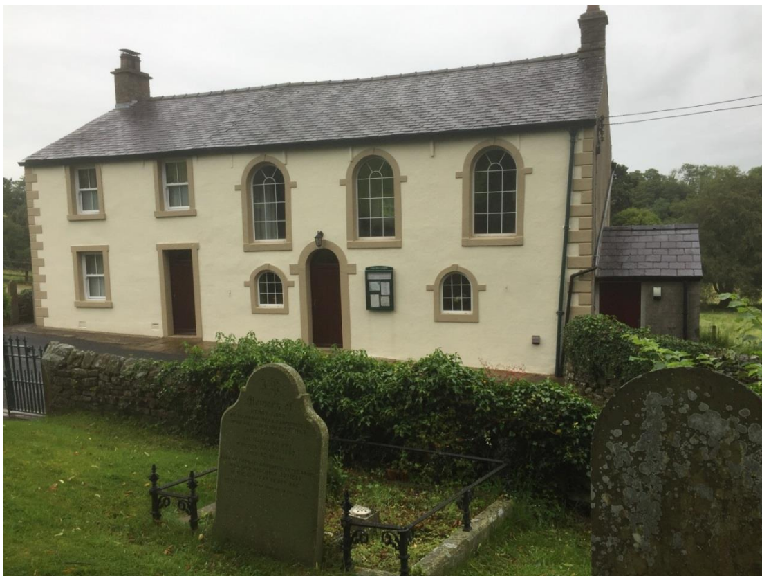
Holden Chapel and adjoining house