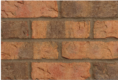
Facing Material – Forterra Woodside Mixture