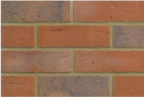
Facing Material – Forterra Arden Special Reserve