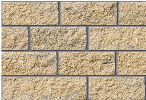
Facing Material – Edenhall Darlstone Split Black Buff