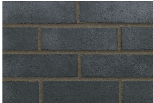
Detail Material – Forterra Wilnecote Smooth Blue