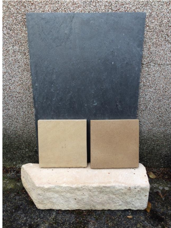
Pl. 1 Photograph showing buff textured natural stone for all external walls which would be laid to random coursed varying from 65, 90, 115 and 140mm courses (no quoins), below samples of dressed natural buff stone for all window / door surrounds, string coursing and chimney cap detailing. It also shows how this would appear next to the proposed natural blue slate (Spanish) for all pitched roofs (shown behind the stone).