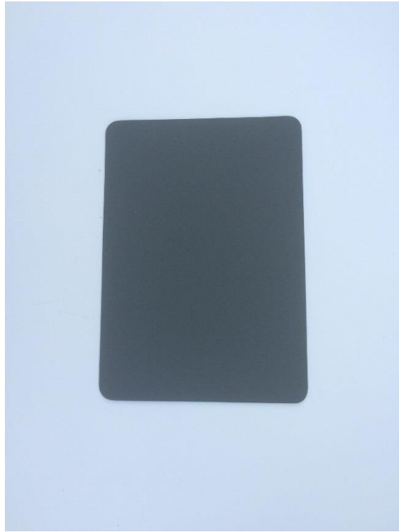
Pl. 5 Dark grey waterproof roof membrane for the single storey kitchen extension