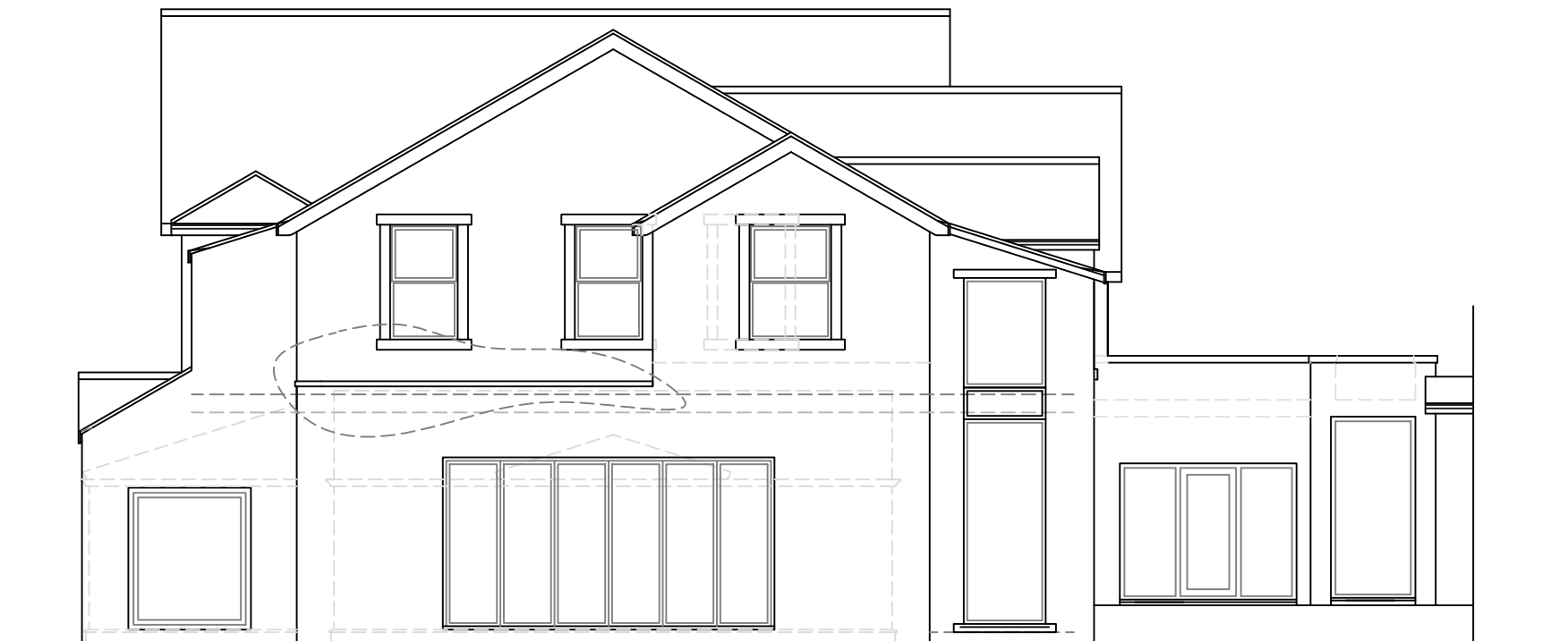
PROPOSED REAR ELEVATION 'D'

REV 'A' 16.03.20 BALUSTRADE REMOVED FROM ROOF TOP TO REAR SINGLE STOREY EXTENSION, FRONT ELEVATION, (SOUTH) AMENDED AS PER EMAIL, (16/03/20) REFER ALSO BUBBLED AREAS.