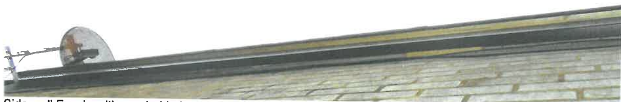
Side wall Fascia with gap behind