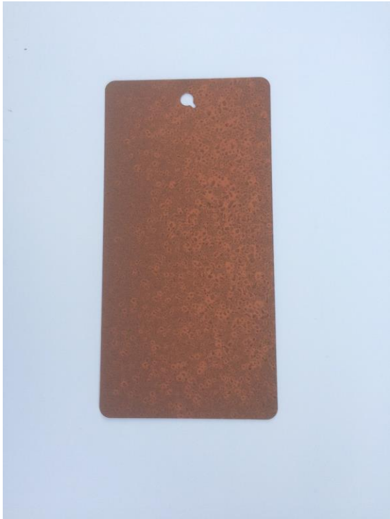
Pl. 3 Kingspan Facades Oxidised 006 powder coated (Corten steel appearance) aluminium horizontal tray wall cladding panels to finish the front sitting room walls