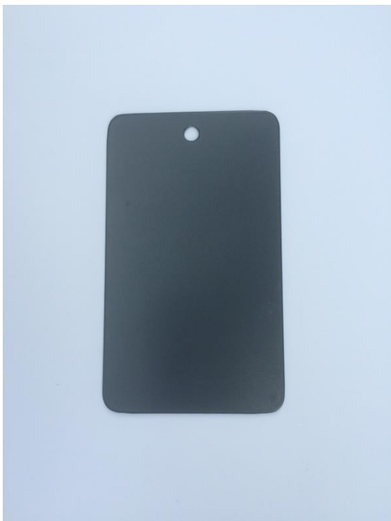
PI. 6 RAL 7016 colour powder coated aluminium for all window and door frames, exposed rainwater and soil pipes, roof eaves/ verge cladding, trims and louvre framework