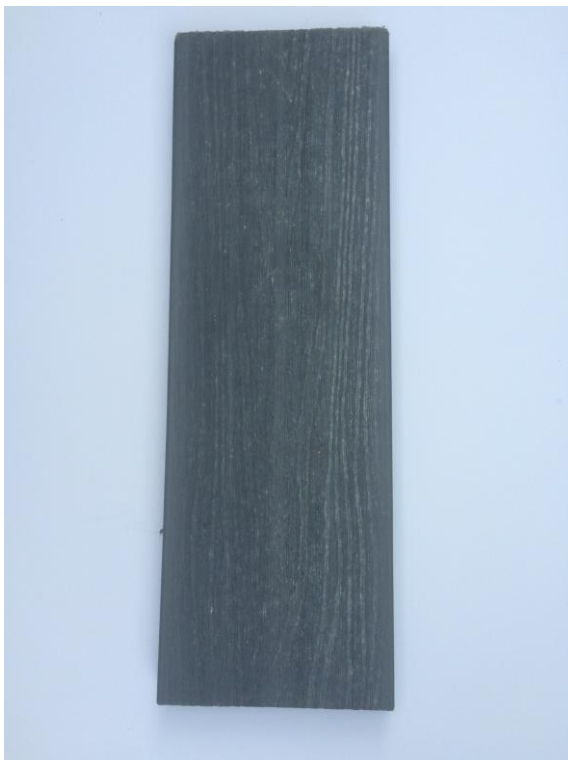
Pl. 4 Slate grey colour solid core composite decking to the first floor roof garden and upper ground floor balcony floors