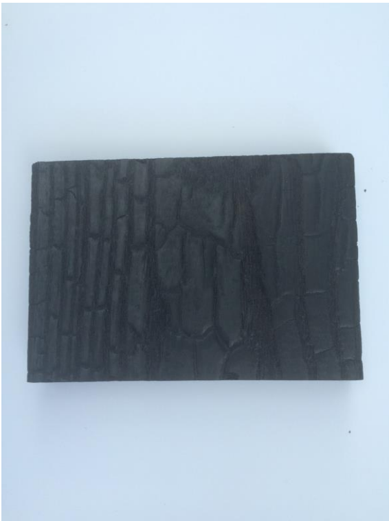
Pl. 2 Heavy charred timber vertical boarding to clad all of the first floor extension walls and overhanging soffit and also for the vertical louvre slats