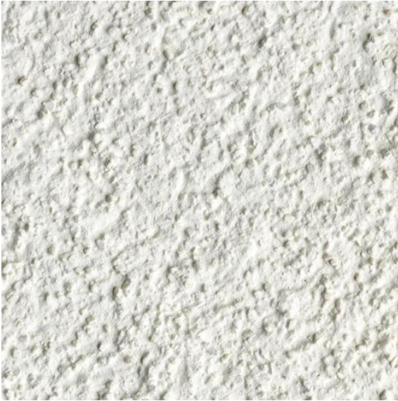
Pl.1 Off white self-coloured thin coat render for all lower and upper ground floor walls