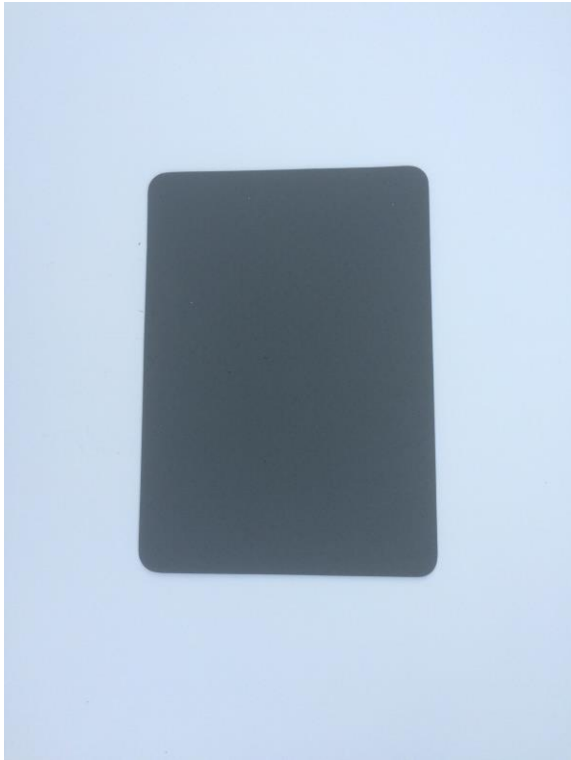
PI. 5 Dark Grey roof membrane finish to all roofs