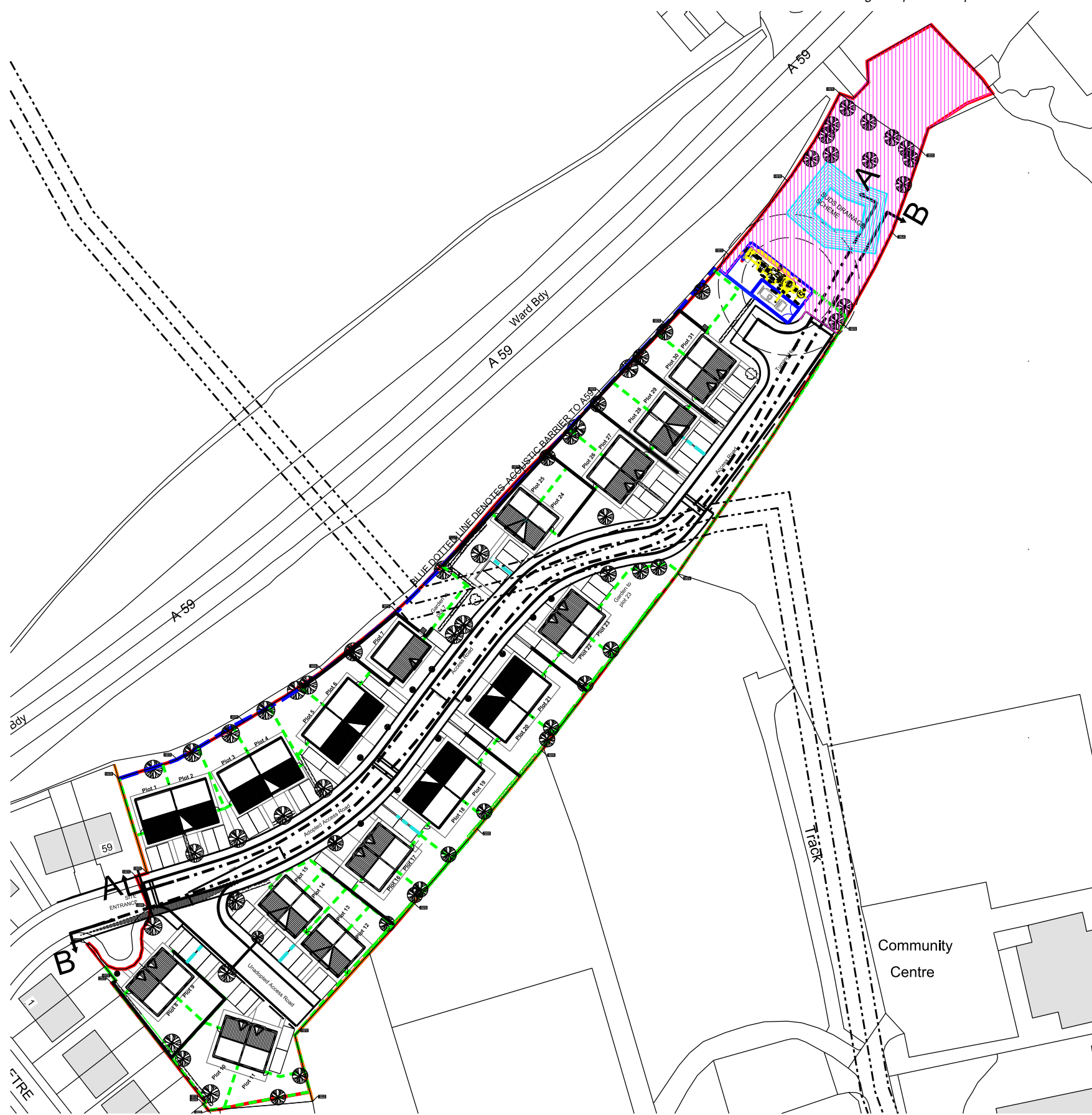
Site Plan NTS See Drawings L03 + L04 for scaled plans