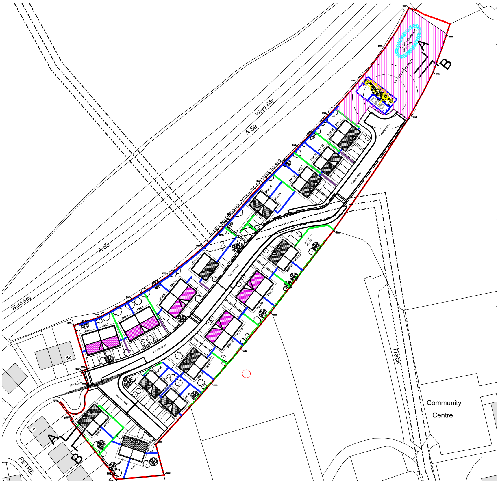
Site Plan NTS