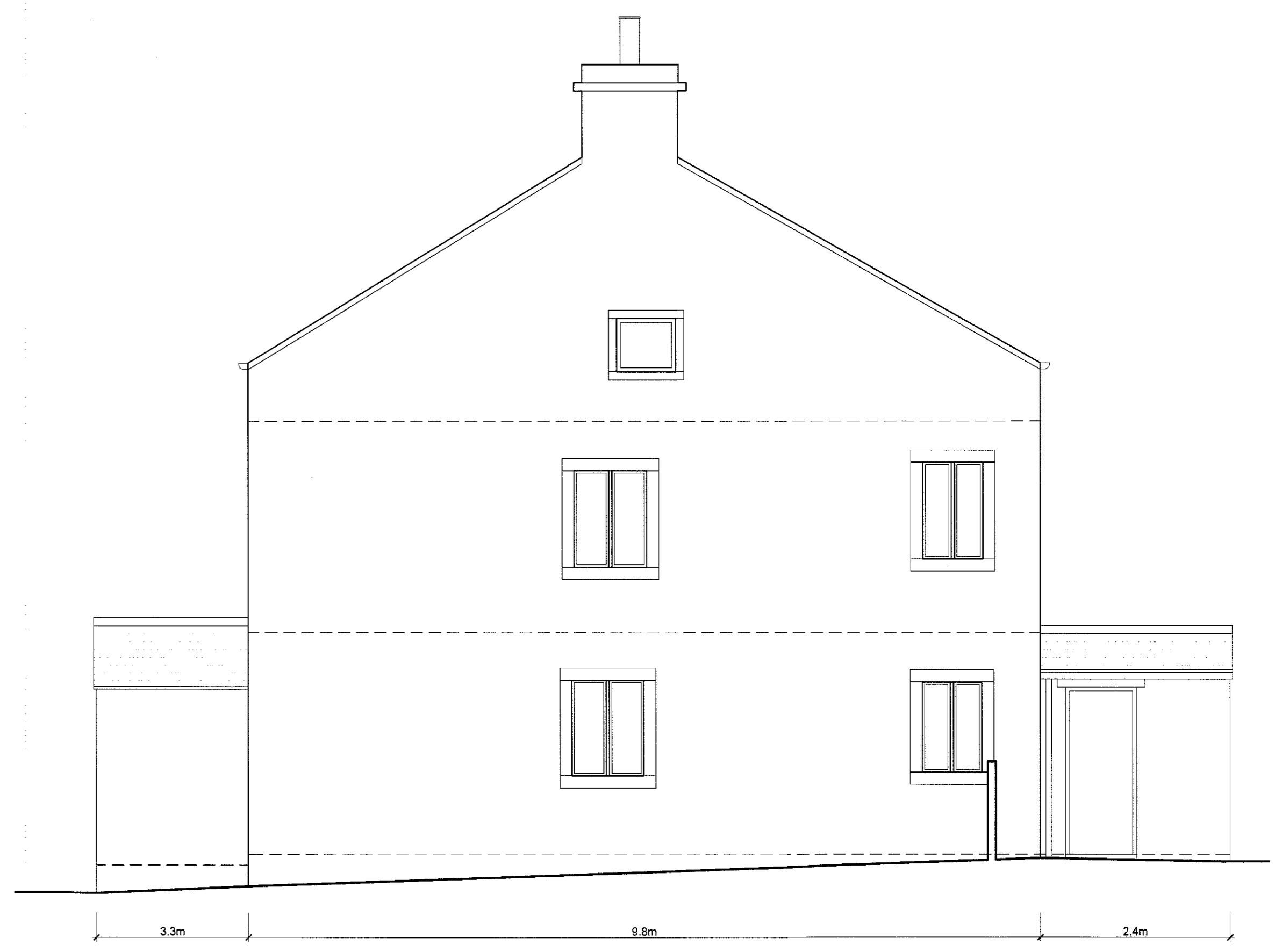
EXISTING SOUTH ELEVATION Scale 1:50