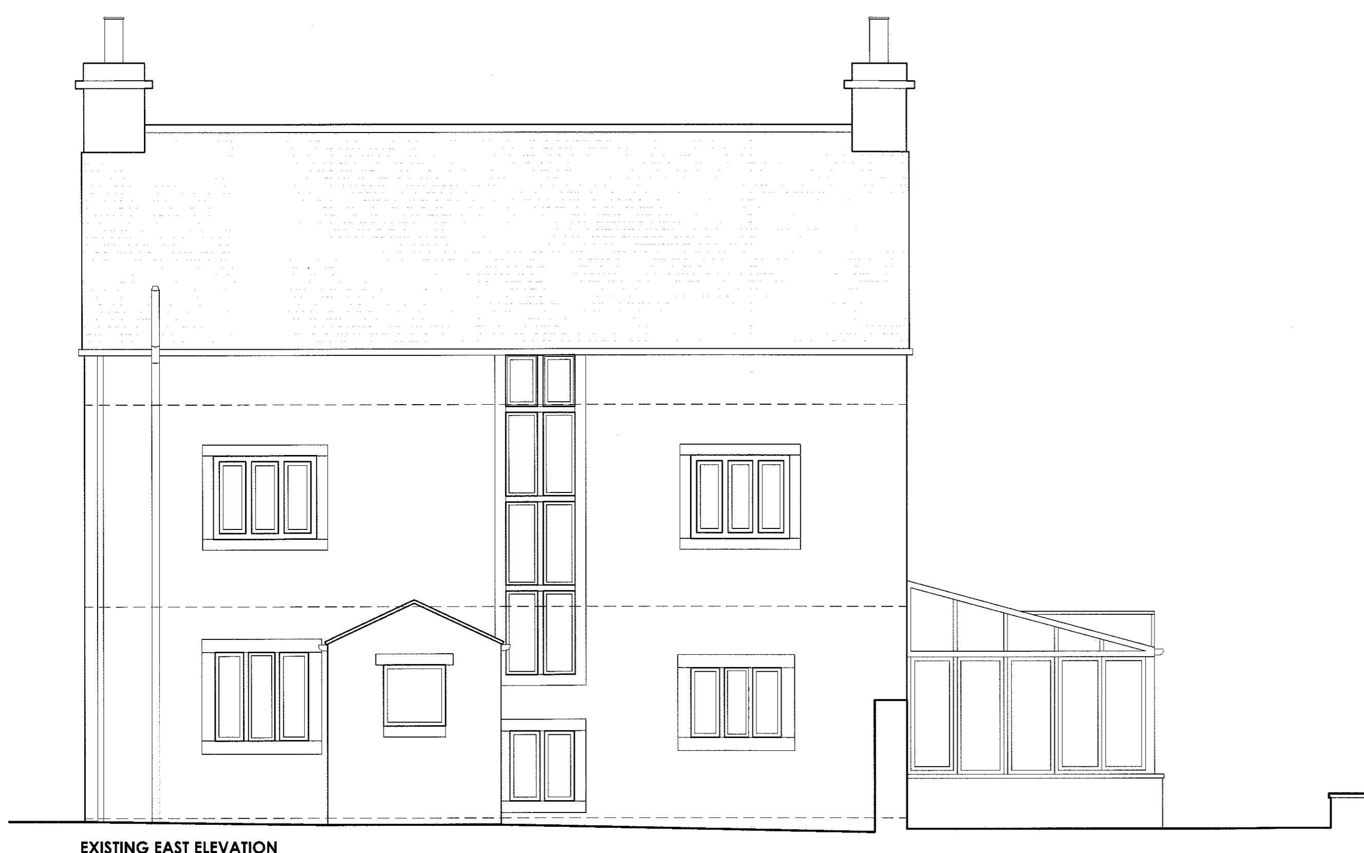
EXISTING EAST ELEVATION Scale 1:50