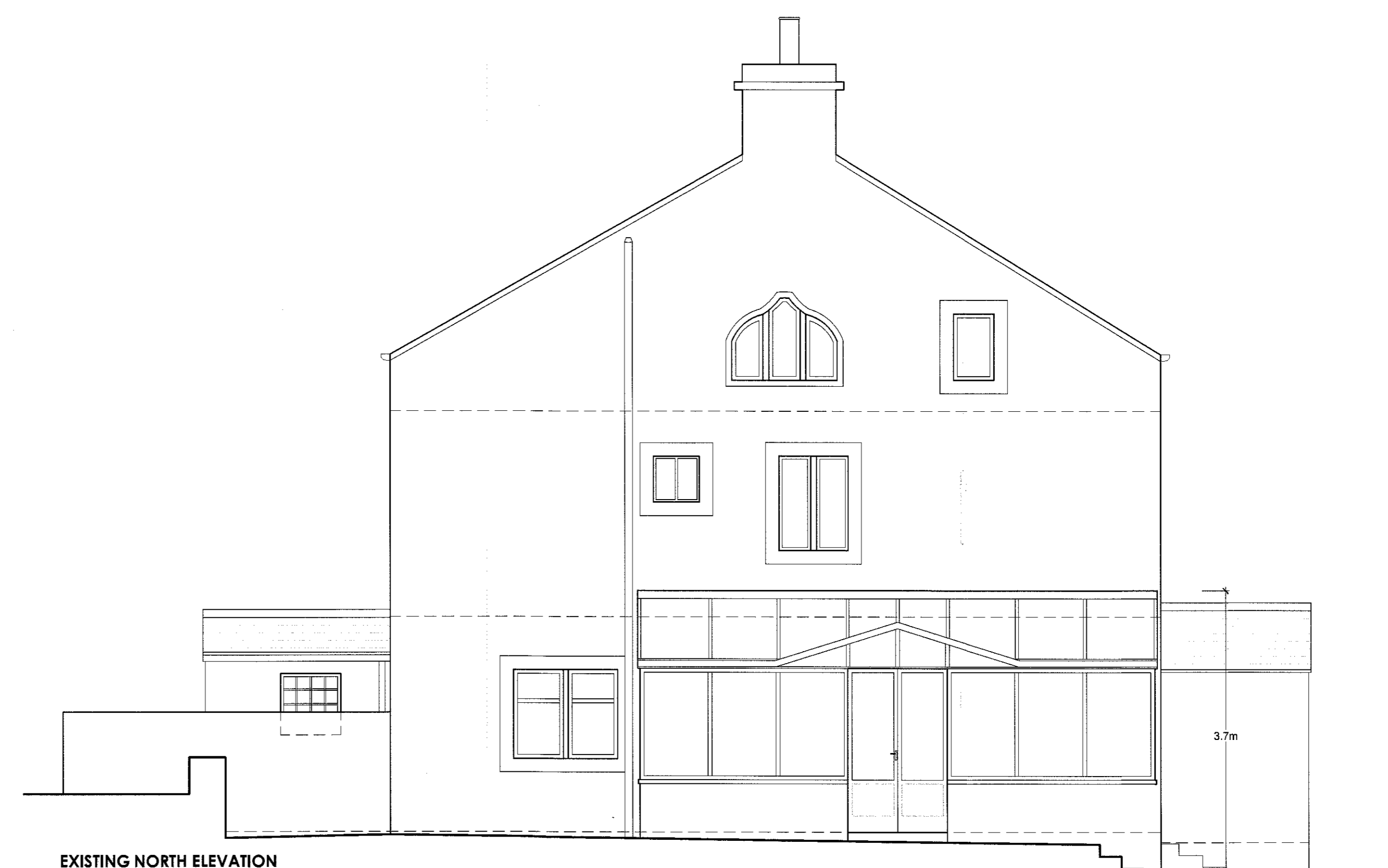
EXISTING NORTH ELEVATION Scale 1:50