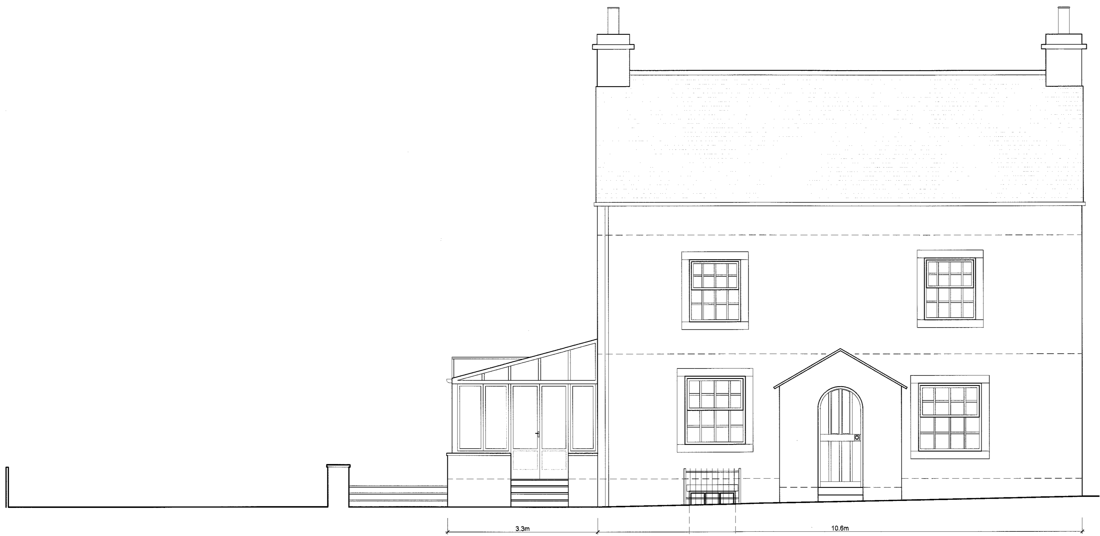
EXISTING WEST ELEVATION Scale 1:50

This drawing is to be read in conjunction with all relevant Architect, consultant and specialist drawings and specifications. The Architect is to be notified of any discrepancies before proceeding. Do not scale from this drawing. All dimensions and levels are to be checked on site. This drawing is subject to copyright. All work carried out before Planning and Building Permission has been granted is at the contractor's risk.