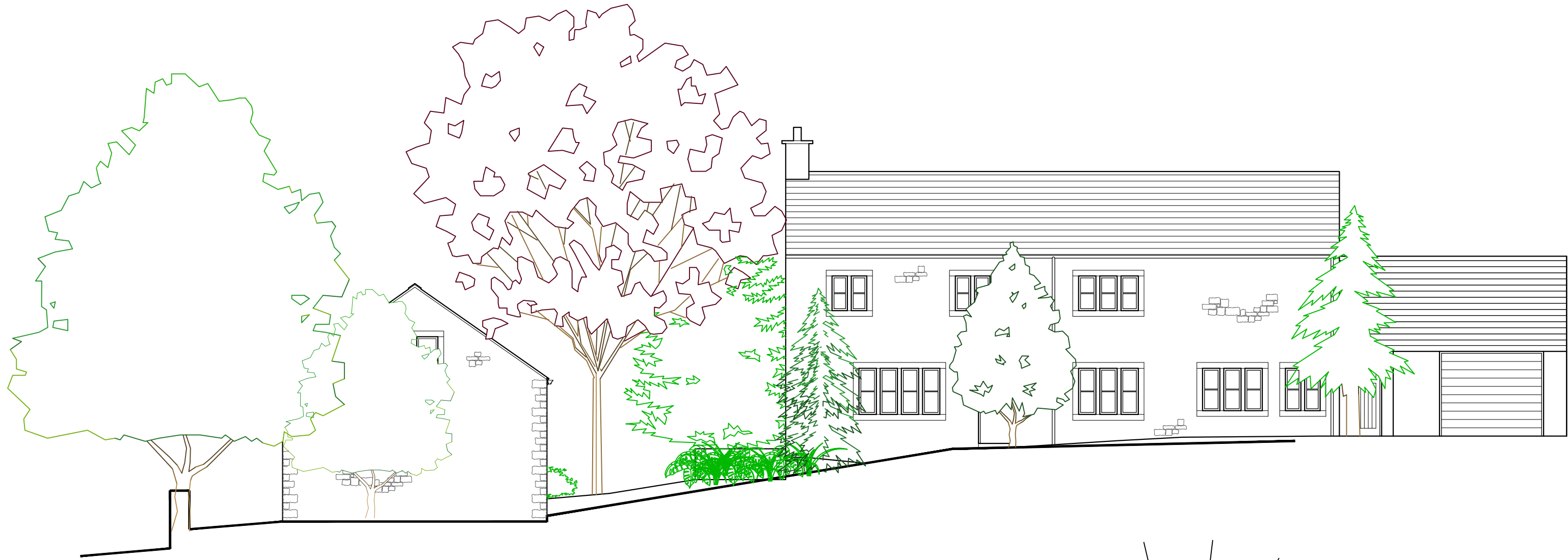
0 2 4 6m PROPOSED EAST FACING ELEVATION SCALE 1:100