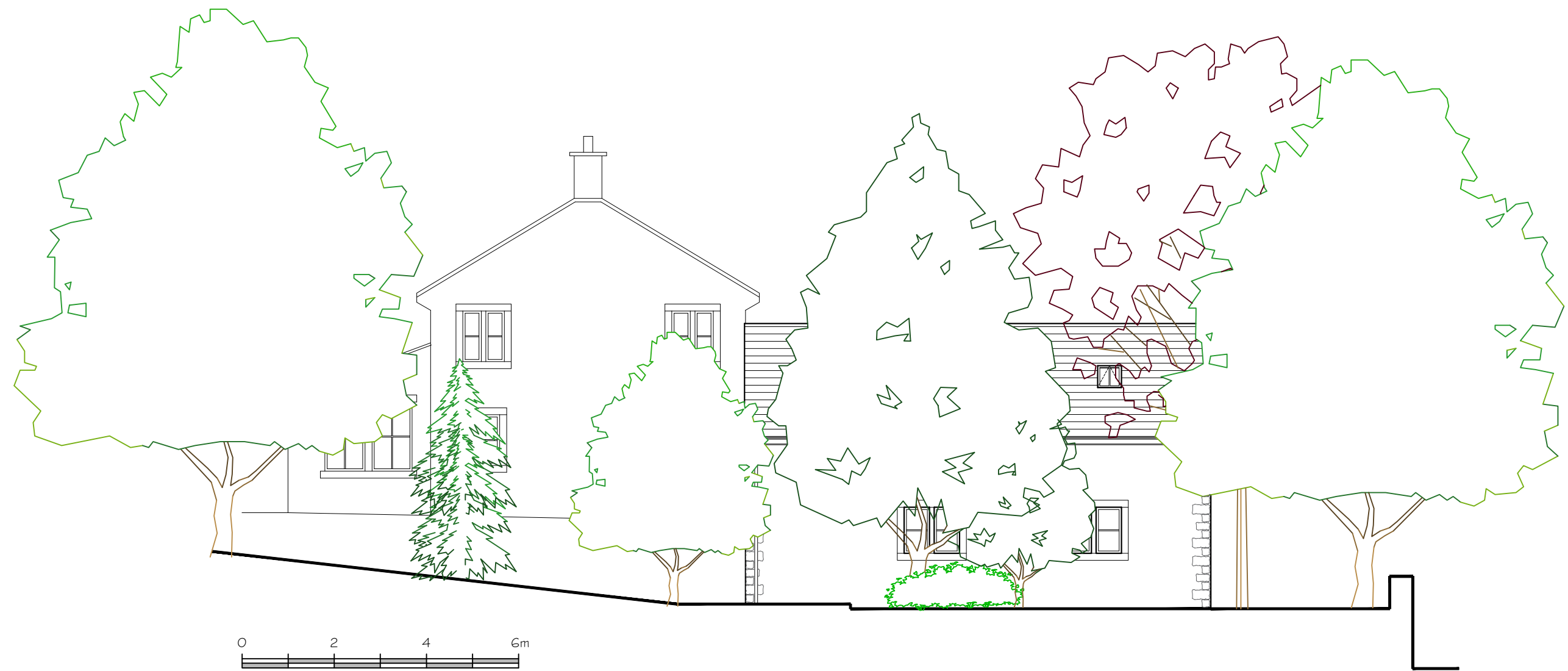
0 2 4 6m PROPOSED SOUTH FACING ELEVATION SCALE 1:100