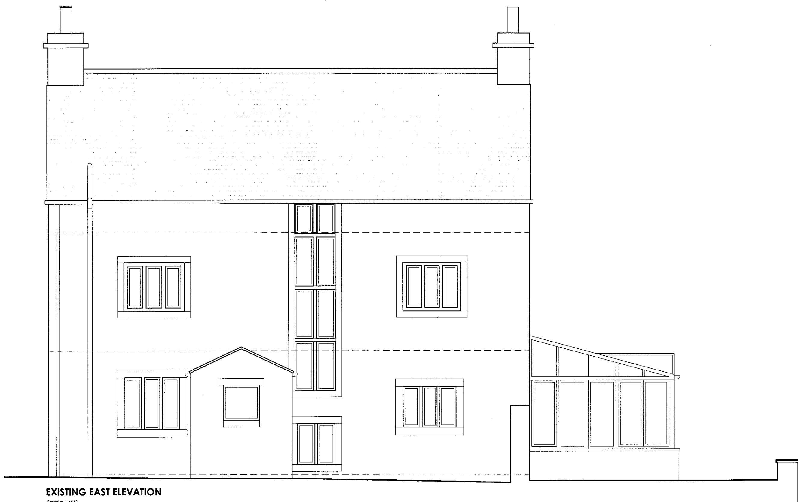
EXISTING EAST ELEVATION Scale 1:50