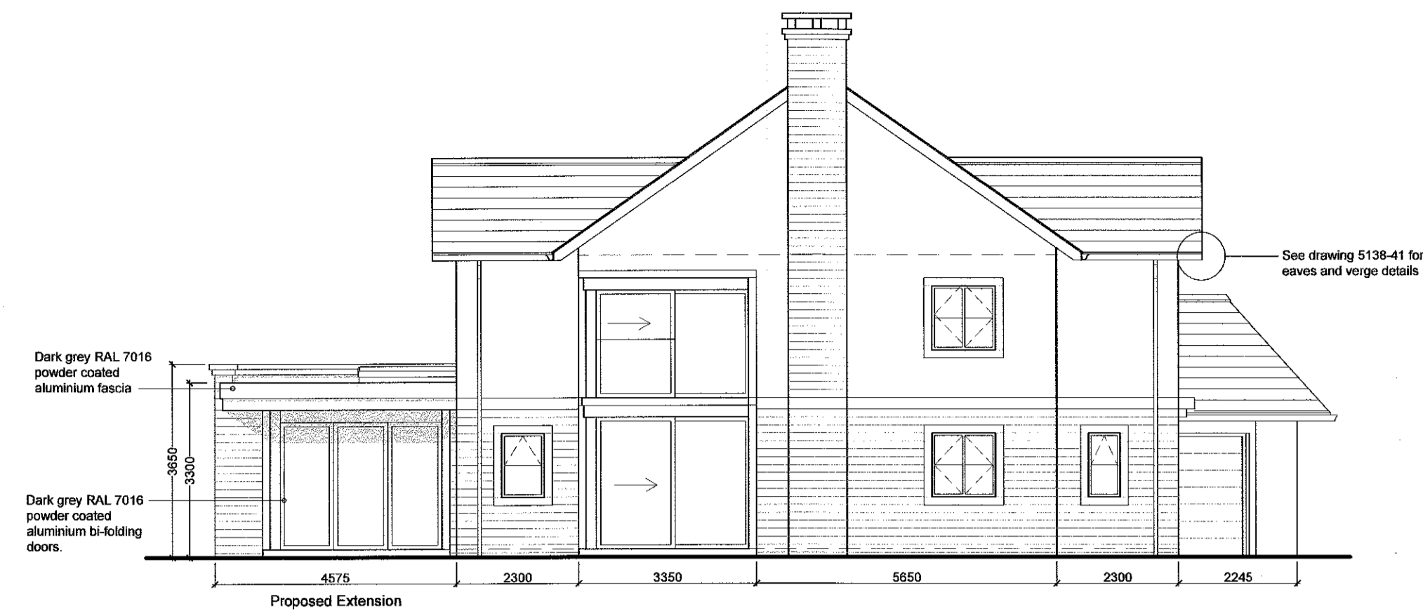
South West Elevation 1:100 Scale