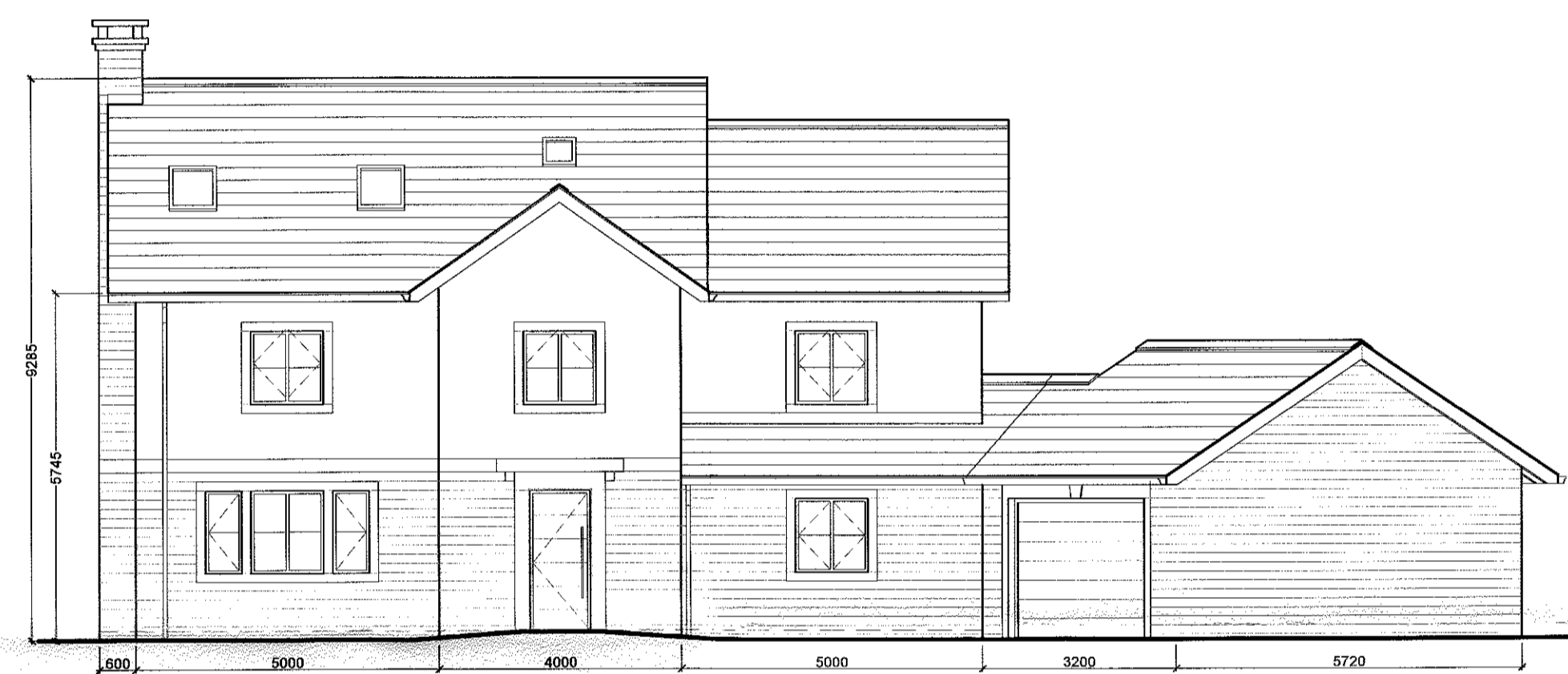
South East (Front) Elevation 1:100 Scale