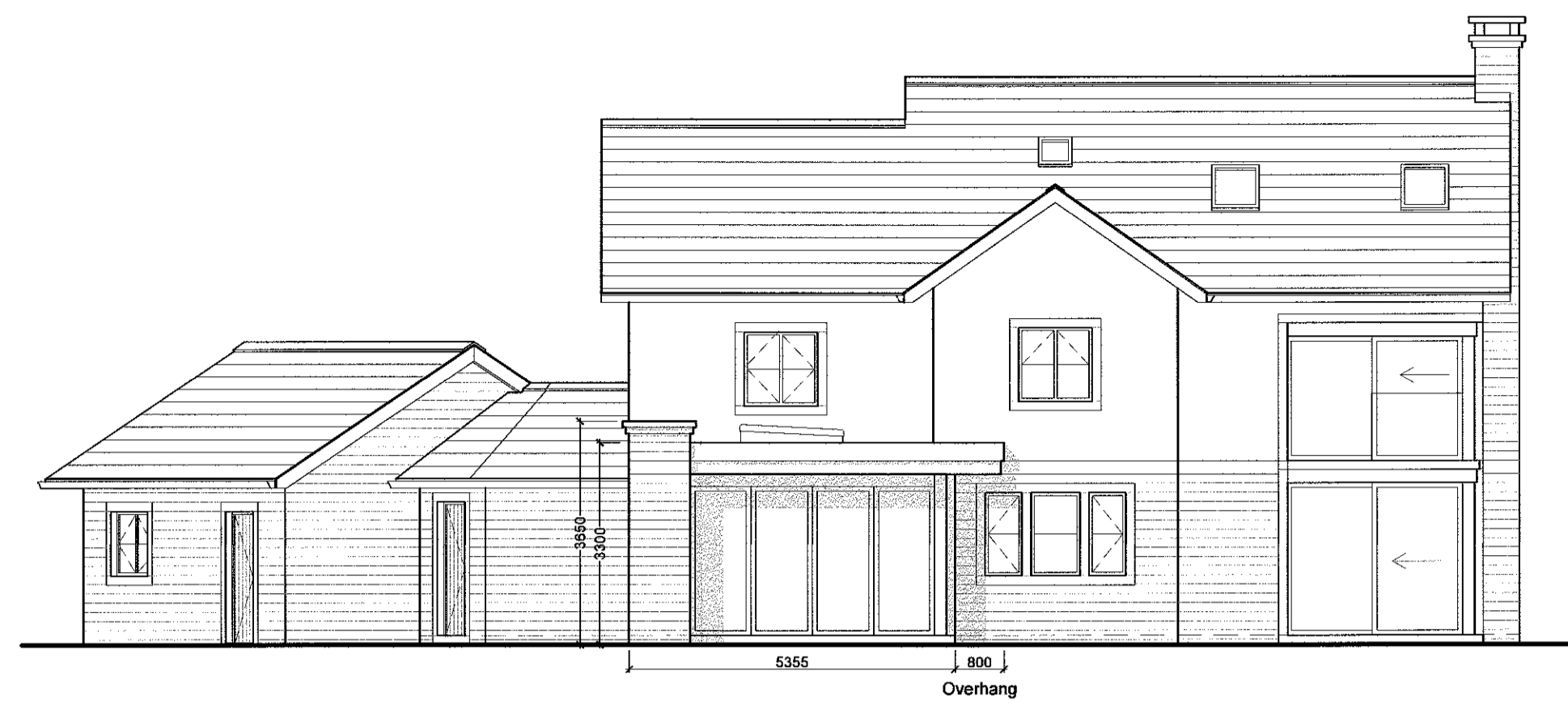
North West (Rear) Elevation 1:100 Scale