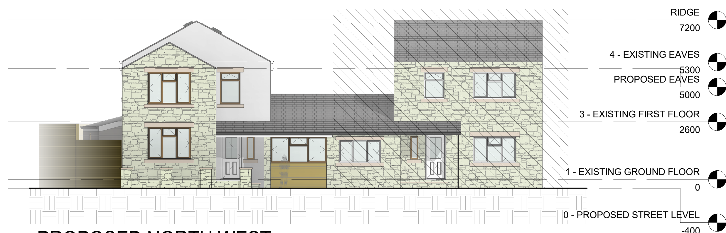
3 PROPOSED NORTH WEST 1 : 100