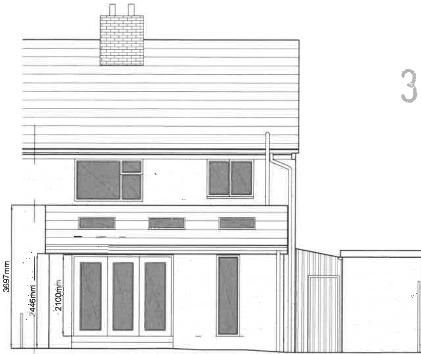
Proposed Rear (South) Elevation