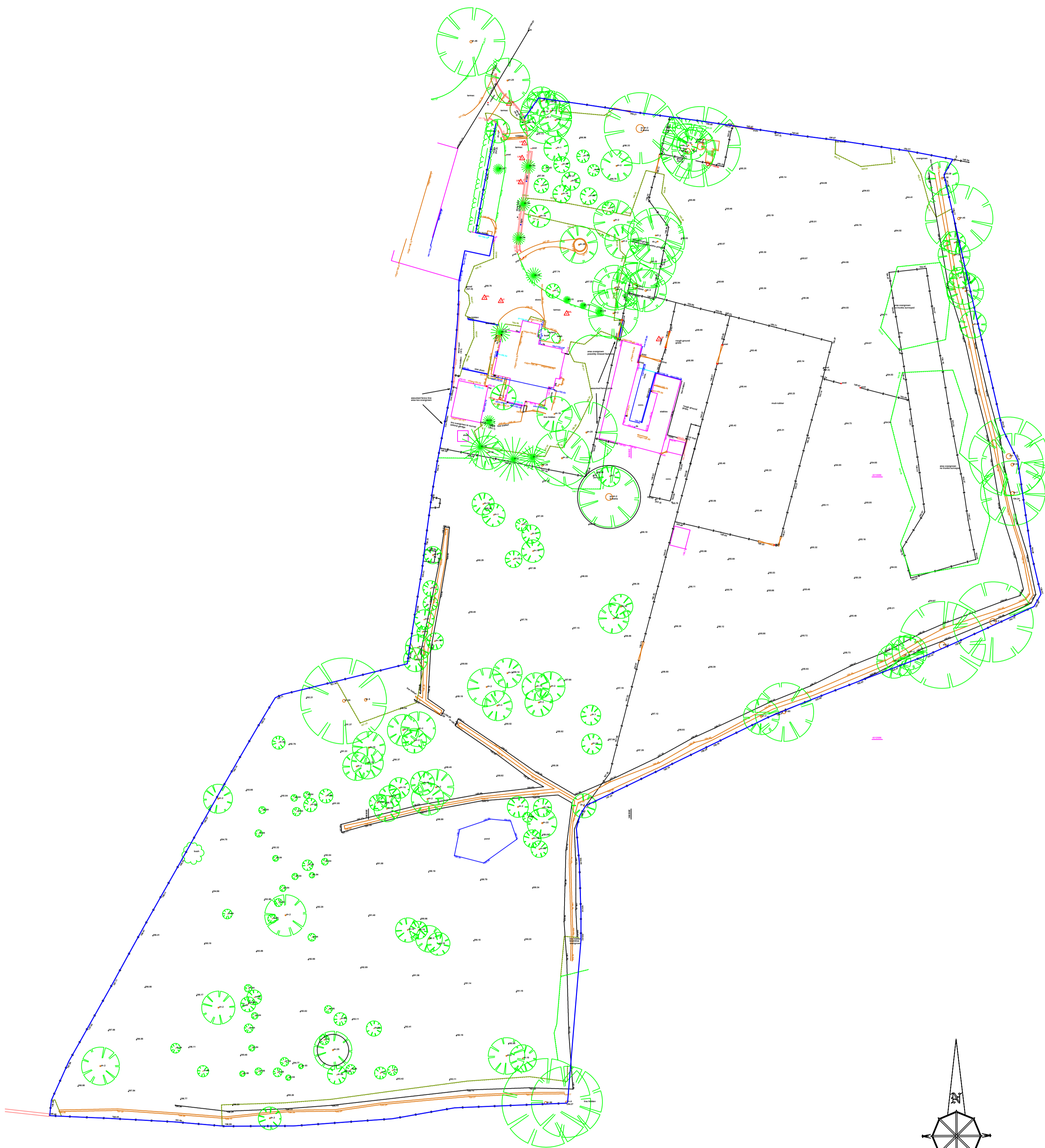
Existing Site Plan with Topographical Data - 1:500