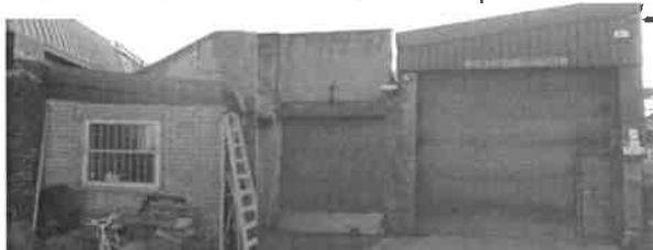
Elevation to Watt st

The building is a semi detached ad hoc industrial unit which has functioned constantly as a workshop, formally a sheet metal workers and a future joiners workshop. The original section with its traditional north light roof has been extended at a later date with a steel portal section to the north end.