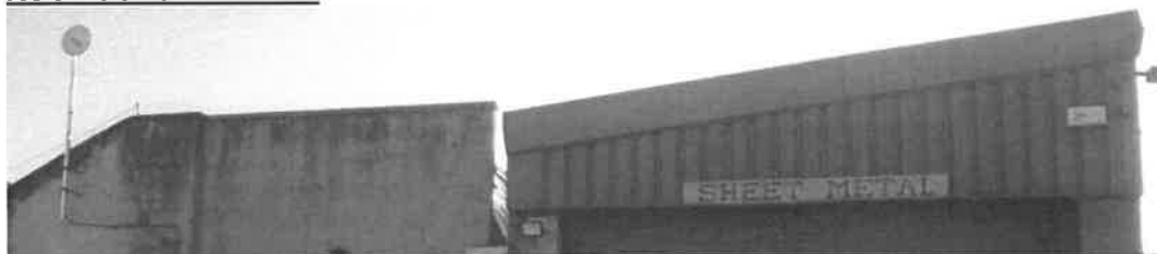
The roof construction consists of traditional north light structure with slate finish over timber rafters and steel beams. A steel sheet finish over steel portal frame.