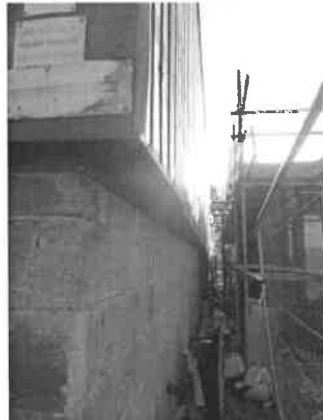
West and south wall random stone flush pointed portal frame walls block base walls with steel cladding.( North boundary)