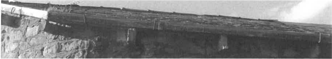
South pitch of north light.