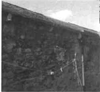
Section of the traditional mill building south wall on the back street