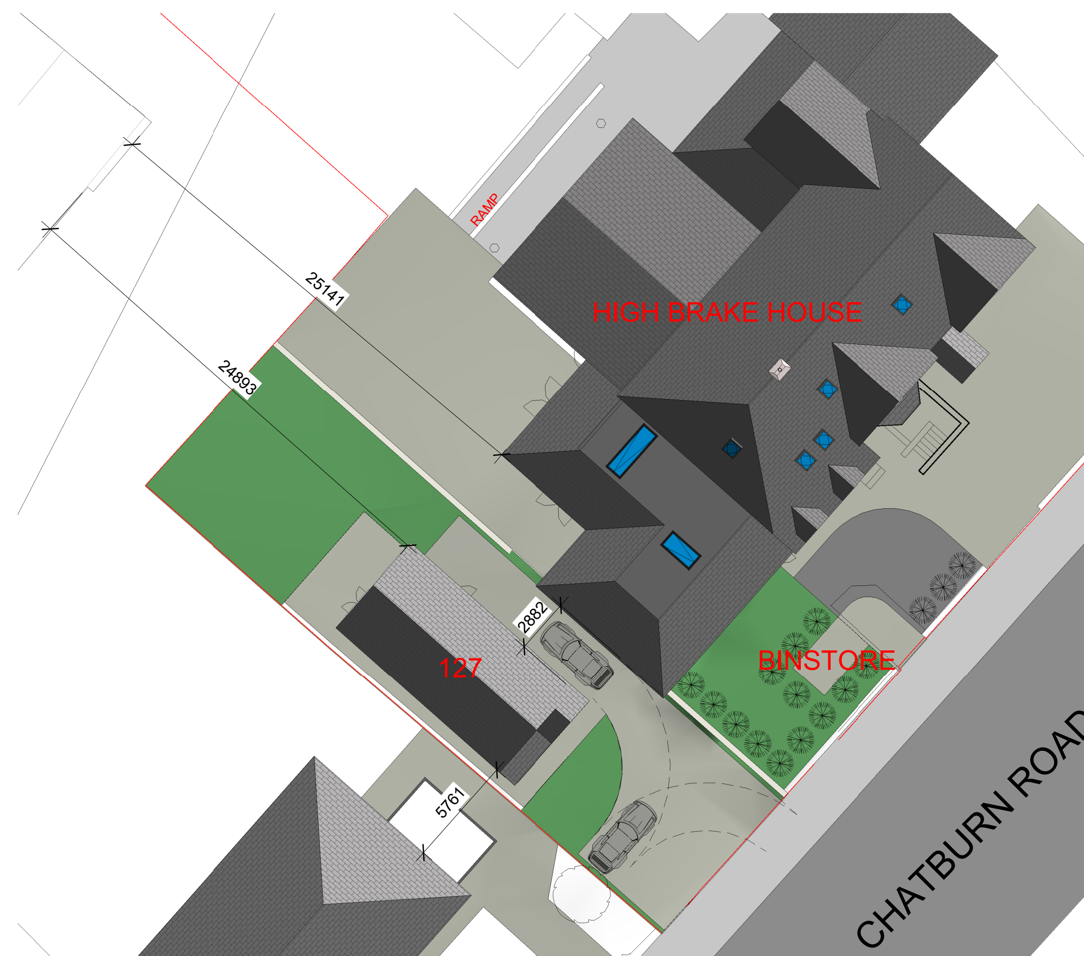
2 PROPOSED SITE PLAN 1 : 200